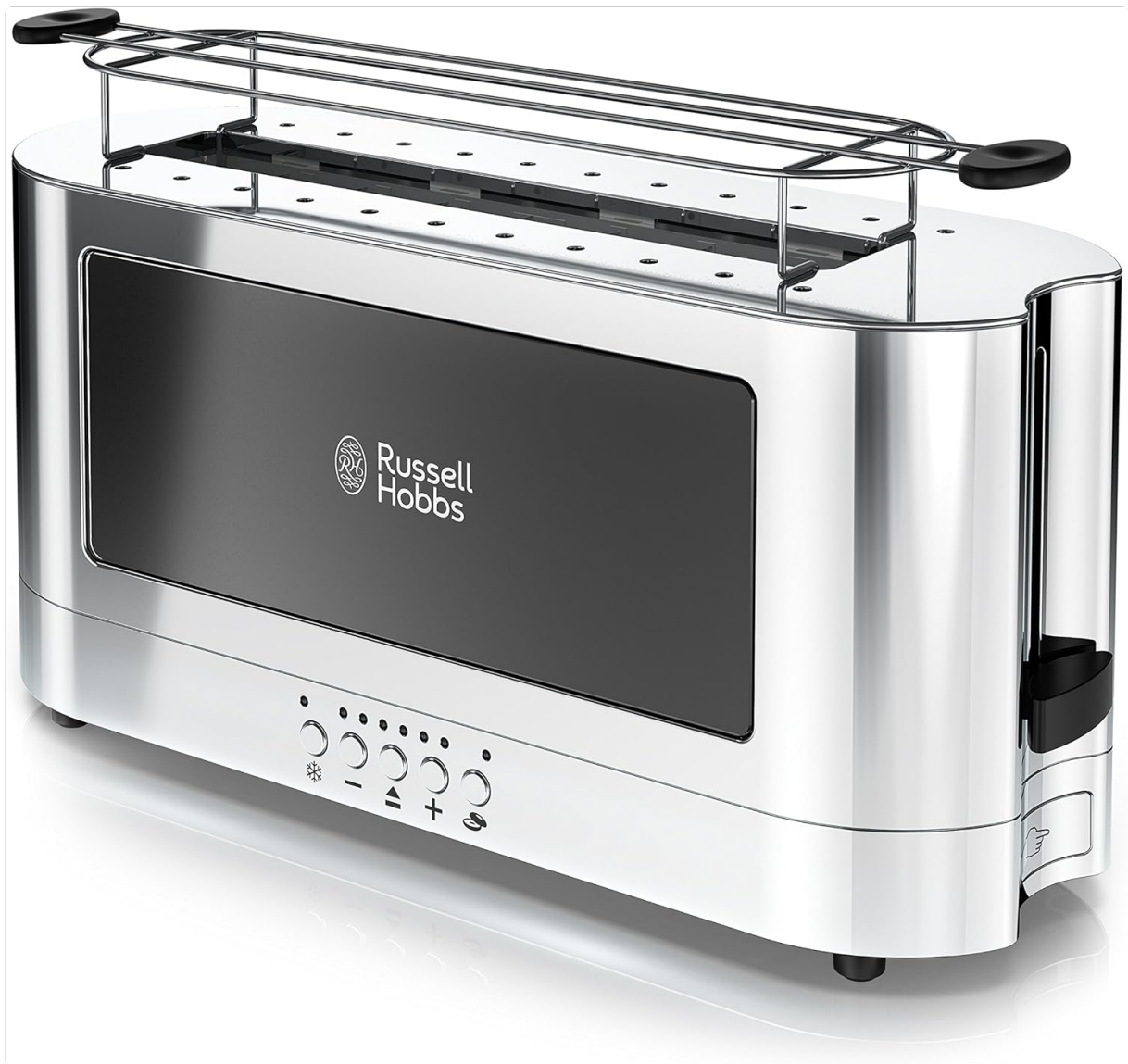
Image 1.1: The Russell Hobbs TRL9300BKR 2-Slice Glass Accent Long Toaster, showcasing its sleek design and integrated bun warmer.