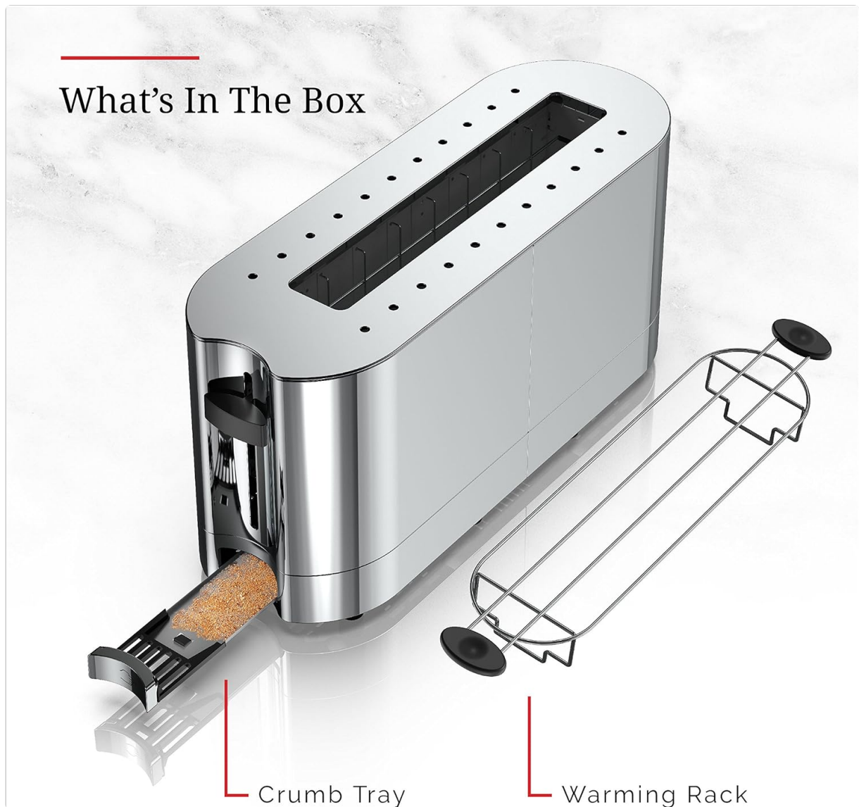
Image 3.1: Illustration of the toaster's removable crumb tray and warming rack.