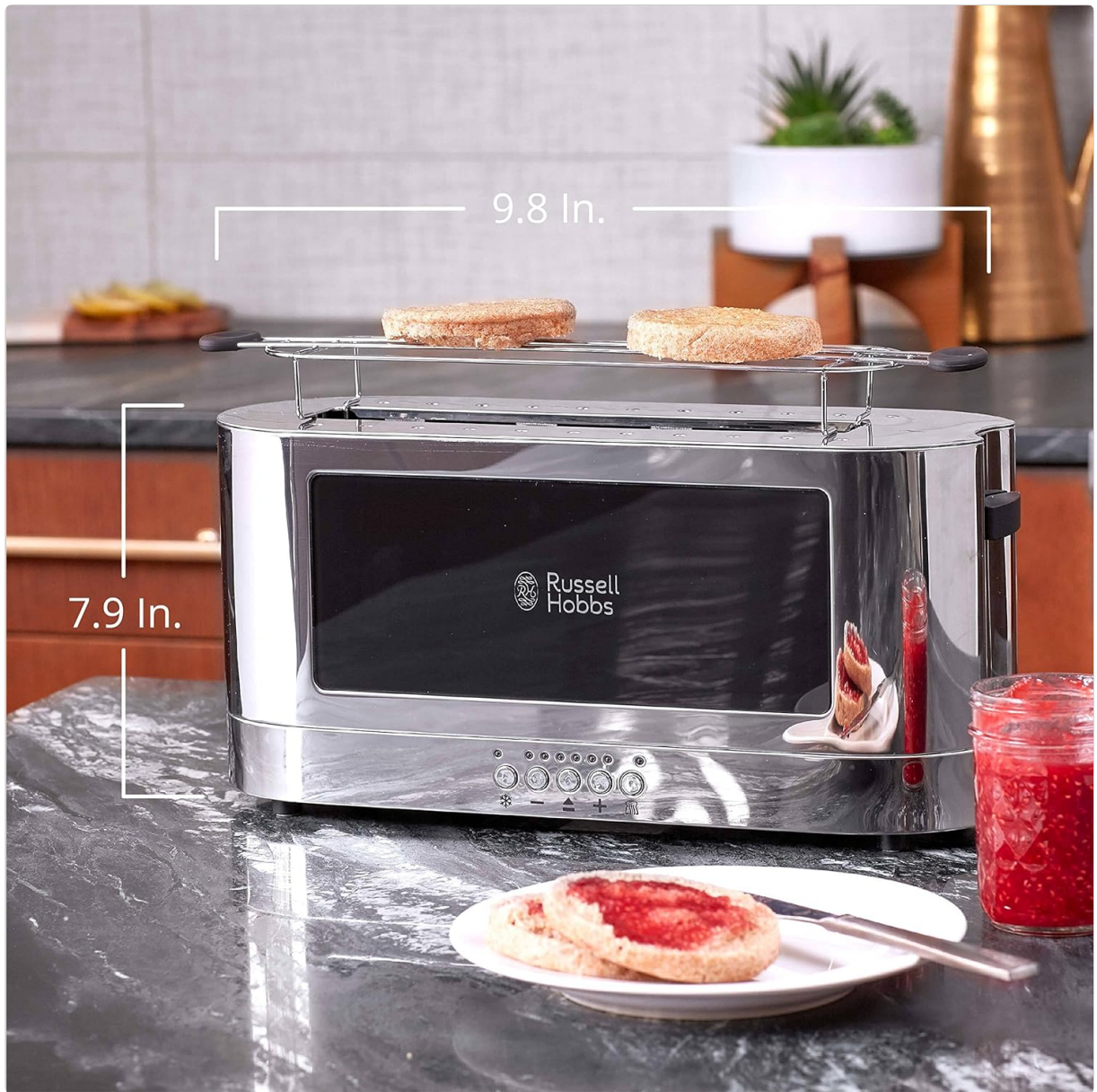
Image 4.4: The toaster with the removable bun warmer attached, warming pastries.