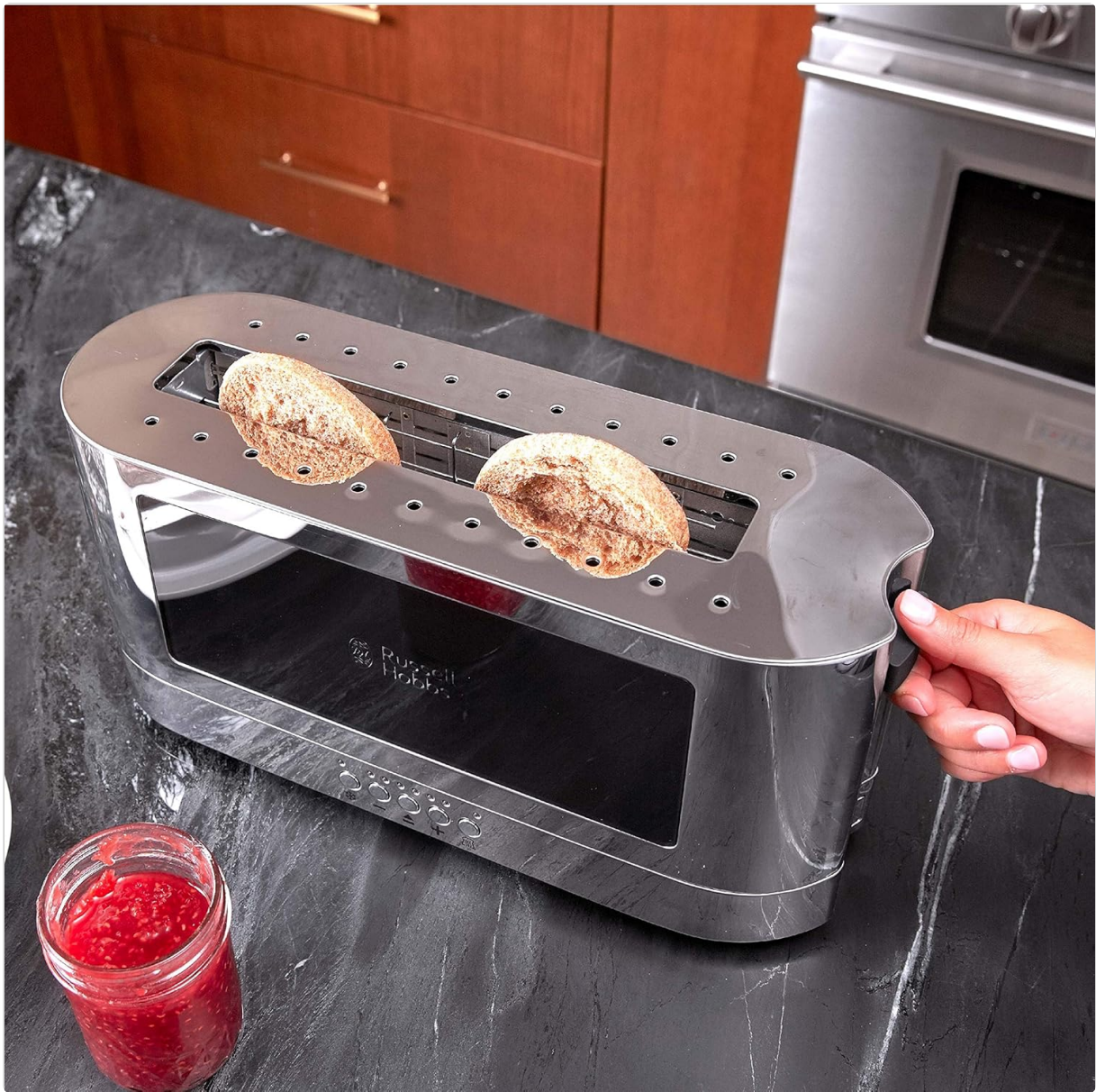
Image 4.1: The toaster in operation, demonstrating its long slots for various bread types.