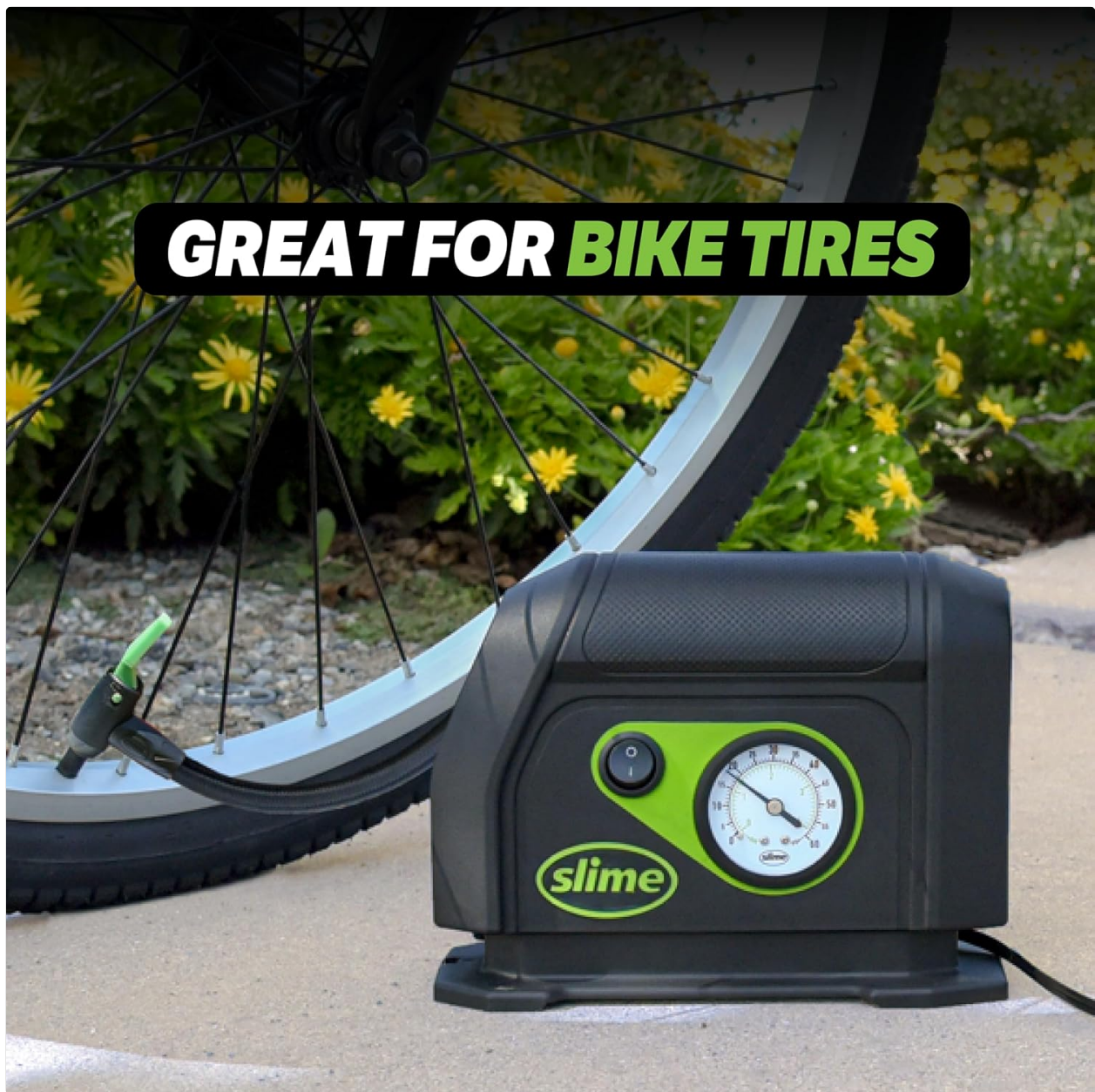
Figure 5: The inflator is also suitable for bicycle tires and other small inflatables.