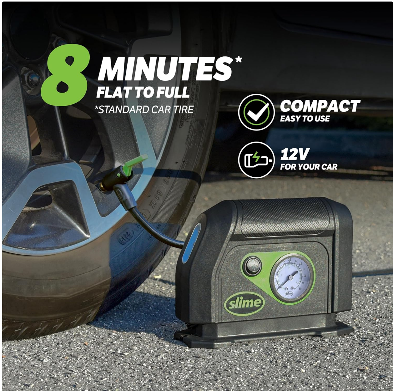
Figure 4: The Slime 40050 Tire Inflator in action, demonstrating its quick inflation capability for car tires.