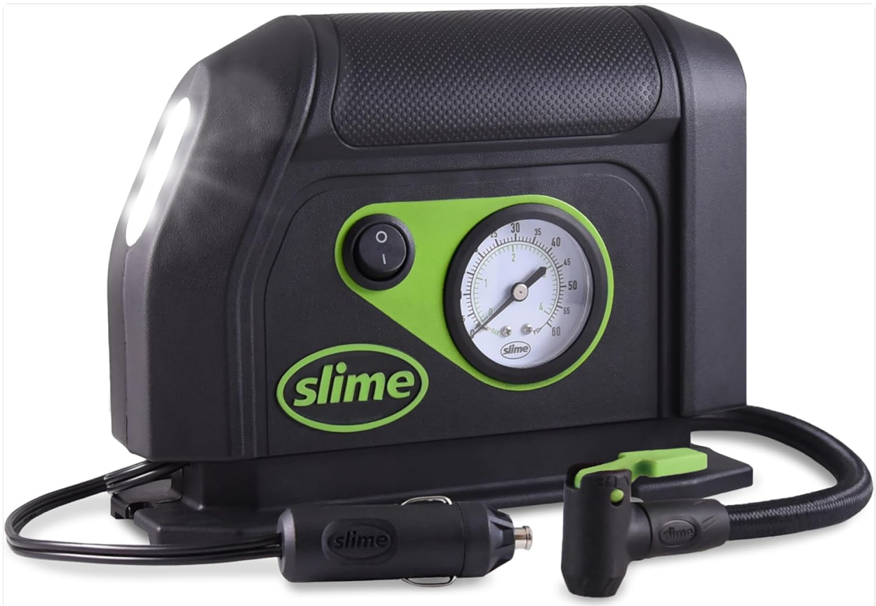
Figure 1: Slime 40050 Tire Inflator with its analog gauge and LED light.