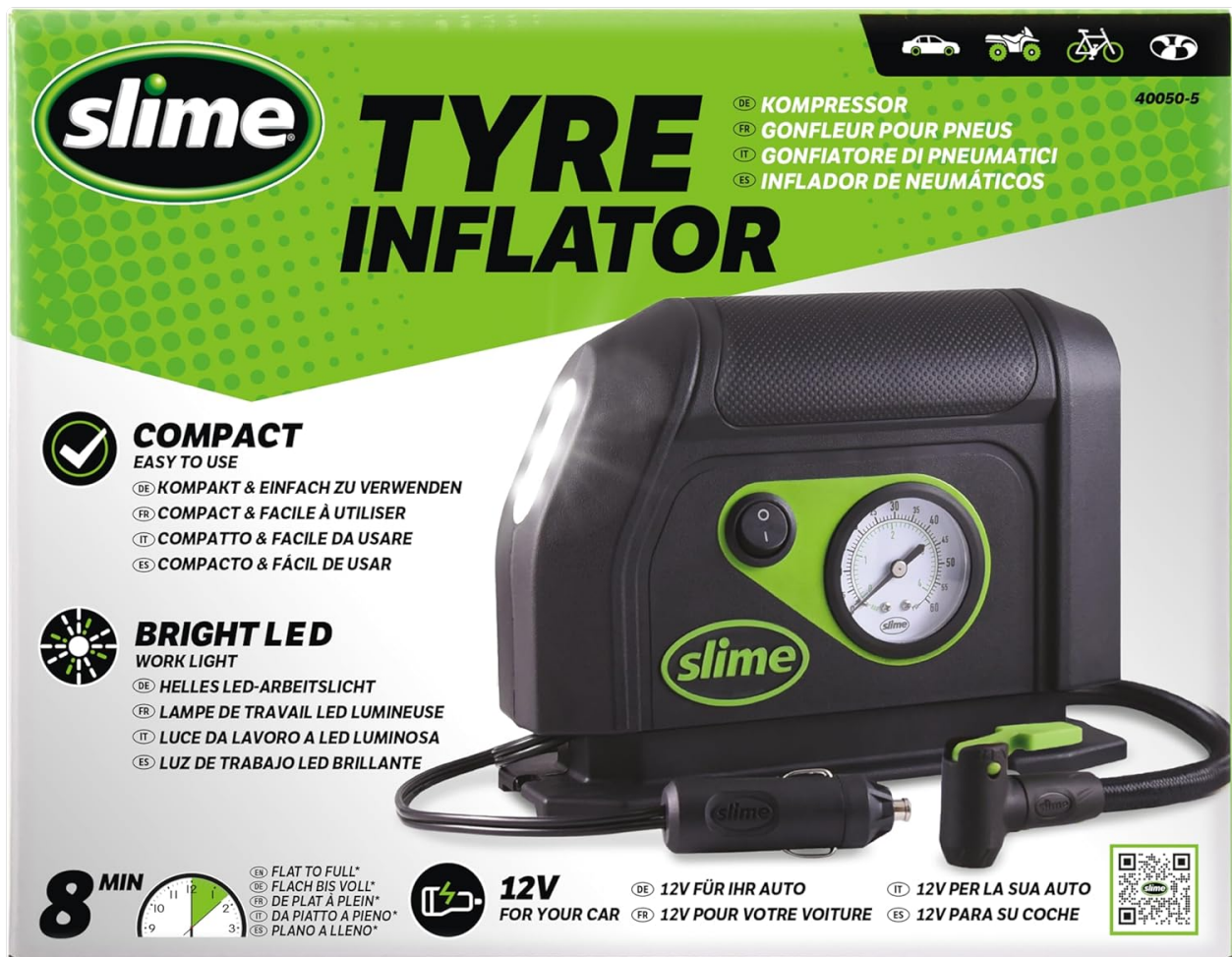
Figure 2: The Slime 40050 Tire Inflator and its packaging, highlighting key features.