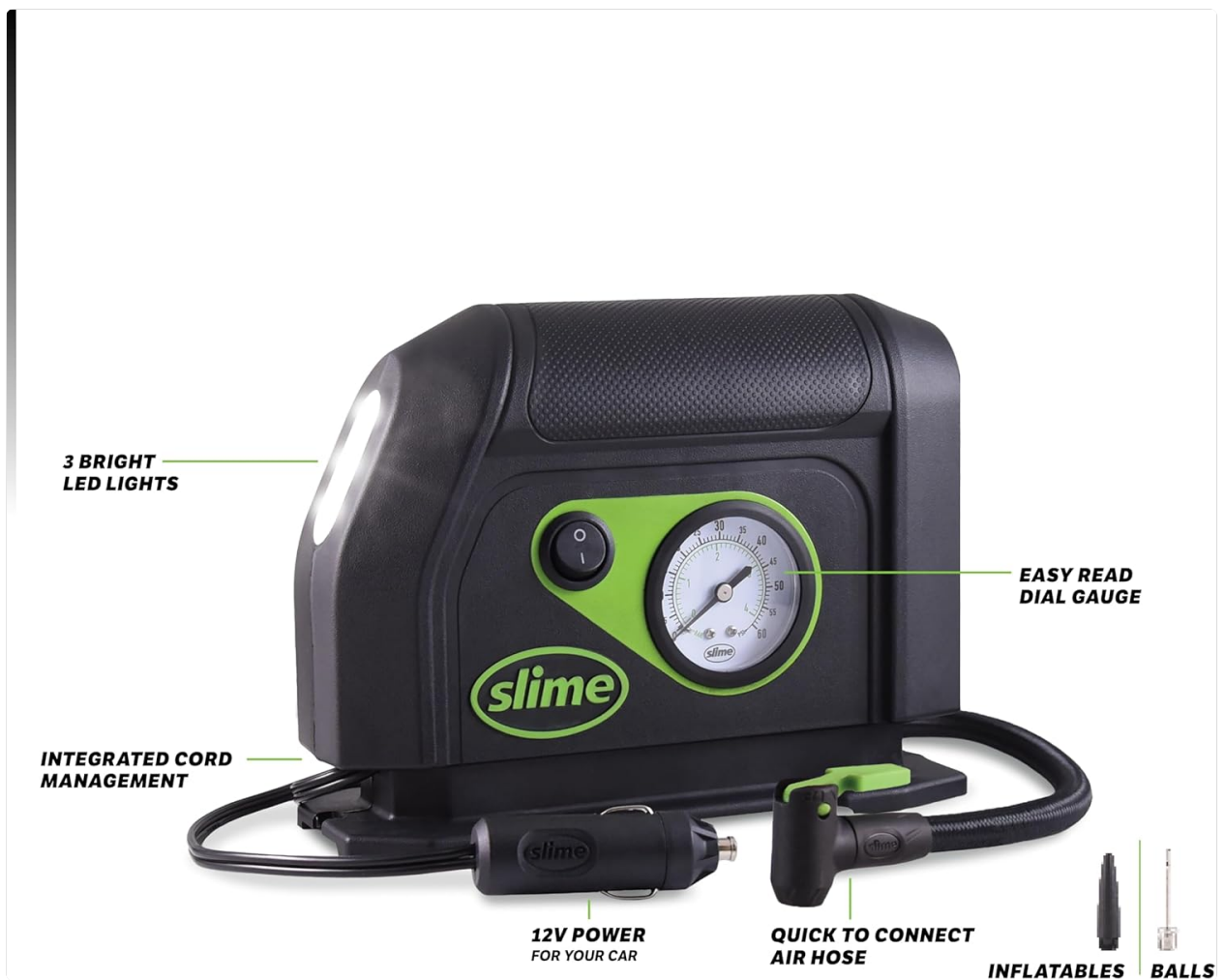
Figure 3: Detailed view of the inflator showing integrated cord management and accessory storage.