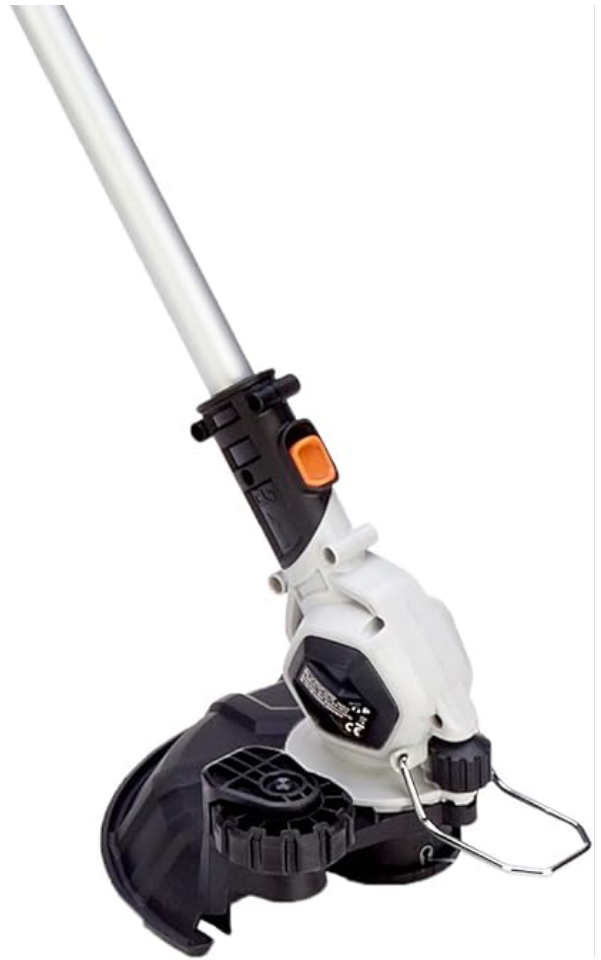
Figure 1: The Batavia 7062515 18V Li-Ion Grass Trimmer. This image shows the complete assembled grass trimmer, highlighting its ergonomic design and cordless nature.