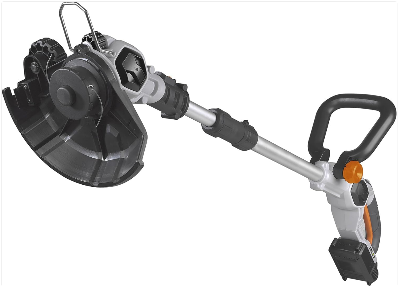
Figure 2: Detailed view of the Batavia 7062515 Grass Trimmer, showing the cutting head, safety guard, and handle configuration. This image provides a closer look at the functional parts of the trimmer.