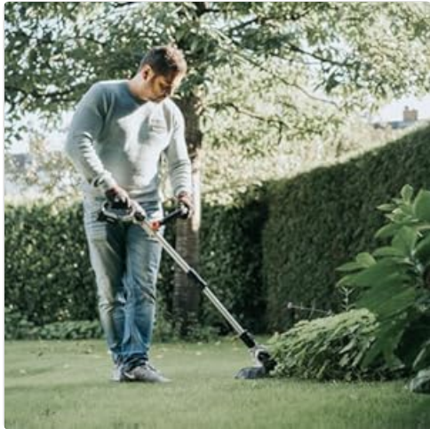
Figure 3: A user operating the Batavia 7062515 Grass Trimmer in a garden setting. This illustrates the practical application and ergonomic handling of the tool during use.