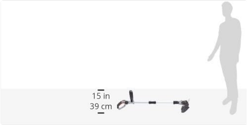
Figure 4: Illustrative diagram showing the approximate dimensions of the Batavia Grass Trimmer. This helps in understanding the