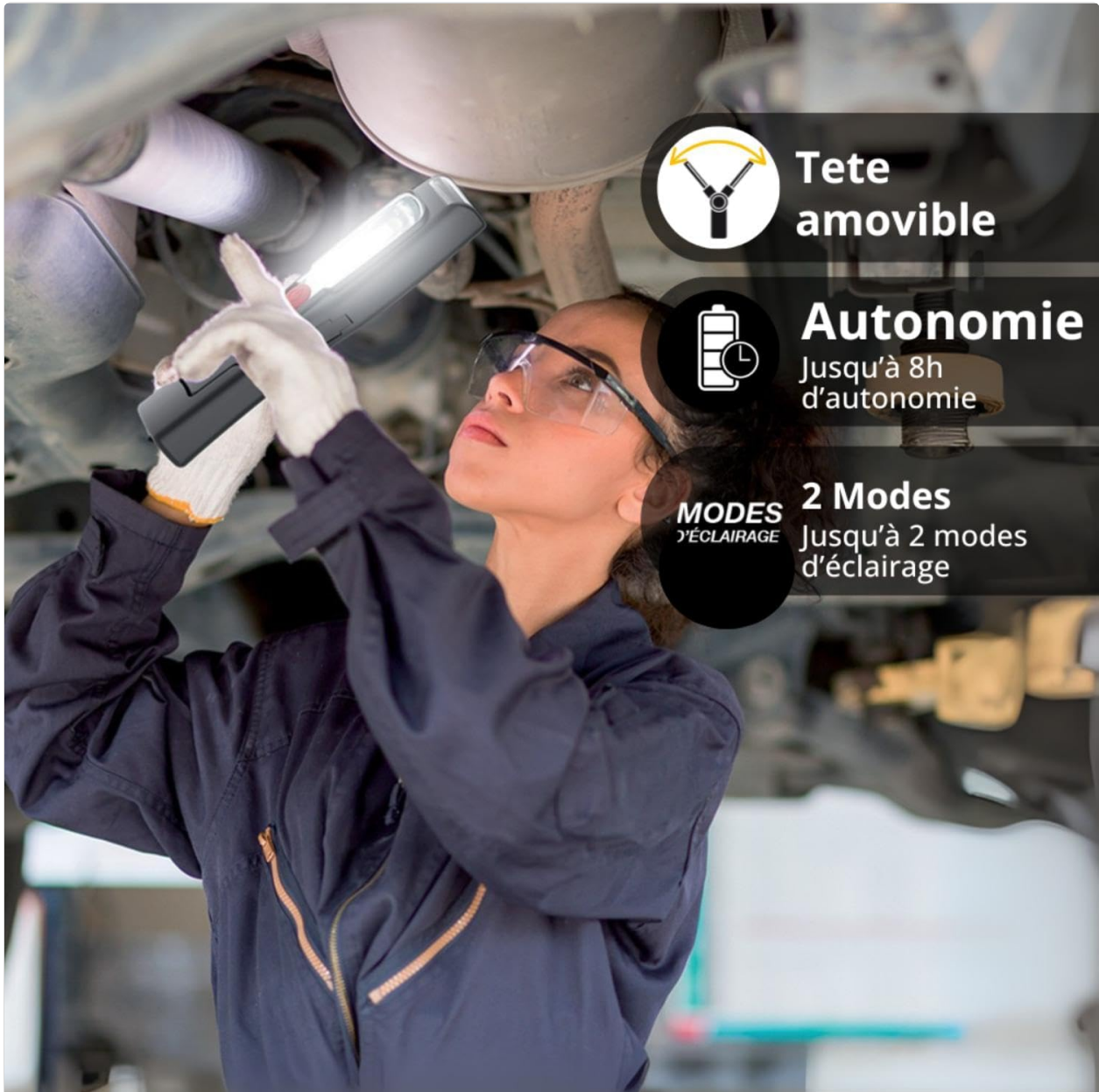
Image: The Xanlite BL250R features an adjustable head, up to 8 hours of autonomy, and two lighting modes, making it ideal for various tasks like working under a sink.