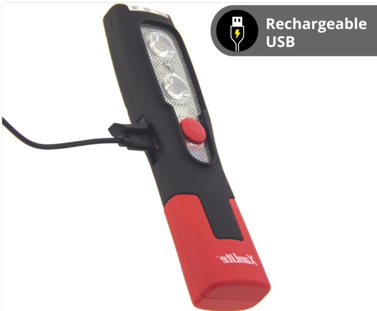
Image: The Xanlite BL250R is easily rechargeable via its integrated USB port.