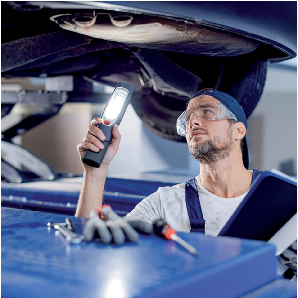
Image: The Xanlite BL250R provides bright illumination for detailed work, such as inspecting a car engine.