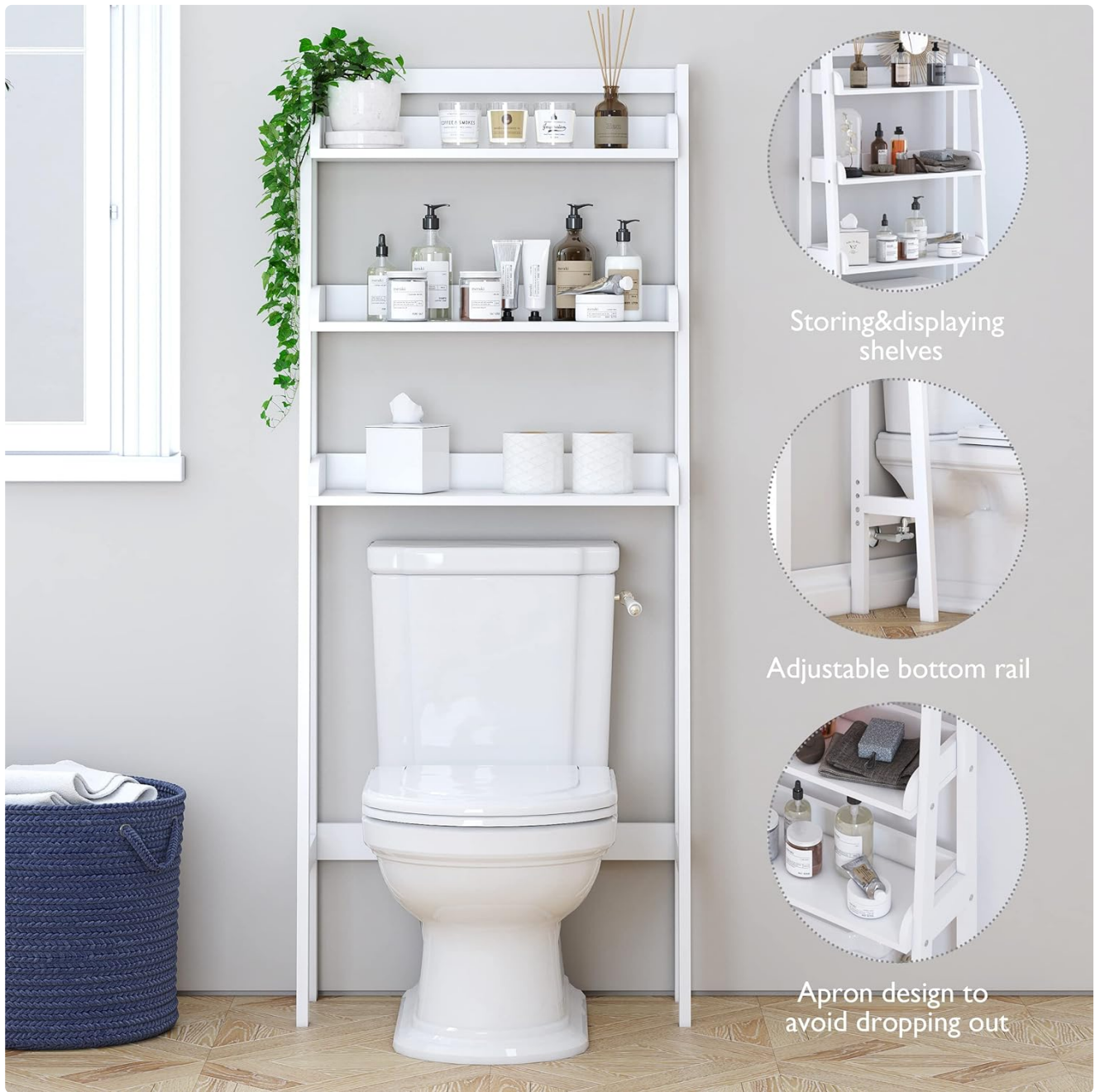
Image: Detailed view highlighting the adjustable bottom rail and the apron design of the shelves, which helps secure items.