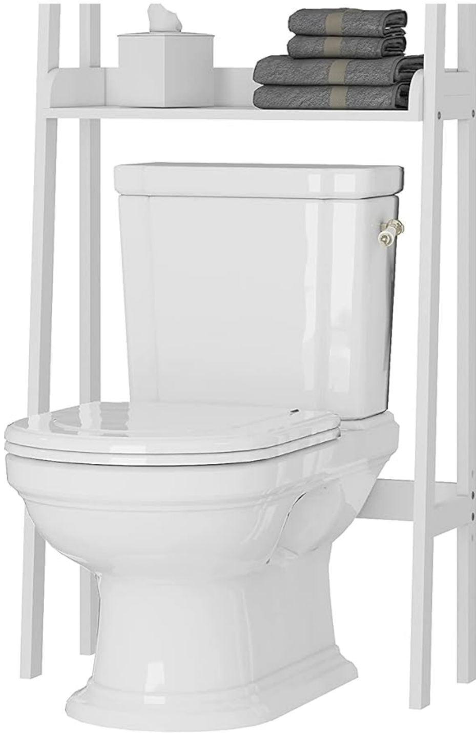
Image: The UTEX 3-Tier Over The Toilet Storage Shelf, showcasing its design and how it fits over a standard toilet.