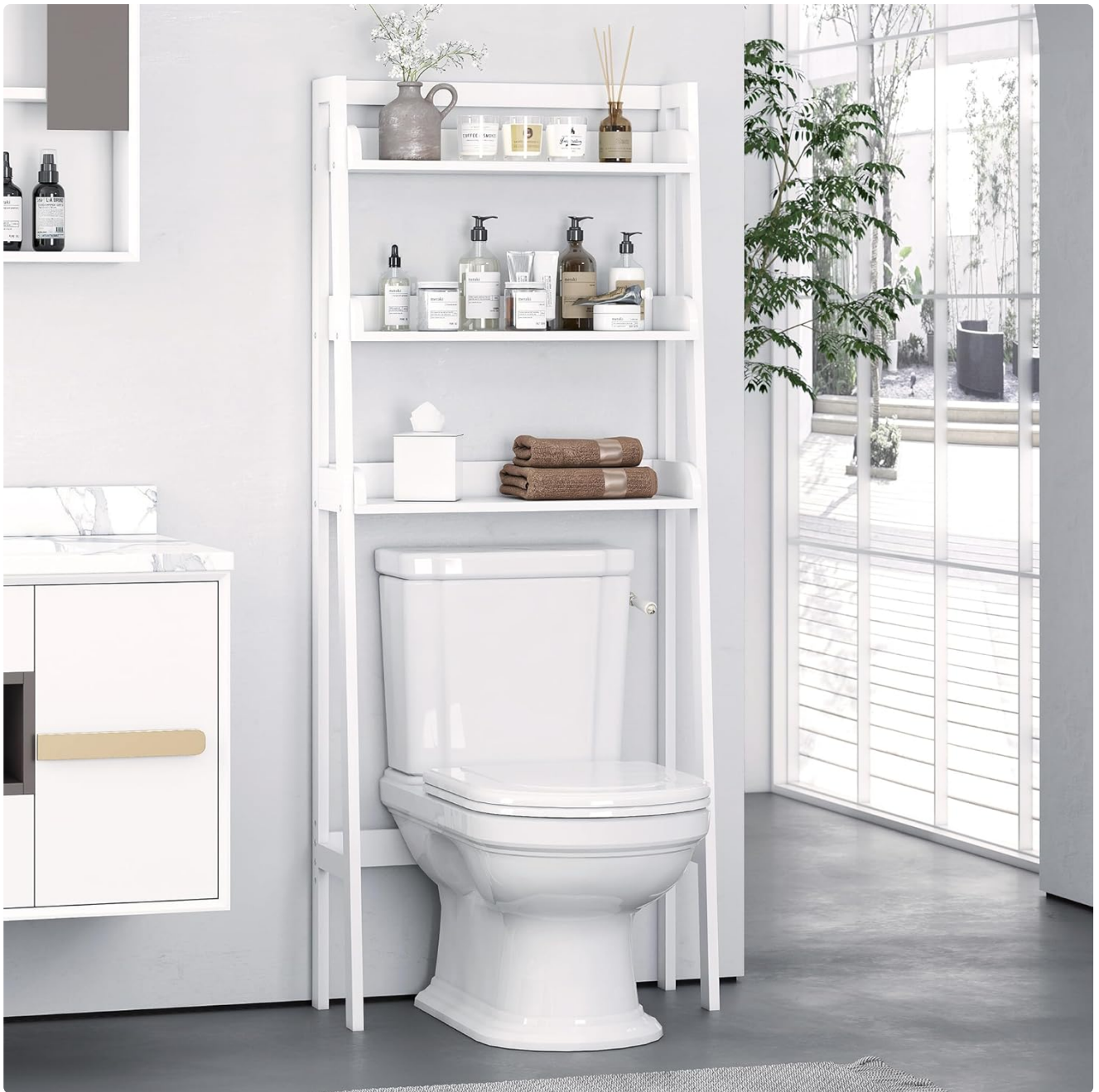
Image: The storage shelf integrated into a modern bathroom, demonstrating its functional use for organizing various items.