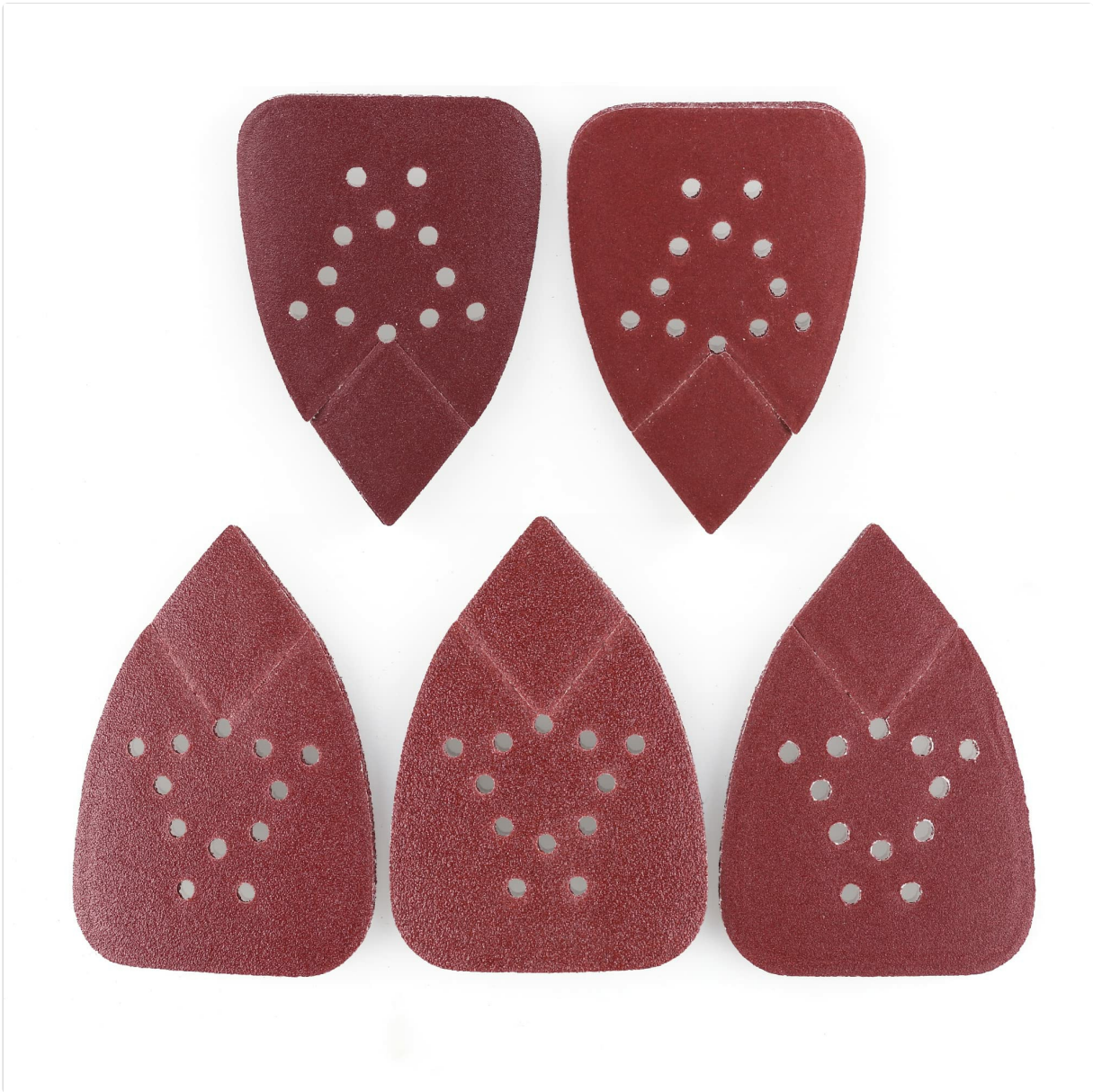
Image: A visual representation of the 50-piece assorted grit sanding pads, clearly labeling each of the five grit types included in the pack.