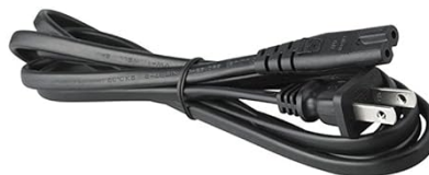
Power cord USB cable not included

We recommend genuine Epson® ink for the best print quality and performance.