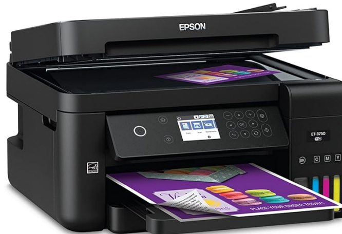
WorkForce® ET-3750 EcoTank® All-in-One Supertank Printer