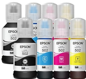
EcoTank 502 Ink Bottles

We recommend genuine Epson® ink for the best print quality and performance.