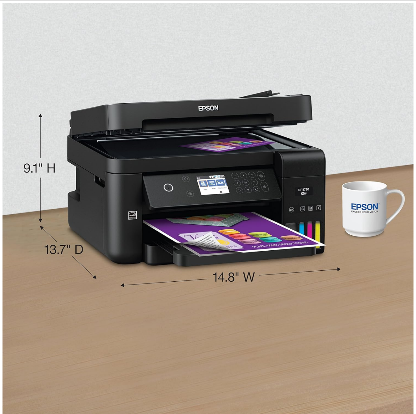
This image shows the physical dimensions of the Epson WorkForce ET-3750 printer: 14.8 inches wide, 13.7 inches deep, and 9.1 inches high. A coffee mug is placed next to it for scale.