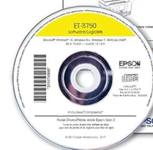
CD and documentation