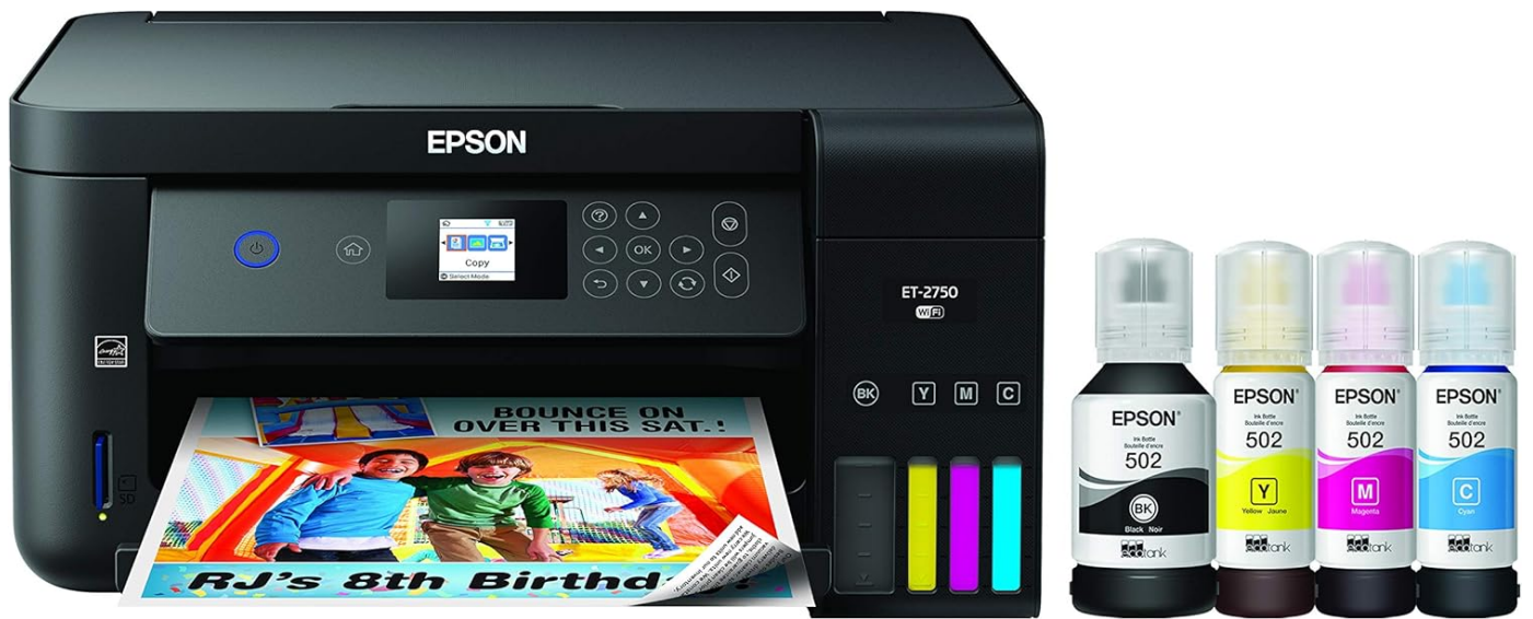
Figure 1: Epson EcoTank ET-2750 All-in-One Printer with included ink bottles.