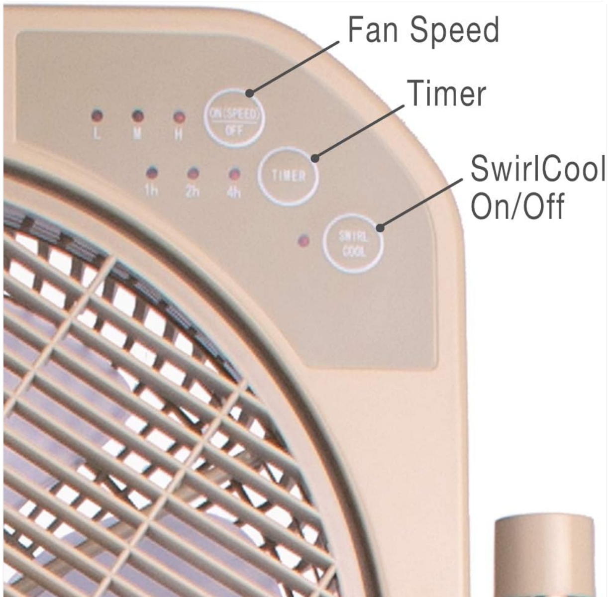
Figure 4: Control Panel Overview

Familiarize yourself with the control panel and features of your Air Innovations fan.