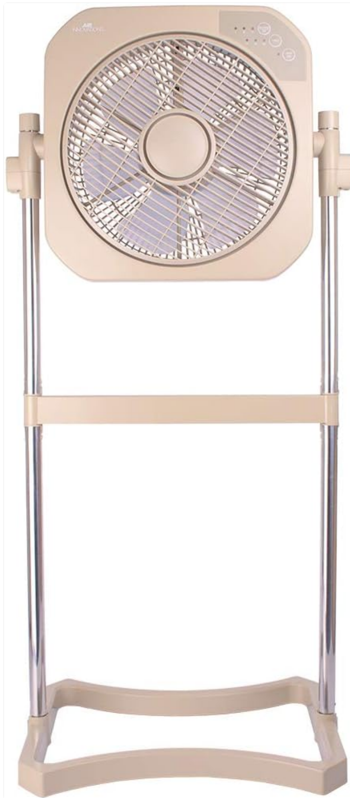
Figure 1: Air Innovations 12-inch Swirl Cool 2-in-1 Fan (Pedestal Mode)