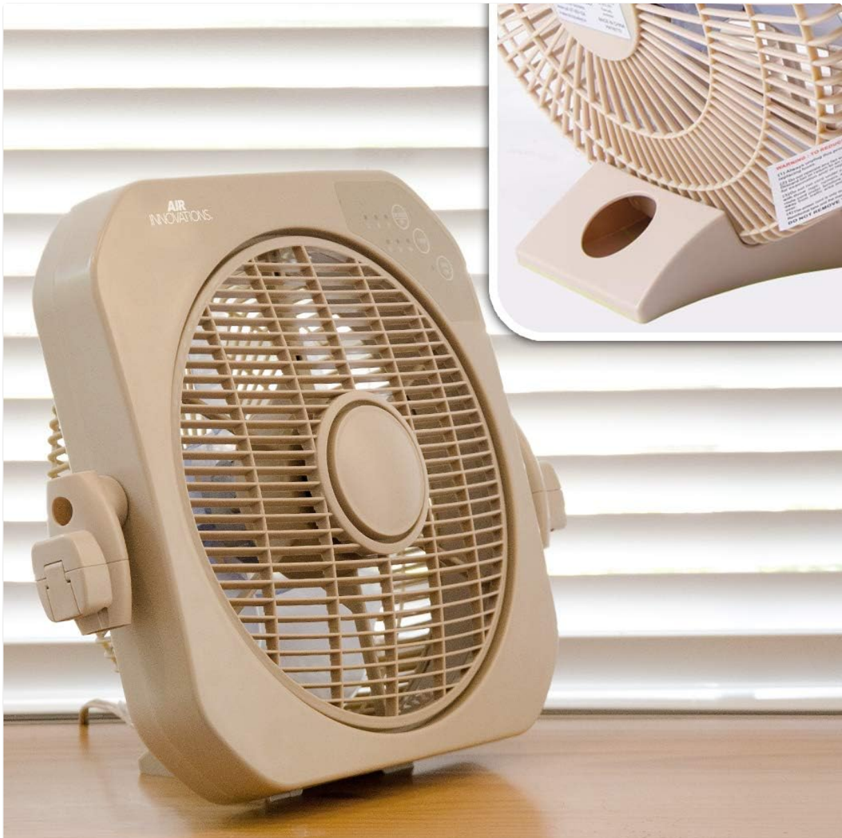
Figure 3: Tabletop Fan Configuration