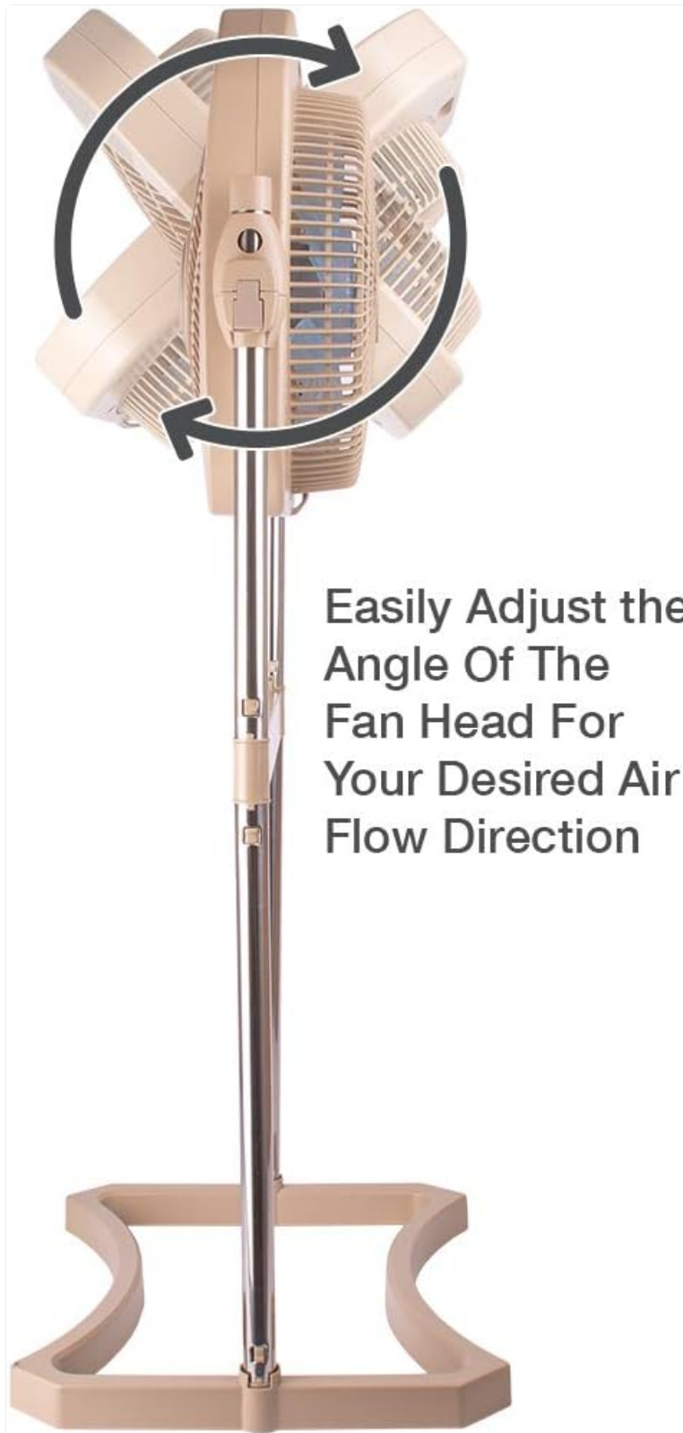
Figure 5: Adjusting Fan Head Angle