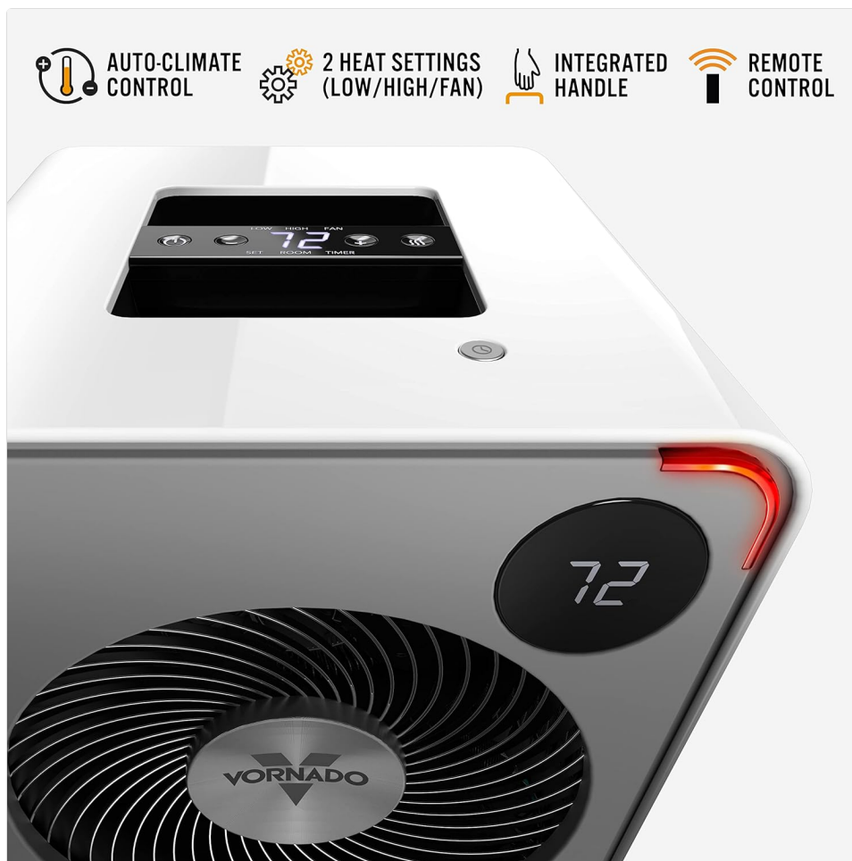
Figure 5.1: Close-up of the VMH500's top control panel and front display, highlighting Auto-Climate Control, 2 Heat Settings, Integrated Handle, and Remote Control features.