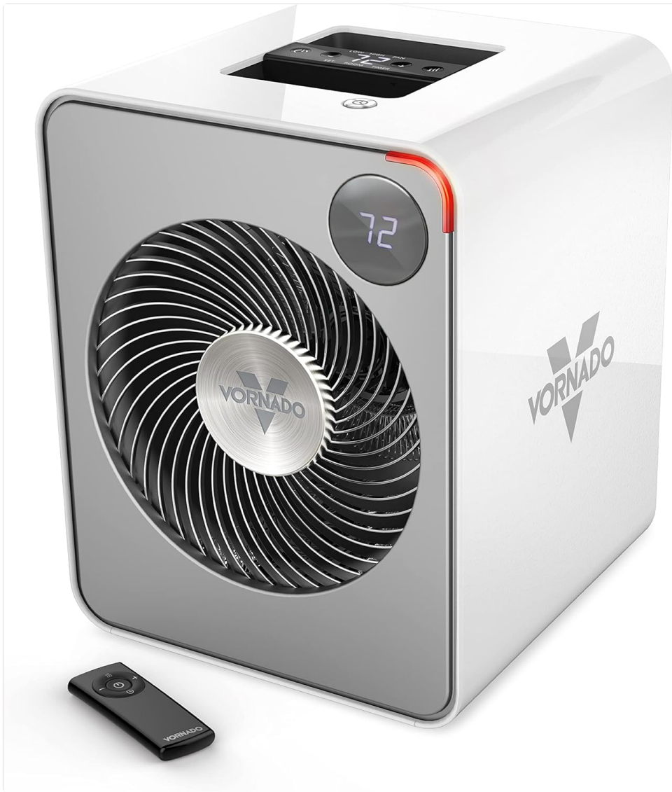
Figure 4.1: Front-left view of the Vornado VMH500 heater with its remote control.