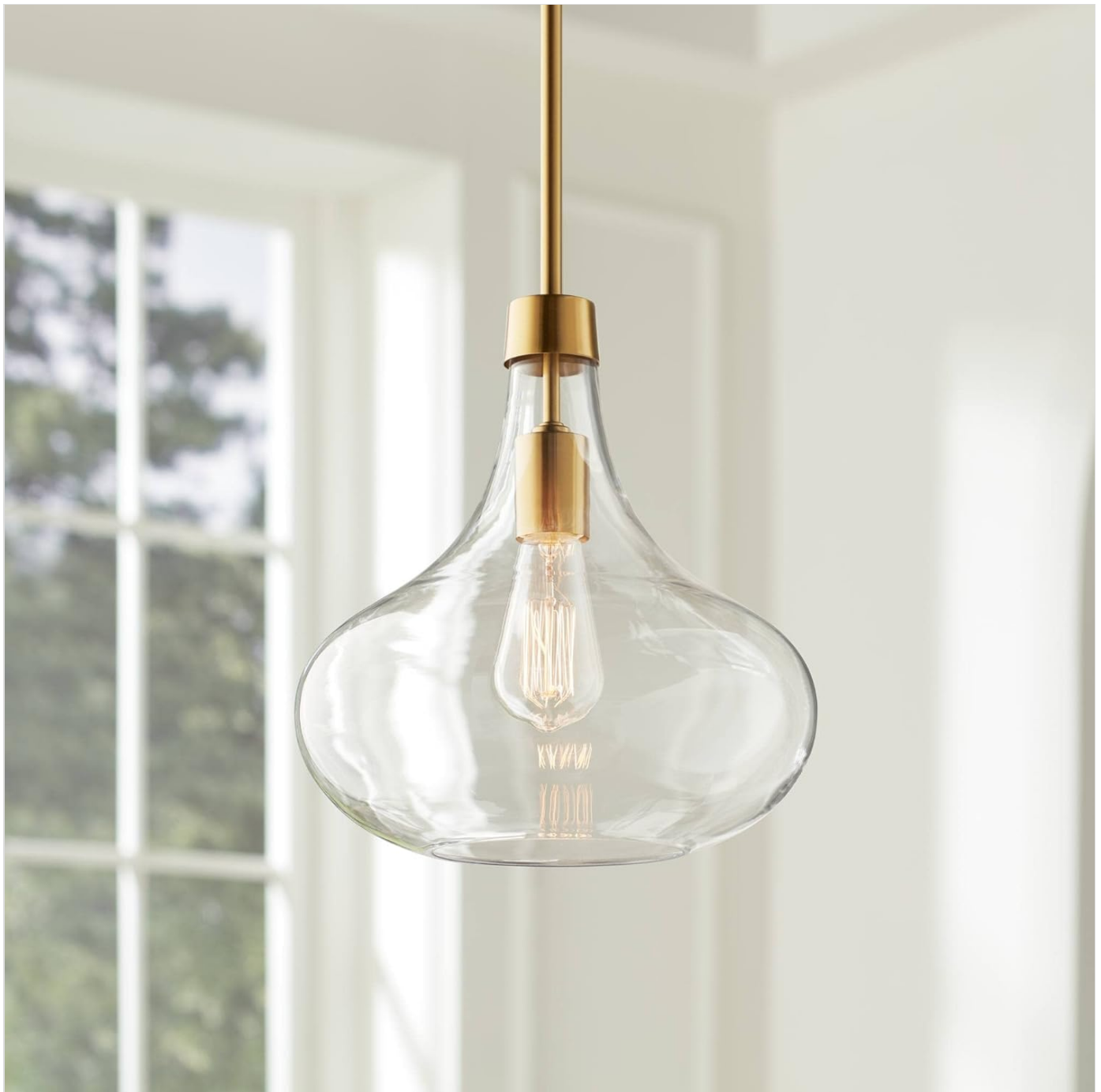
Image: The Possini Euro Design Pendant Light Fixture, showcasing its clear glass shade and antique gold accents.