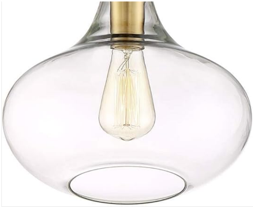
Image: A view of the pendant light fixture, showing the canopy, downrods, and the clear glass shade, representing the main components.