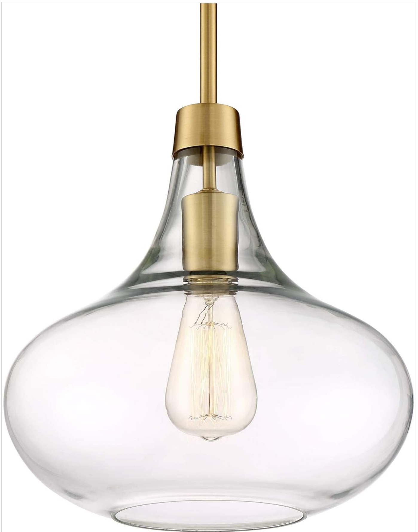
Image: A detailed view of the light's clear glass shade and the E26 bulb socket, highlighting the bulb type.