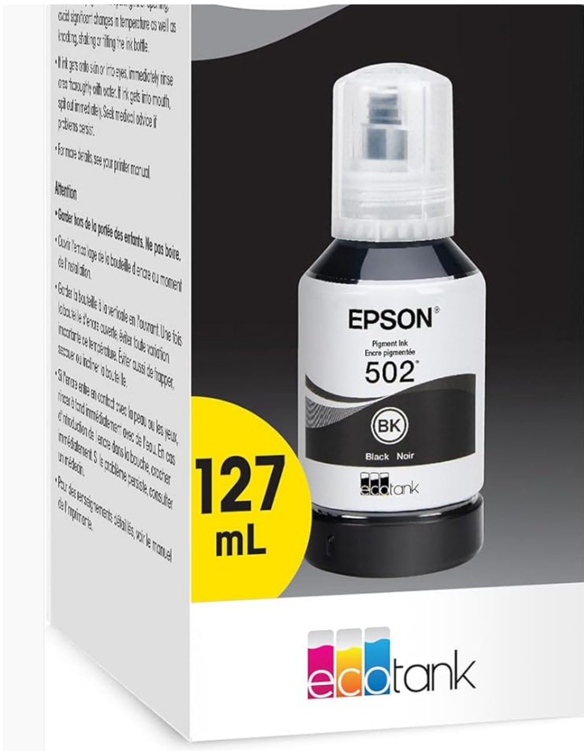
Image 1.1: Epson 502 EcoTank Black Ink Bottle (127 mL) in its retail packaging.