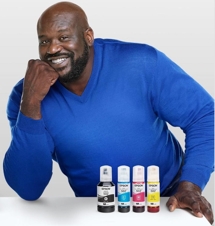
Image 2.1: Visual representation of compatible Epson EcoTank printer models for the 502 ink series.

Epson recommends genuine ink for optimal performance.