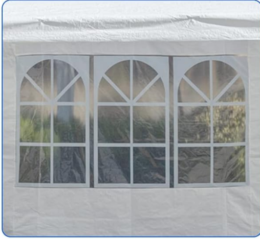
Pervious to light side window