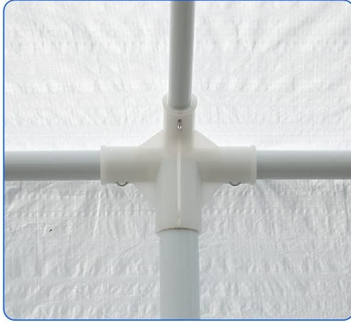
The plastic Angle