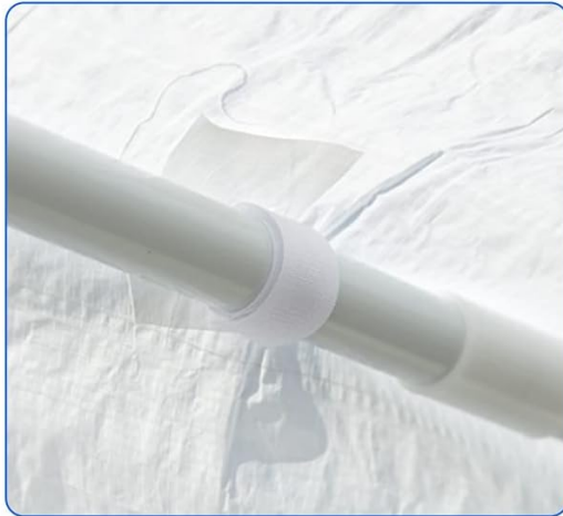
Hook and loop fasteners

Image: Detailed view of key components: pervious-to-light side window, plastic angle connector, foot pad, and hook and loop fasteners.