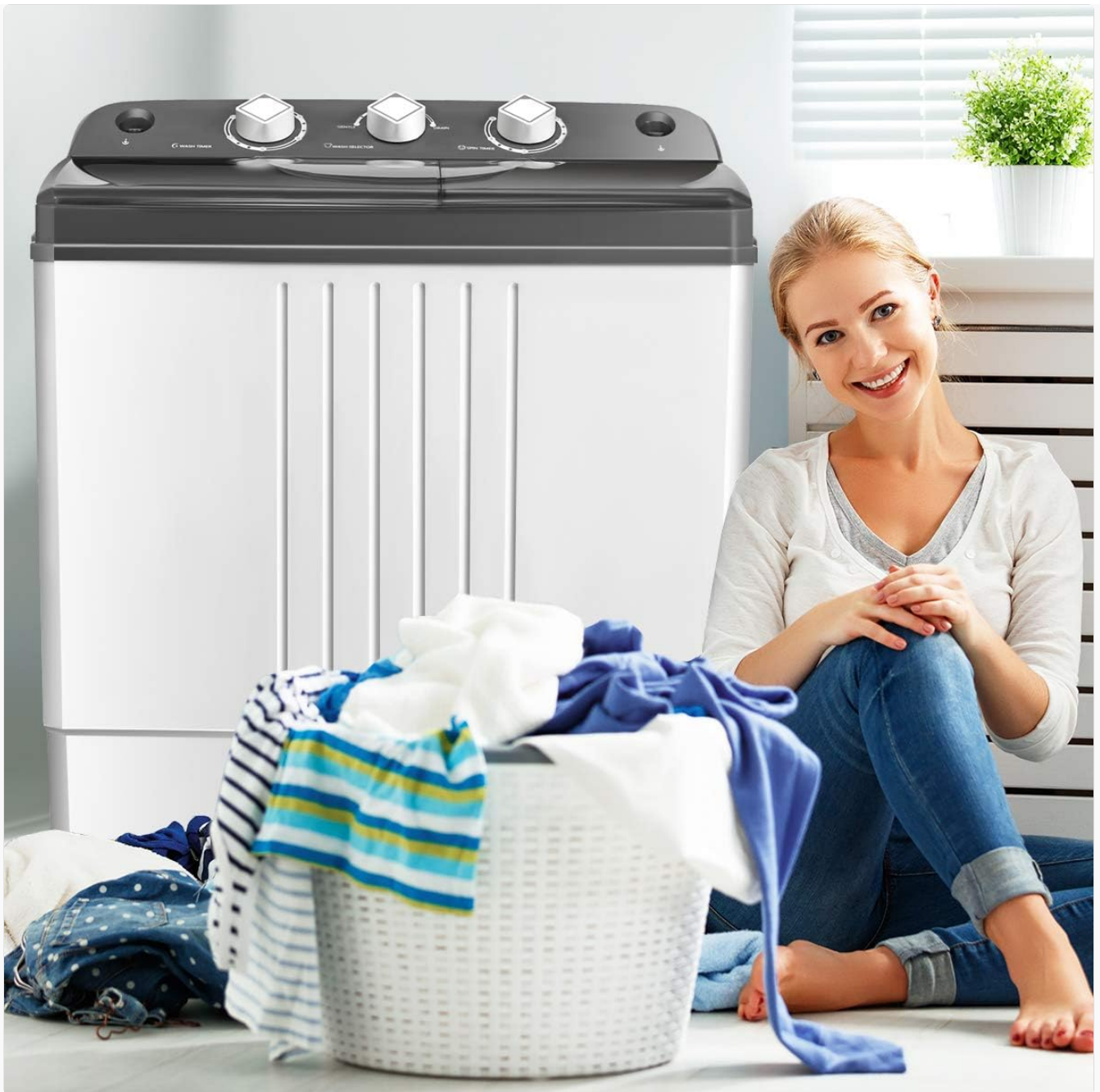
The COSTWAY Portable Twin Tub Washing Machine, designed for compact living.