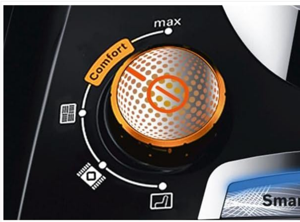
Figure 3.3: A detailed view of the suction power control dial on the Bosch ProSilence Series 8, showing settings from 'Comfort' to 'Max' for various cleaning needs.