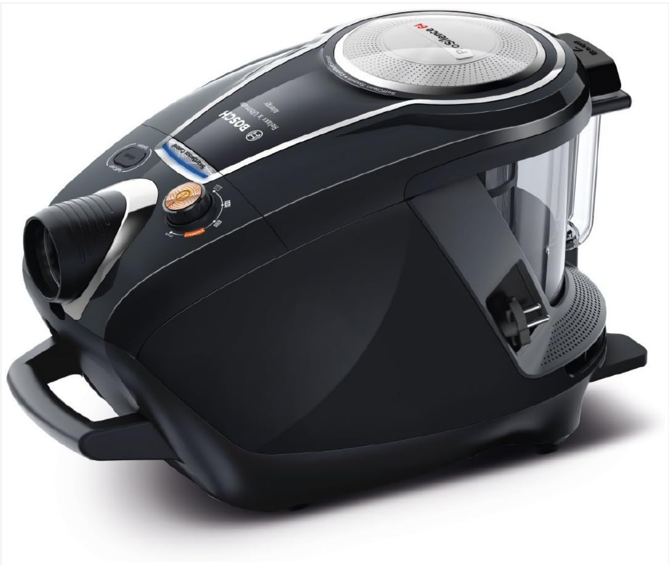
Figure 3.1: The Bosch ProSilence Series 8 BGS7MS64 bagless vacuum cleaner, showcasing its sleek black design and compact form factor.