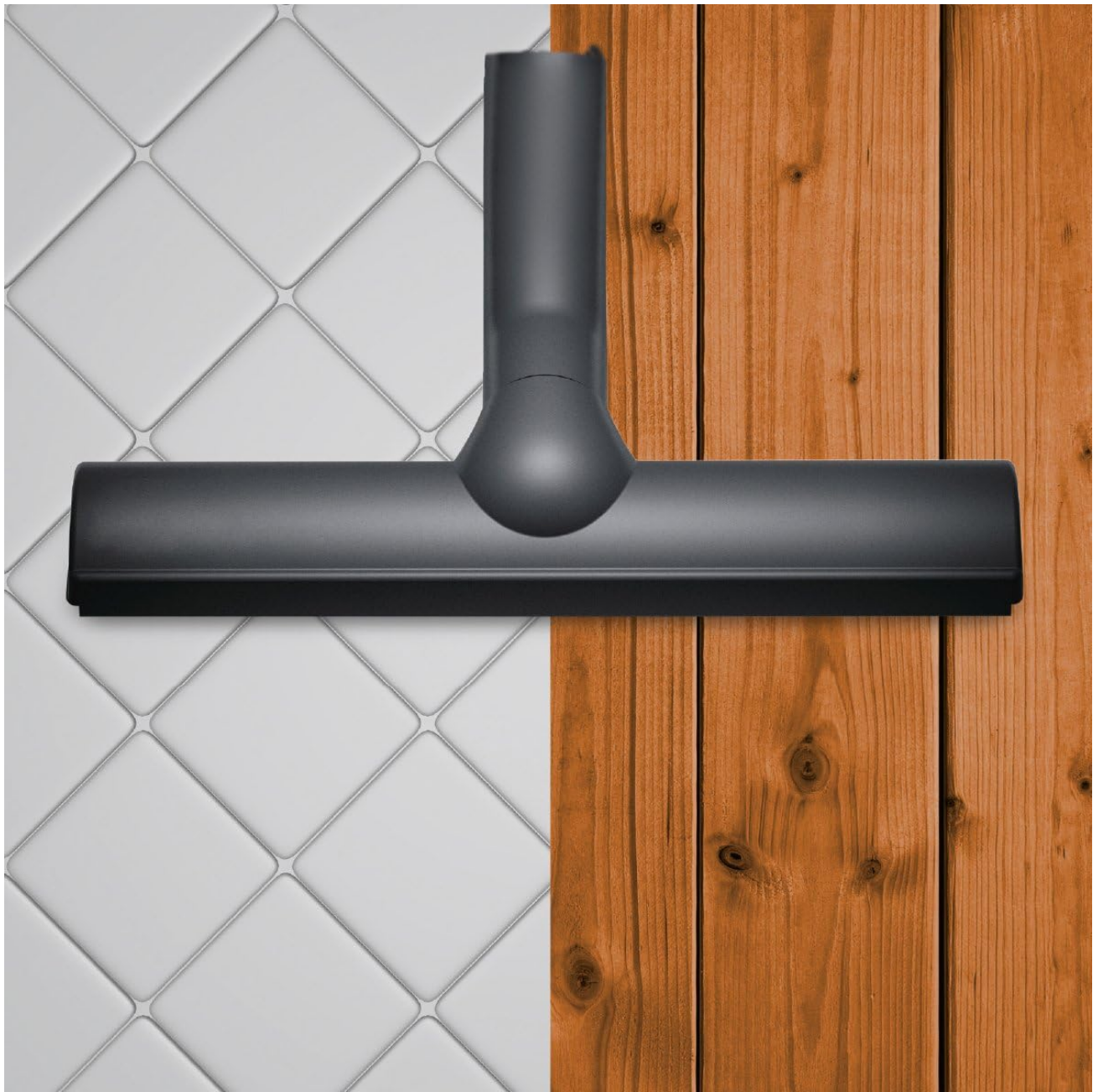
Figure 5.2: The standard switchable floor nozzle, suitable for both carpeted and hard floor surfaces, demonstrating its versatility.