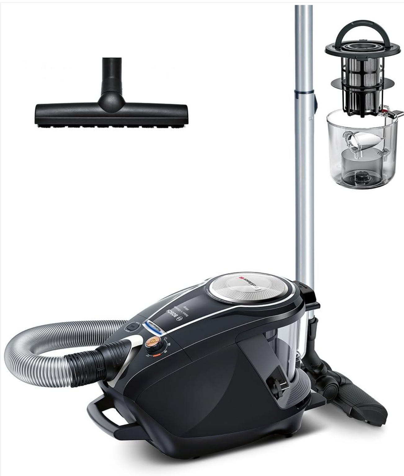
Figure 3.2: The Bosch ProSilence Series 8 vacuum cleaner shown with its telescopic tube, hose, main floor nozzle, and the removable dust container assembly.