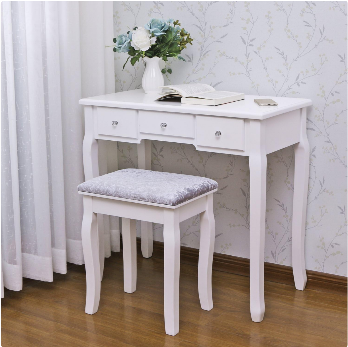
Image: The vanity table configured as a desk, demonstrating its adaptability for various uses beyond makeup application.