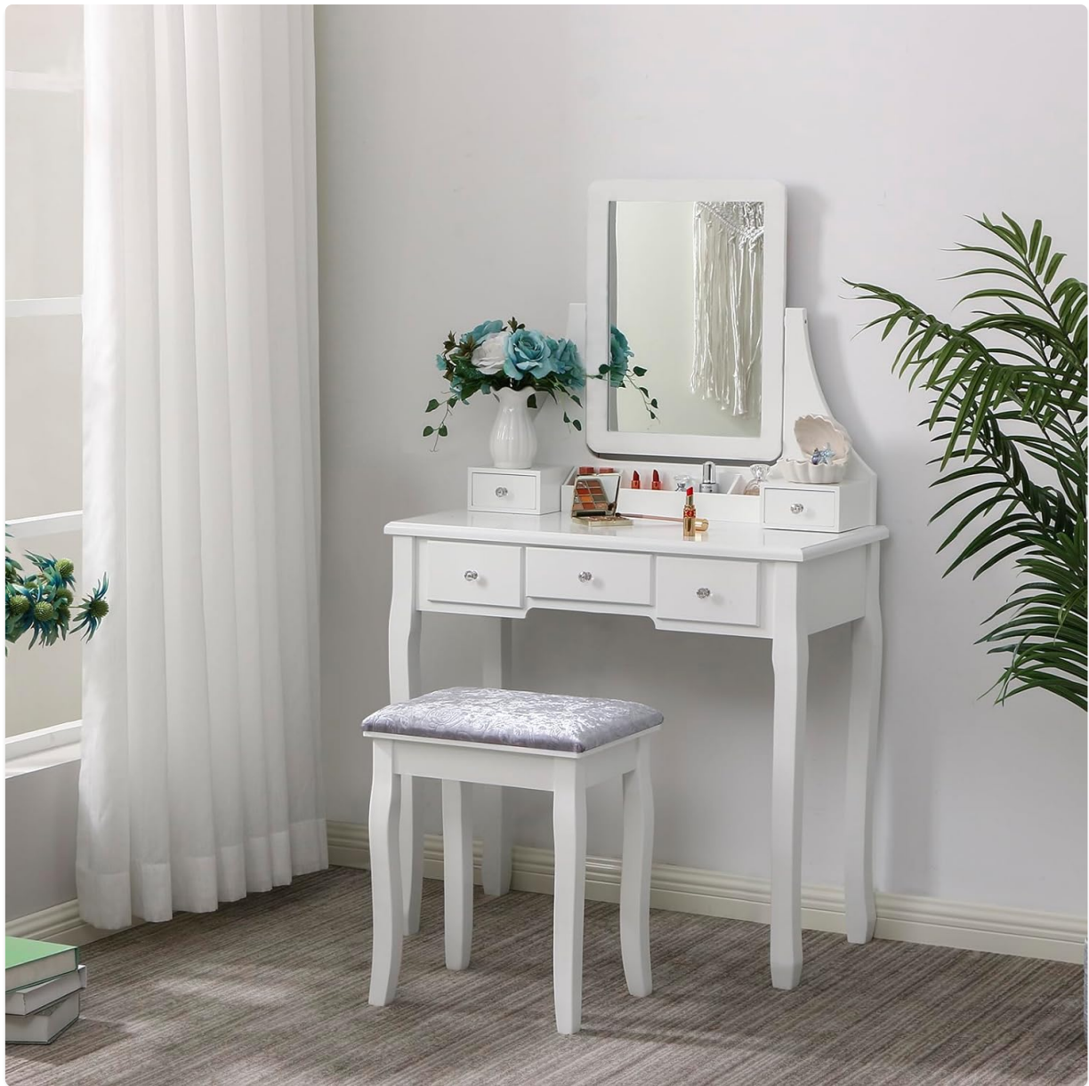
Image: The BEWISHOME Vanity Set FST01W, featuring a white dressing table with a mirror, five drawers, and a matching cushioned stool.