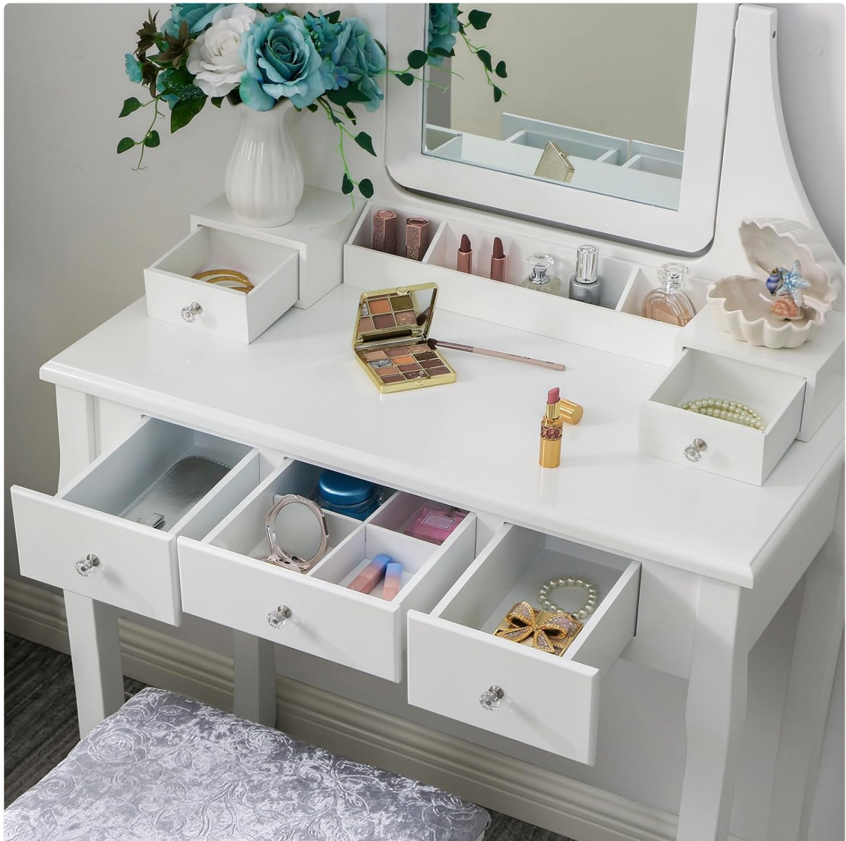
Image: A close-up view of the vanity's open drawers and tabletop compartments, illustrating the storage capacity and organization options.

The vanity features 5 drawers, 3 compartments on the tabletop, and 2 movable dividers. Use these to organize cosmetics, perfumes, lotions, brushes, hair accessories, and other beauty supplies. The movable dividers can be rearranged within the drawers to suit your specific needs.