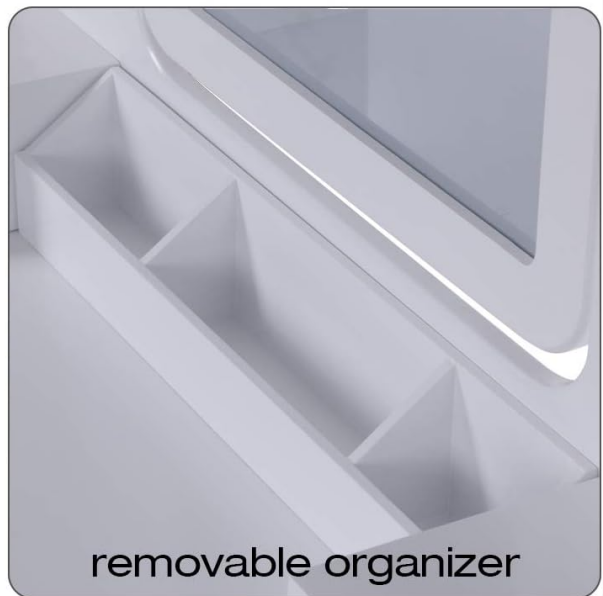
Image: Detailed views of the vanity's features, including the comfortable stool cushion, practical drawer dividers, elegant crystal knobs, and versatile removable organizers.