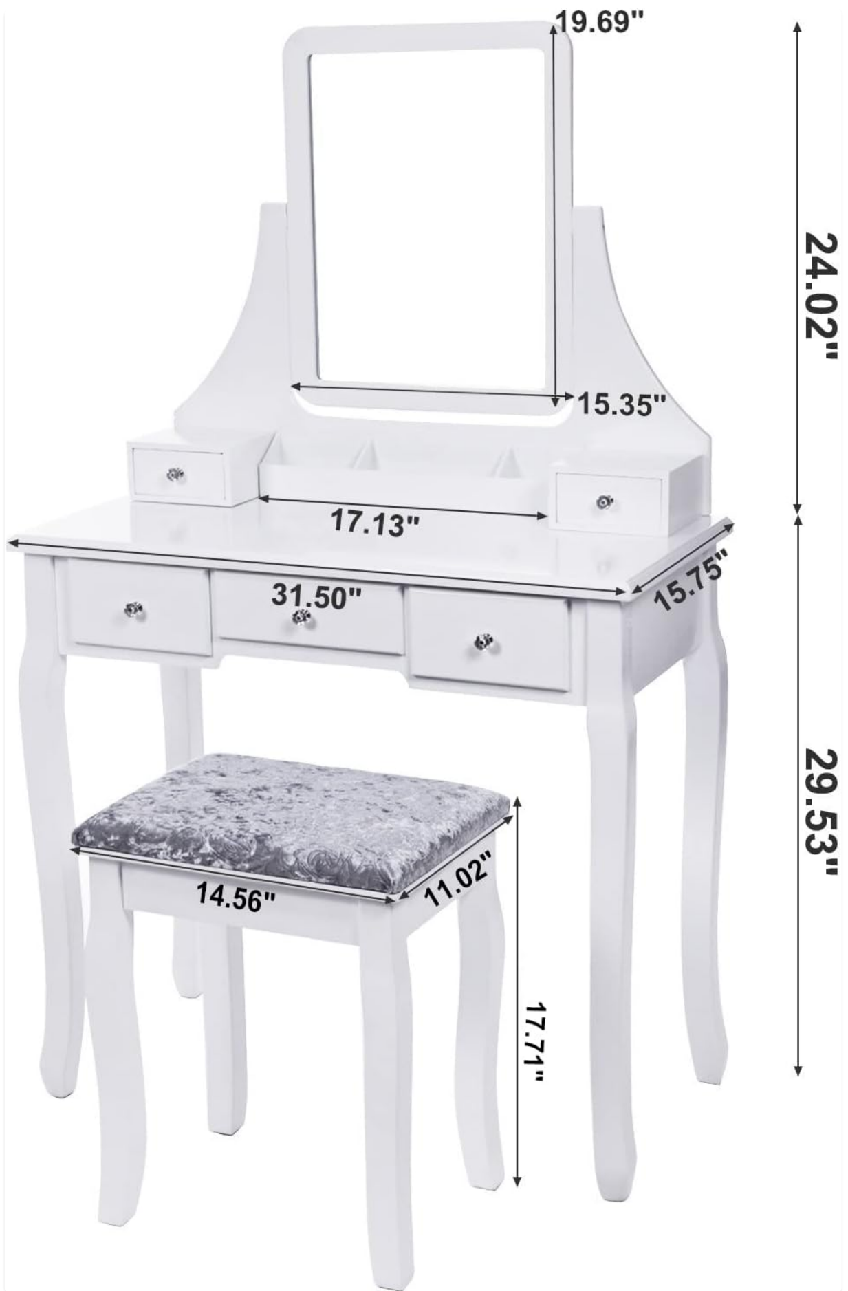
Image: Detailed dimensions of the vanity table and stool to aid in assembly and placement.

Video: An overview of the BEWISHOME Vanity Set FST01W, showcasing its features and design. This video can assist in visualizing the assembled product.