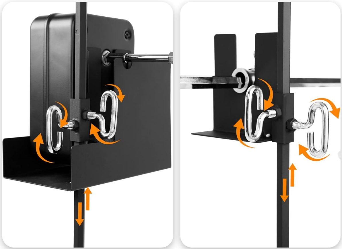
Figure 2: Detail of the adjustable motor bracket, showing how to adjust the height of the rotisserie system on the support post.