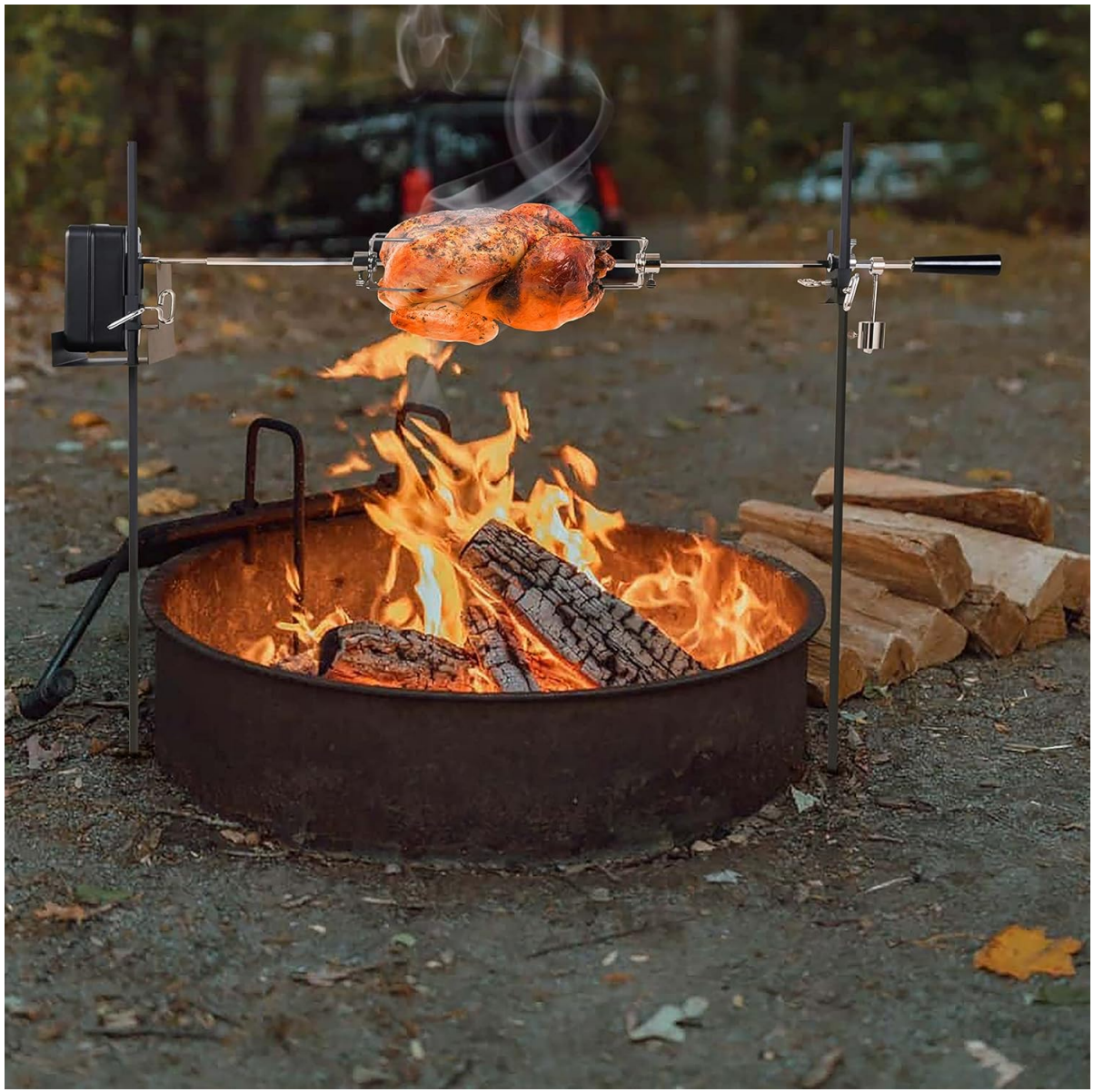
Figure 4: A chicken rotating on the onlyfire rotisserie system, set up over a campfire in a natural outdoor setting.