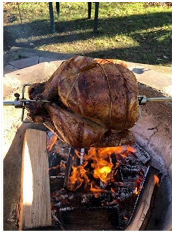
Figure 3: A turkey being slow-roasted on the onlyfire rotisserie system over a traditional open fire pit.