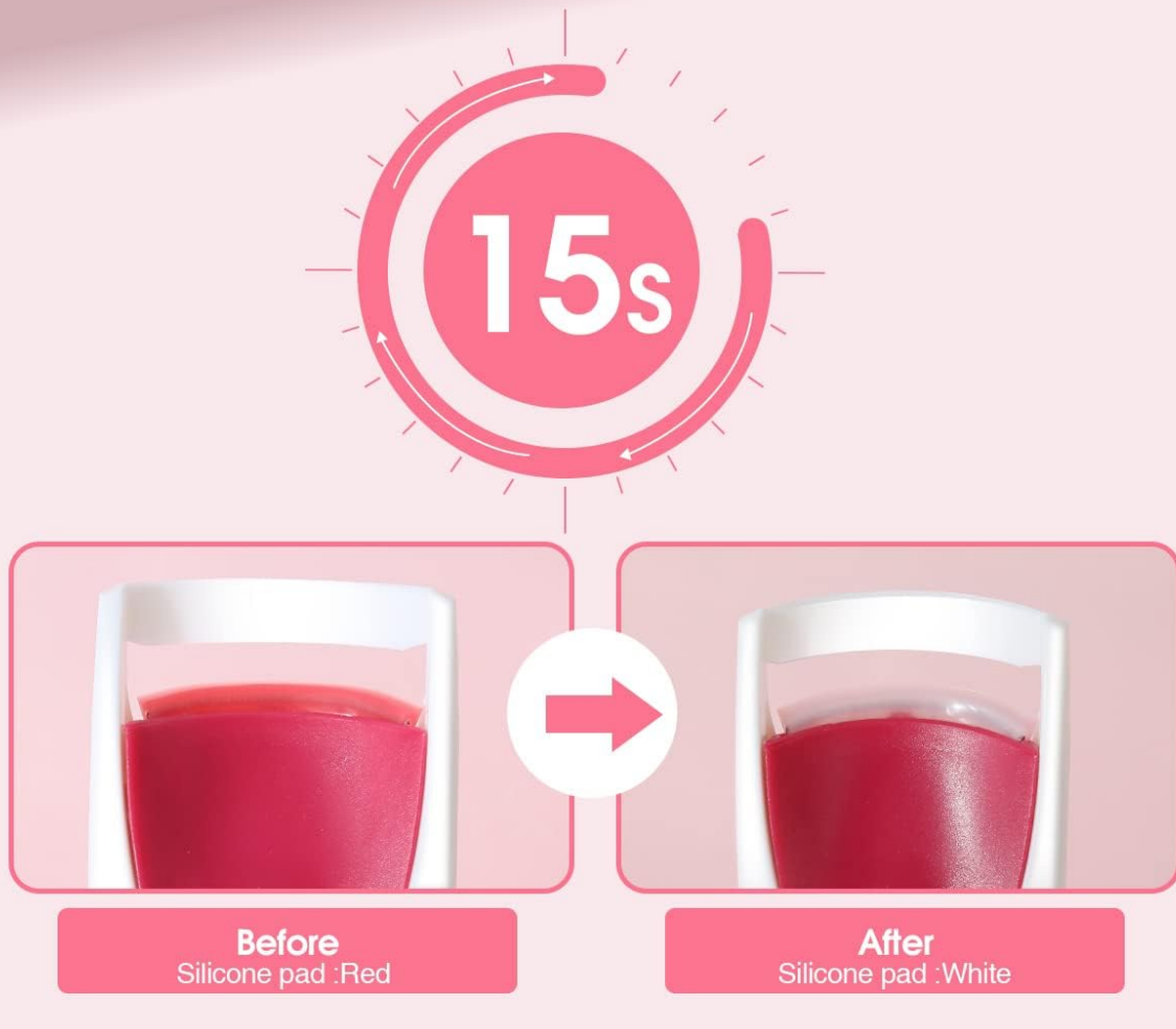
Image: The smart temperature sensor, showing the silicone pad transitioning from red to translucent white when ready for use.

The silicone pad will get transparent when the temperature is right