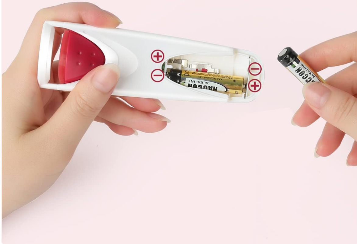
Image: A hand demonstrating the correct installation of AAA batteries into the device's battery compartment.