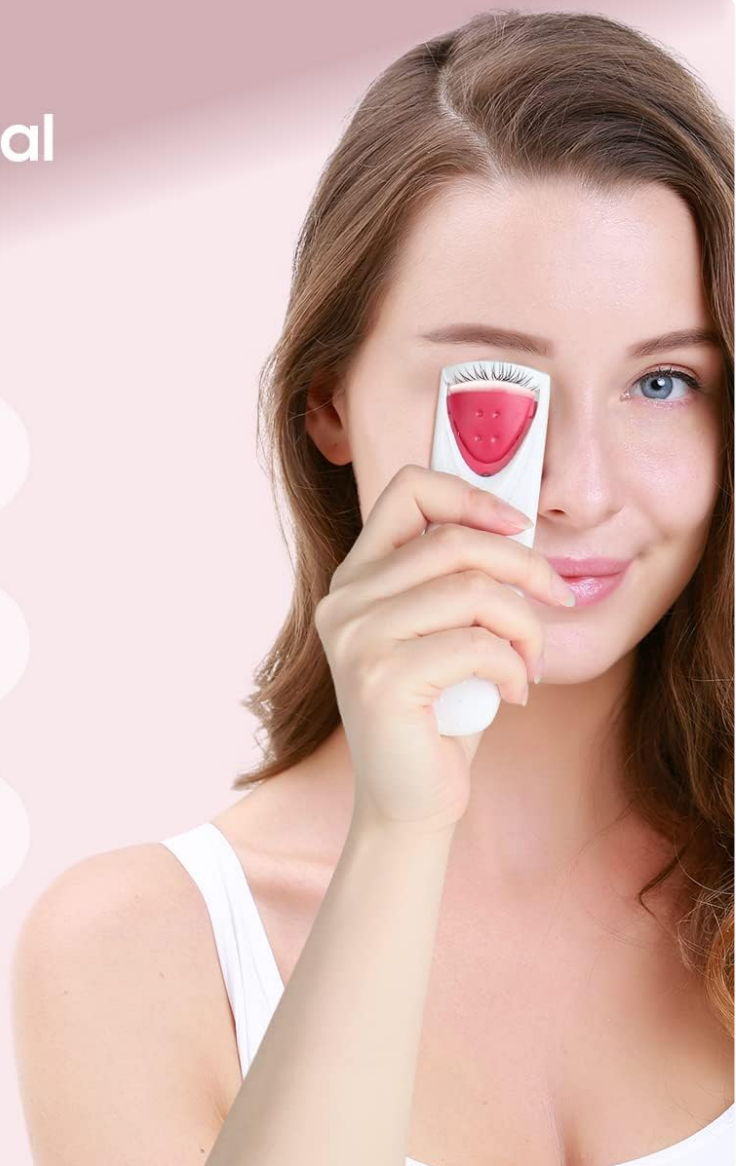
Image: Visual representation of the curler's fast heating (15s), perfect curling (30s), and long-lasting results (24h).