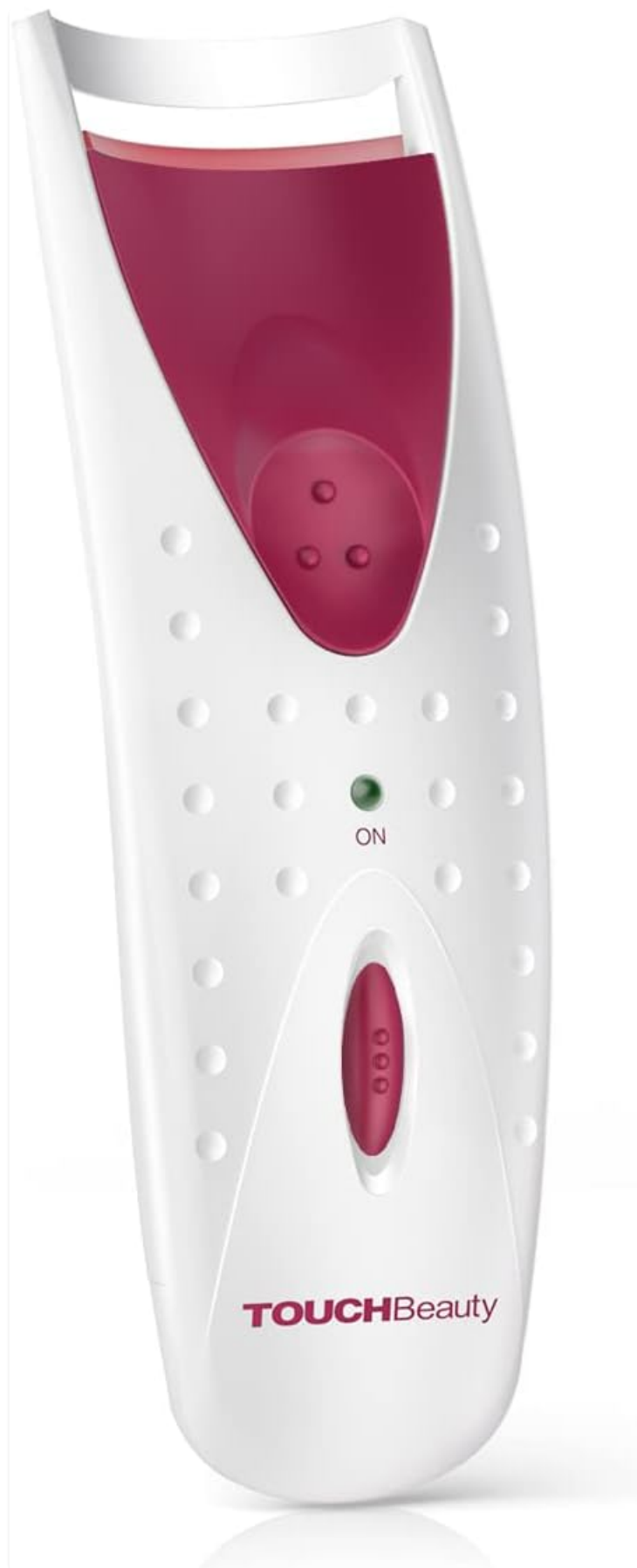
Image: The TOUCHBeauty Professional Heated Eyelash Curler TB-2003B, a white device with a pink silicone pad and an 'ON' indicator light.