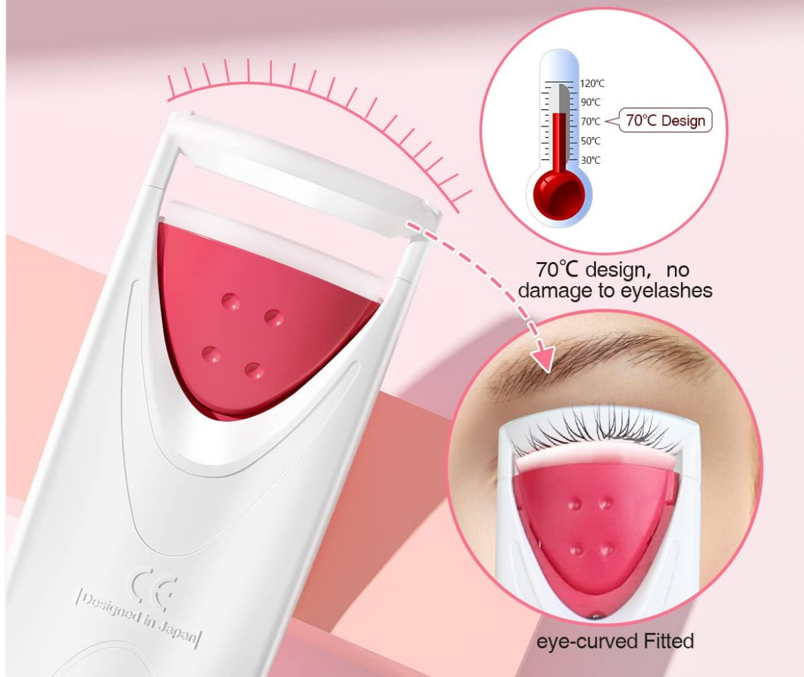
Image: The curler's 70°C design, engineered for a natural curvature without damaging eyelashes.