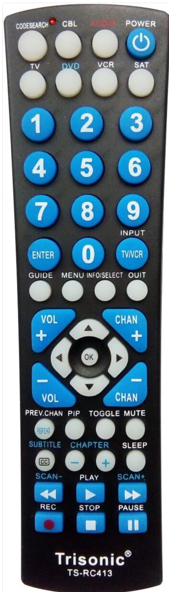
Front view of the Trisonic 6 Way Universal Remote Control, showing all buttons and layout.