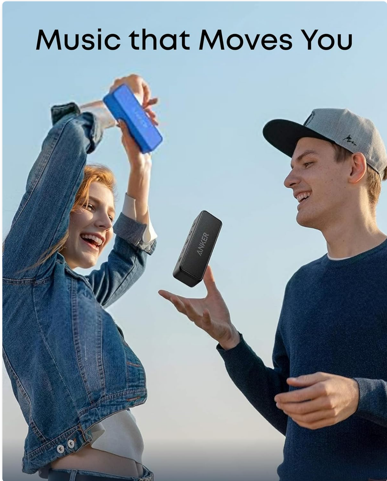
Image: Two Anker Soundcore 2 speakers are shown on a beach, demonstrating their ability to be paired for stereo sound, with visual cues of sound waves.

For an enhanced audio experience, two Soundcore 2 speakers can be paired together to create a stereo sound system. Refer to the Soundcore app or the full user manual for detailed instructions on how to enable stereo pairing.