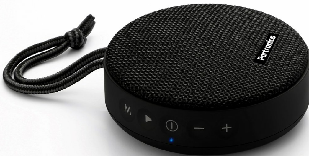
Image 1.1: The Portronics POR-754 Sound Bun Bluetooth Speaker, showcasing its compact, circular design and integrated carrying strap.