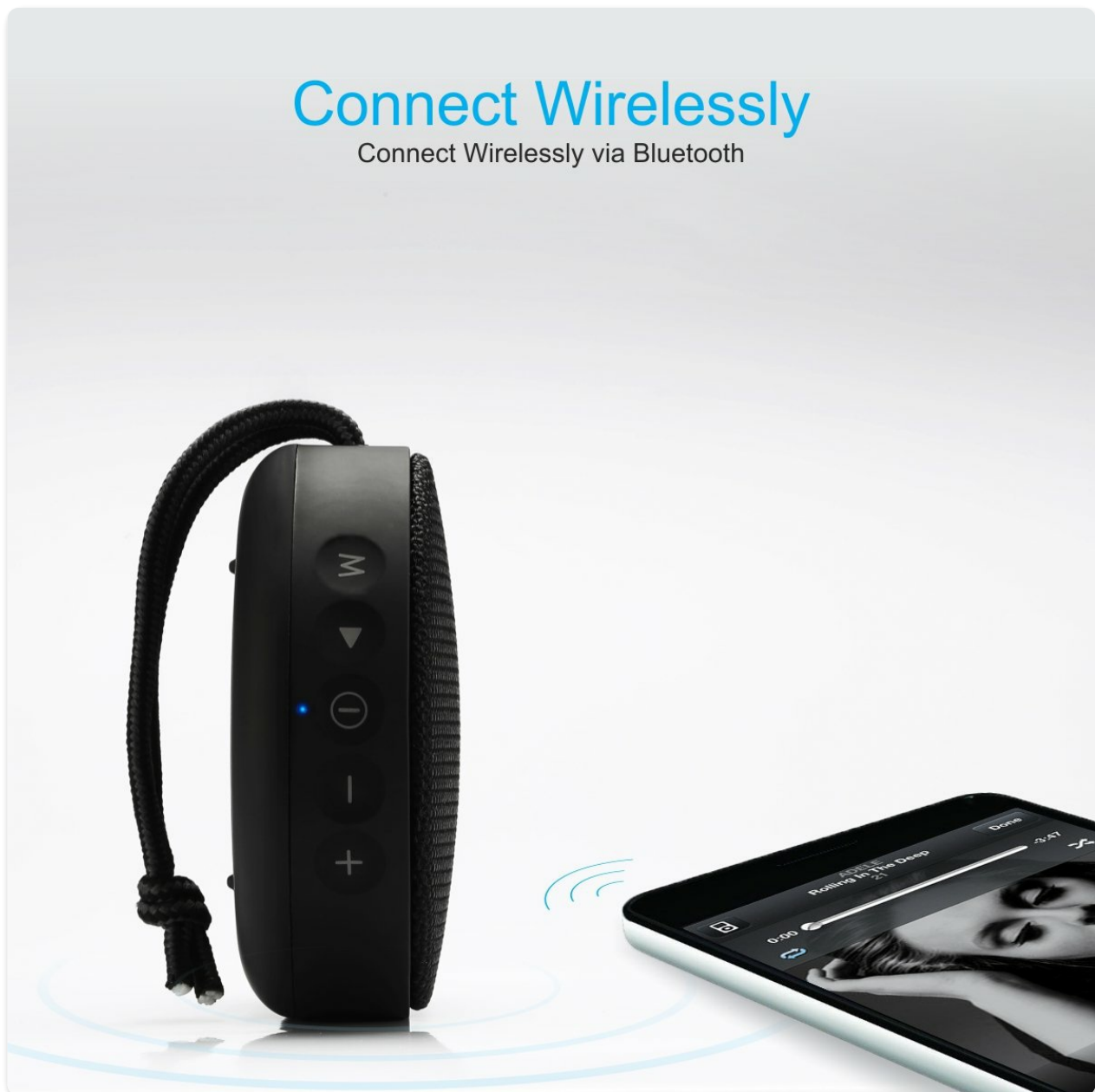
Image 4.1: The Portronics Sound Bun wirelessly connected to a smartphone via Bluetooth, illustrating its primary connectivity feature.