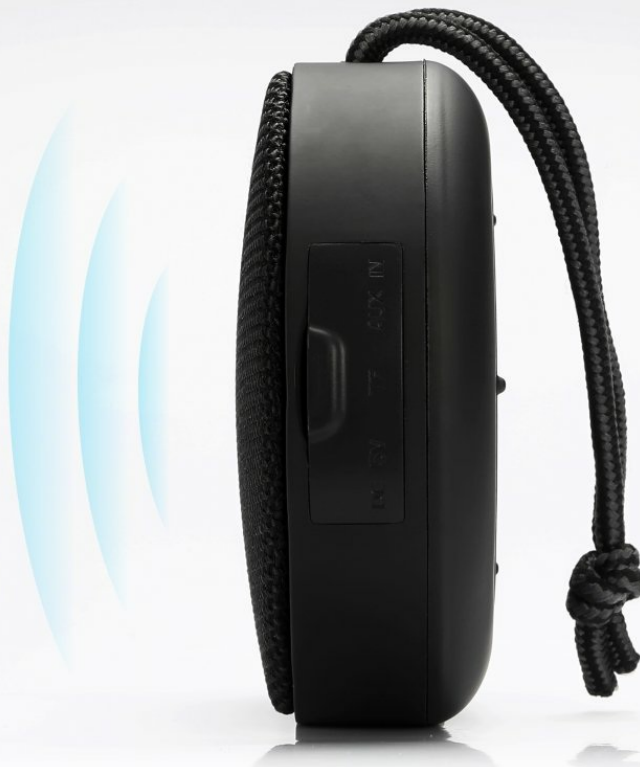
Image 3.1: Side view of the Portronics Sound Bun, highlighting the control buttons and input ports.