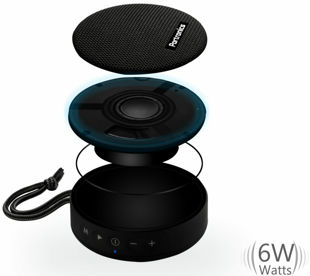
Image 8.1: An exploded diagram of the Portronics Sound Bun, illustrating its internal speaker components and highlighting its 6W audio output.

Engineered to produce big bass & powerful sound