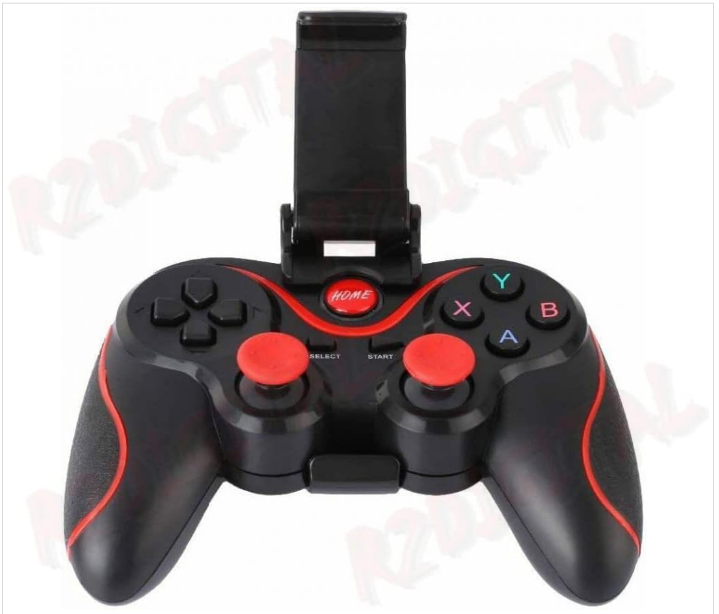
Figure 3.1: Linq S600 Gamepad with the smartphone holder attached, ready to hold a mobile device.