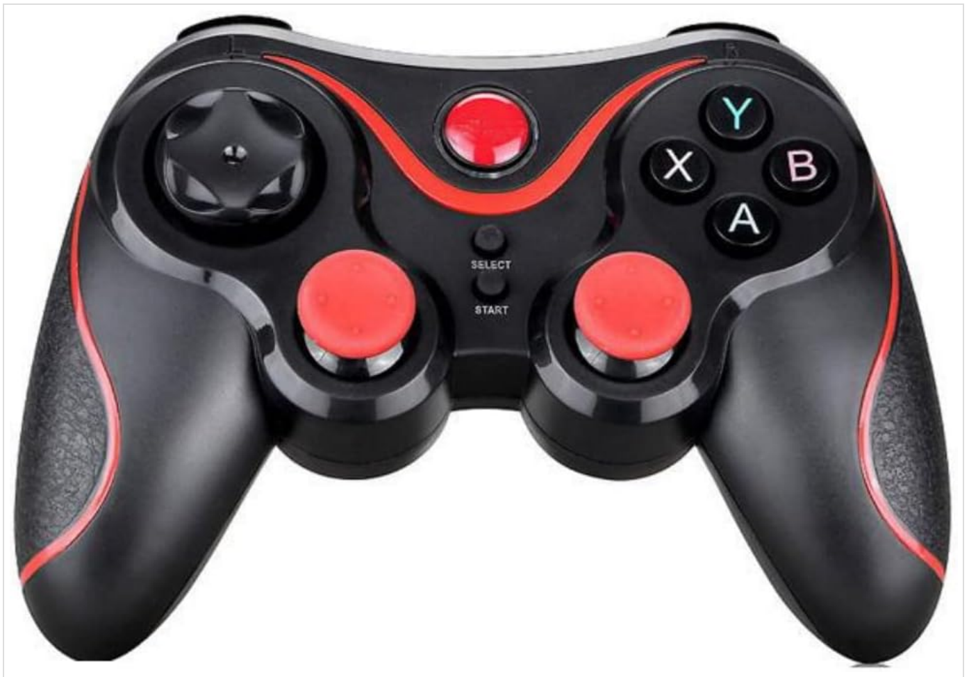
Figure 2.1: Front view of the Linq S600 Wireless Bluetooth Gamepad, showing the dual analog sticks, D-pad, action buttons (A, B, X, Y), Home, Select, and Start buttons, and red accents.