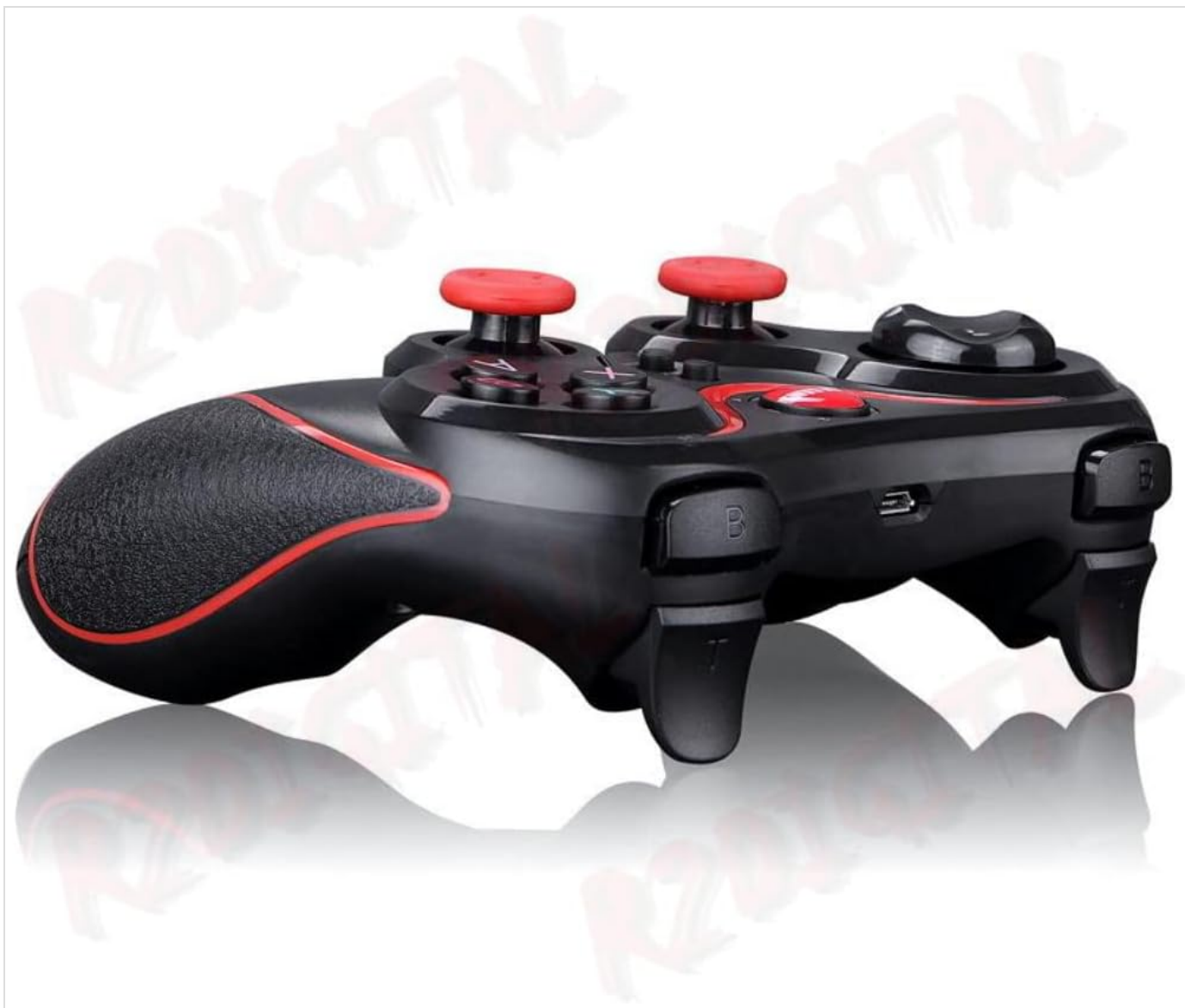
Figure 2.3: Side view of the Linq S600 Wireless Bluetooth Gamepad, highlighting the shoulder buttons and triggers, as well as the ergonomic grip design.