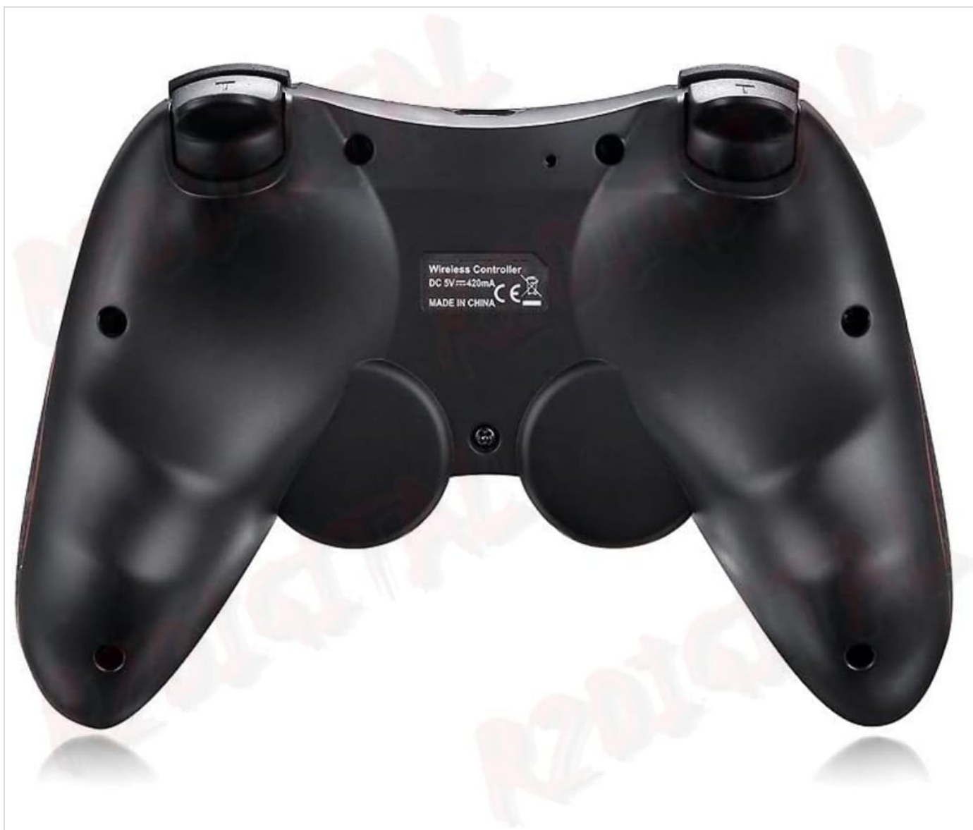
Figure 2.2: Back view of the Linq S600 Wireless Bluetooth Gamepad, displaying the battery compartment or charging port area and regulatory markings.