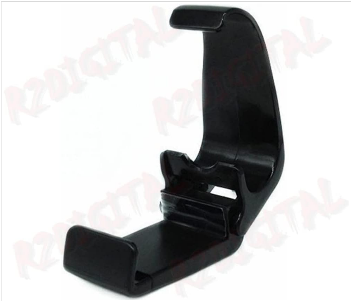
Figure 3.2: Close-up view of the detachable smartphone holder, showing its adjustable mechanism.