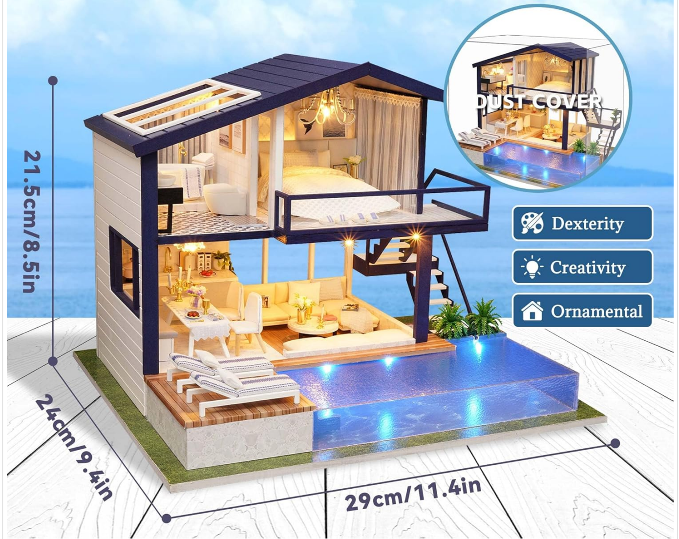
Figure 2: Overview of the Flever Perfect Time Apartment dollhouse, highlighting its dimensions and the included dust cover.