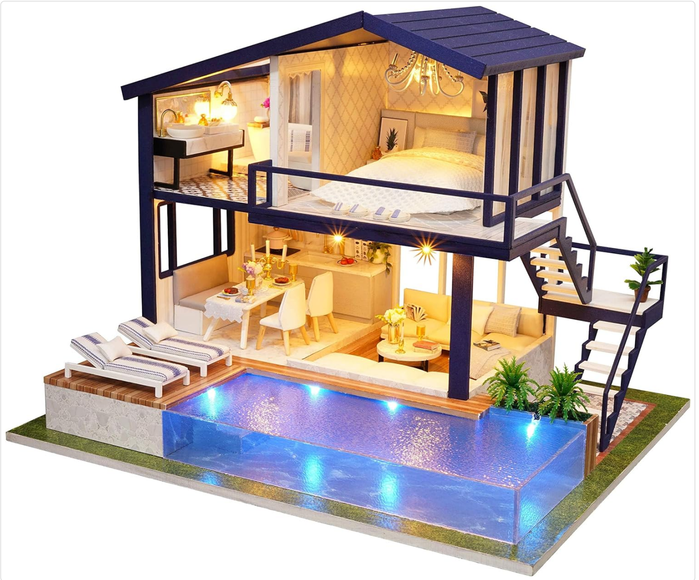
Figure 1: Fully assembled Flever Perfect Time Apartment dollhouse, showcasing the illuminated interior and exterior pool area.