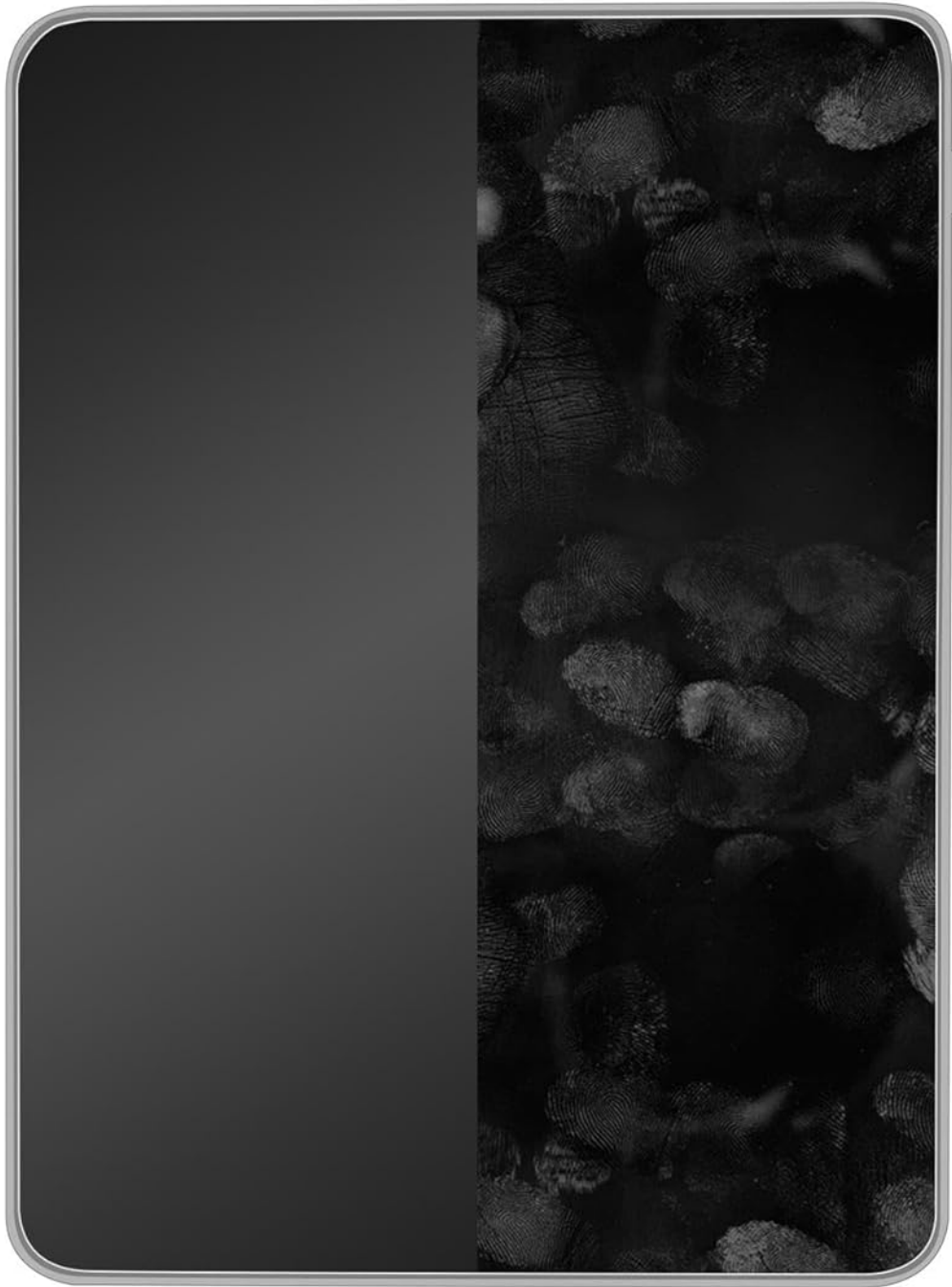
Image 3.2: A visual comparison highlighting the anti-smudge properties of the BoxWave screen protector versus a standard surface, showing reduced fingerprint visibility.