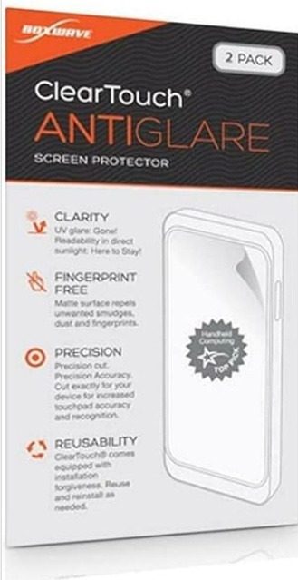
Image 1.1: The BoxWave ClearTouch Anti-Glare Screen Protector applied to a Getac ZX70 device, showcasing its precise fit and anti-glare properties.