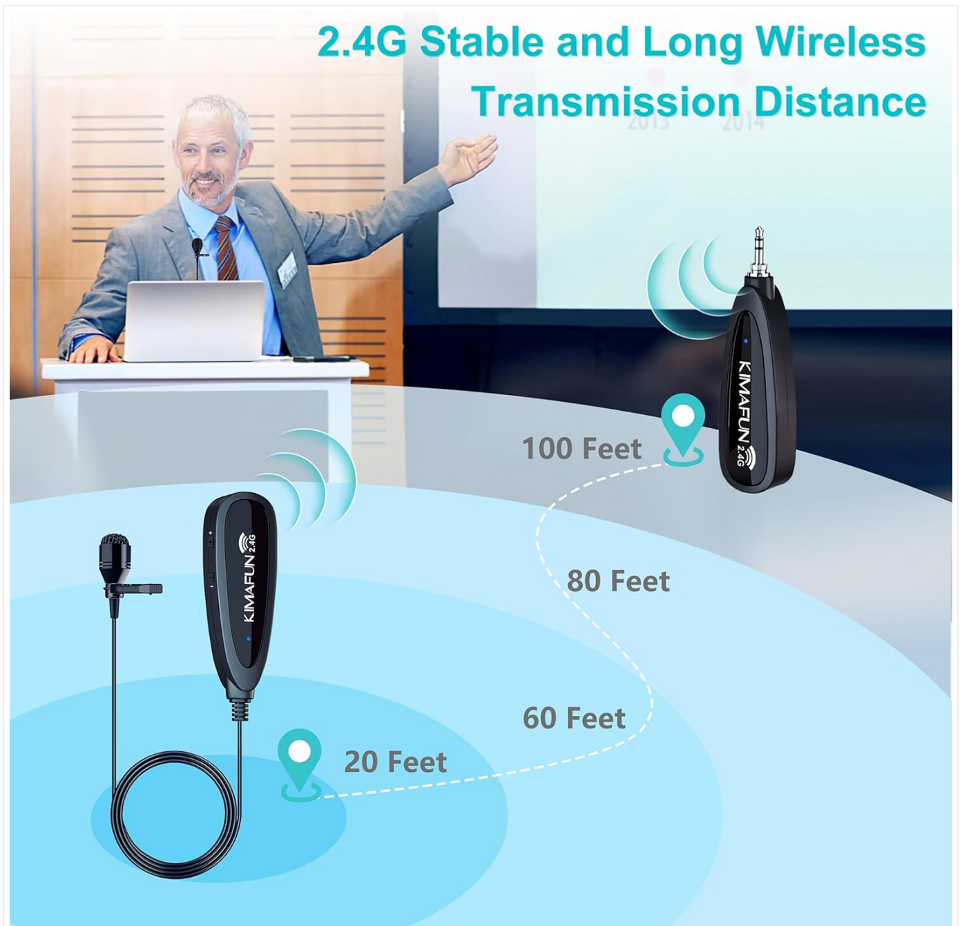
Figure 10: Wireless transmission range of up to 100 feet.