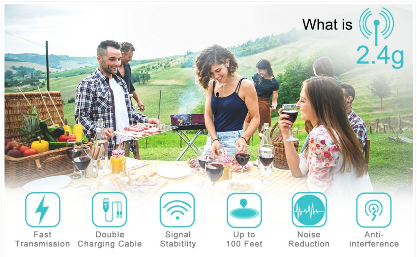
Figure 3: Key features of the 2.4G wireless technology.