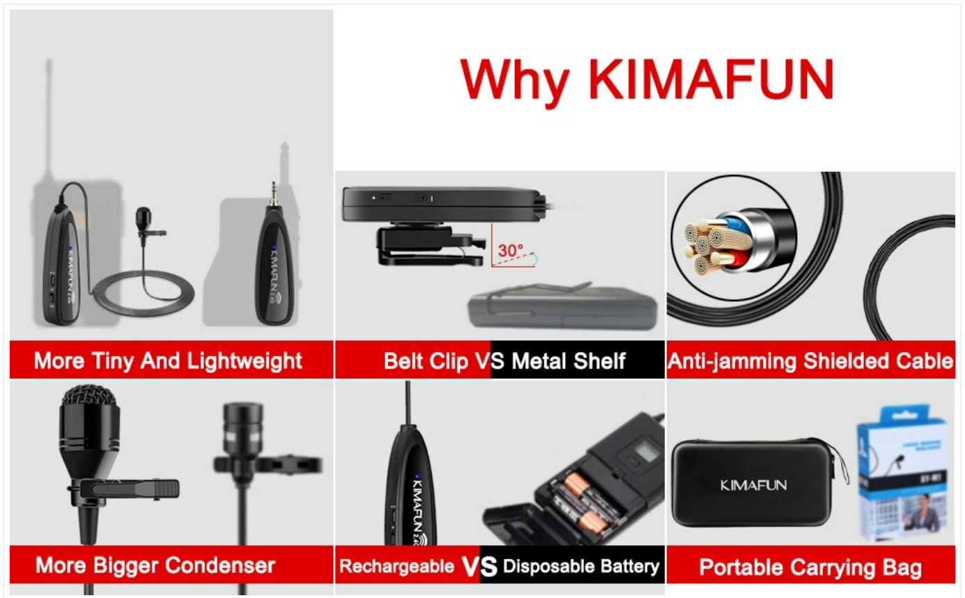
Figure 4: Advantages of the KIMAFUN microphone design.