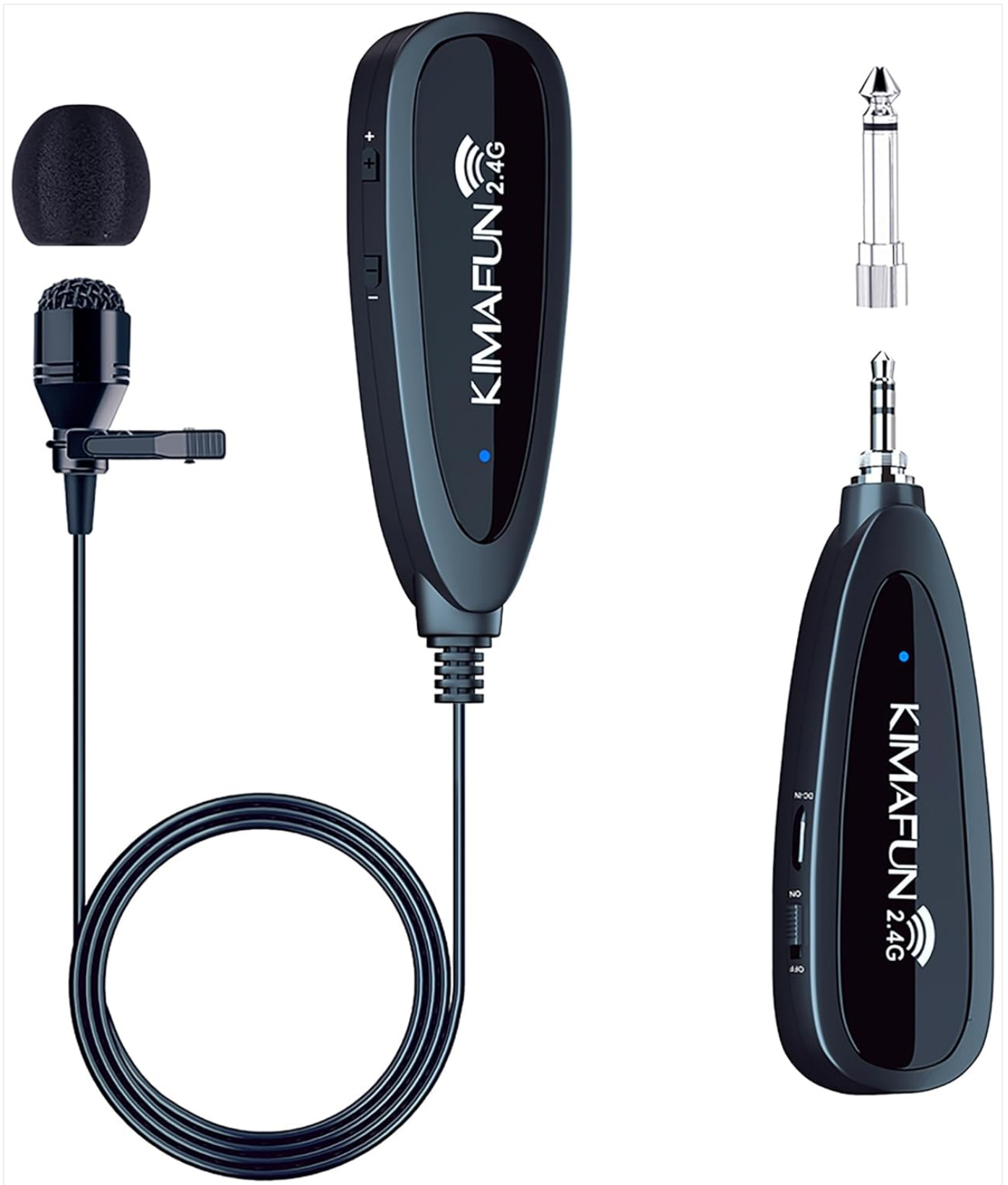
Figure 1: Overview of the KIMAFUN Wireless Lavalier Microphone System.