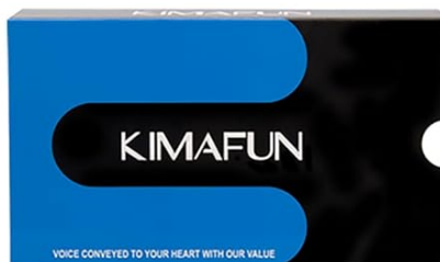
Box Sleeve * 1