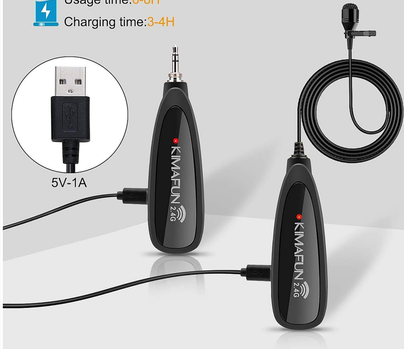
Figure 5: Charging the transmitter and receiver simultaneously.