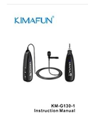
User Manual * 1