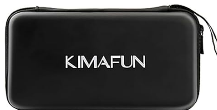
Carrying bag * 1