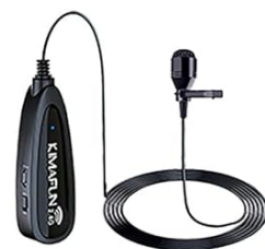
Lavalier microphone & Transmitter * 1