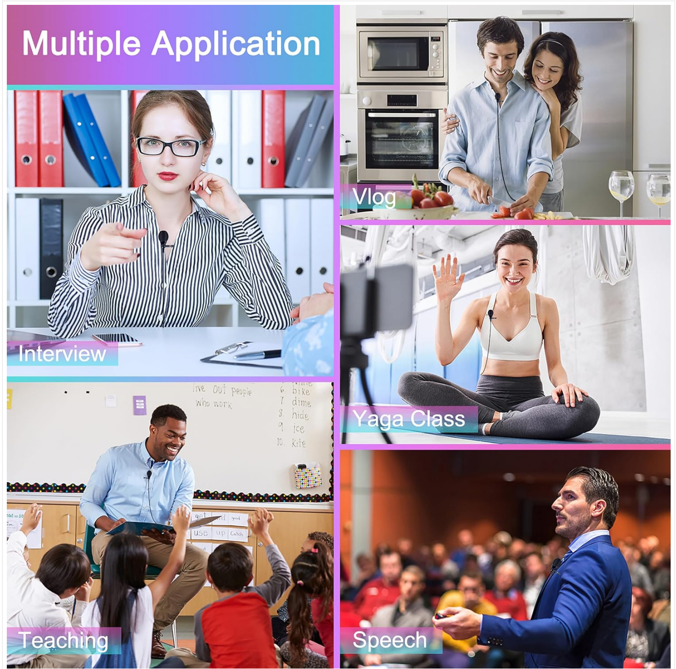
Figure 8: Multiple application scenarios for the microphone system.