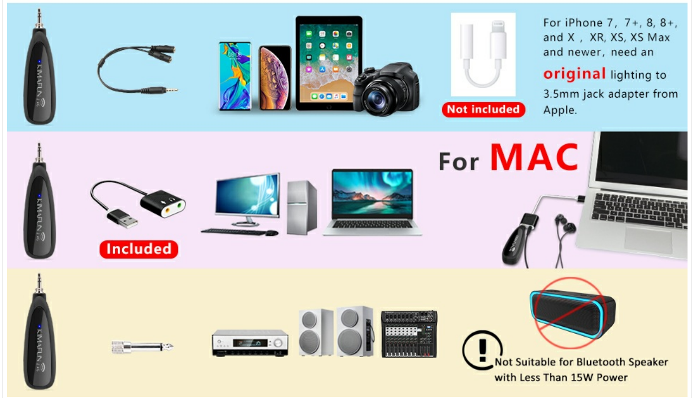
Figure 7: Connection methods and precautions for different devices.