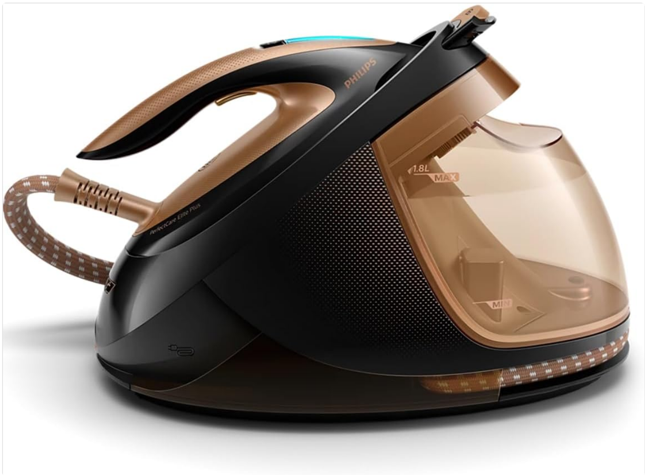
Figure 1: The Philips PerfectCare Elite Plus Steam Generator Iron, showing the iron unit and the base station with its 1.8L water tank.

Familiarize yourself with the components of your Philips PerfectCare Elite Plus steam generator iron.