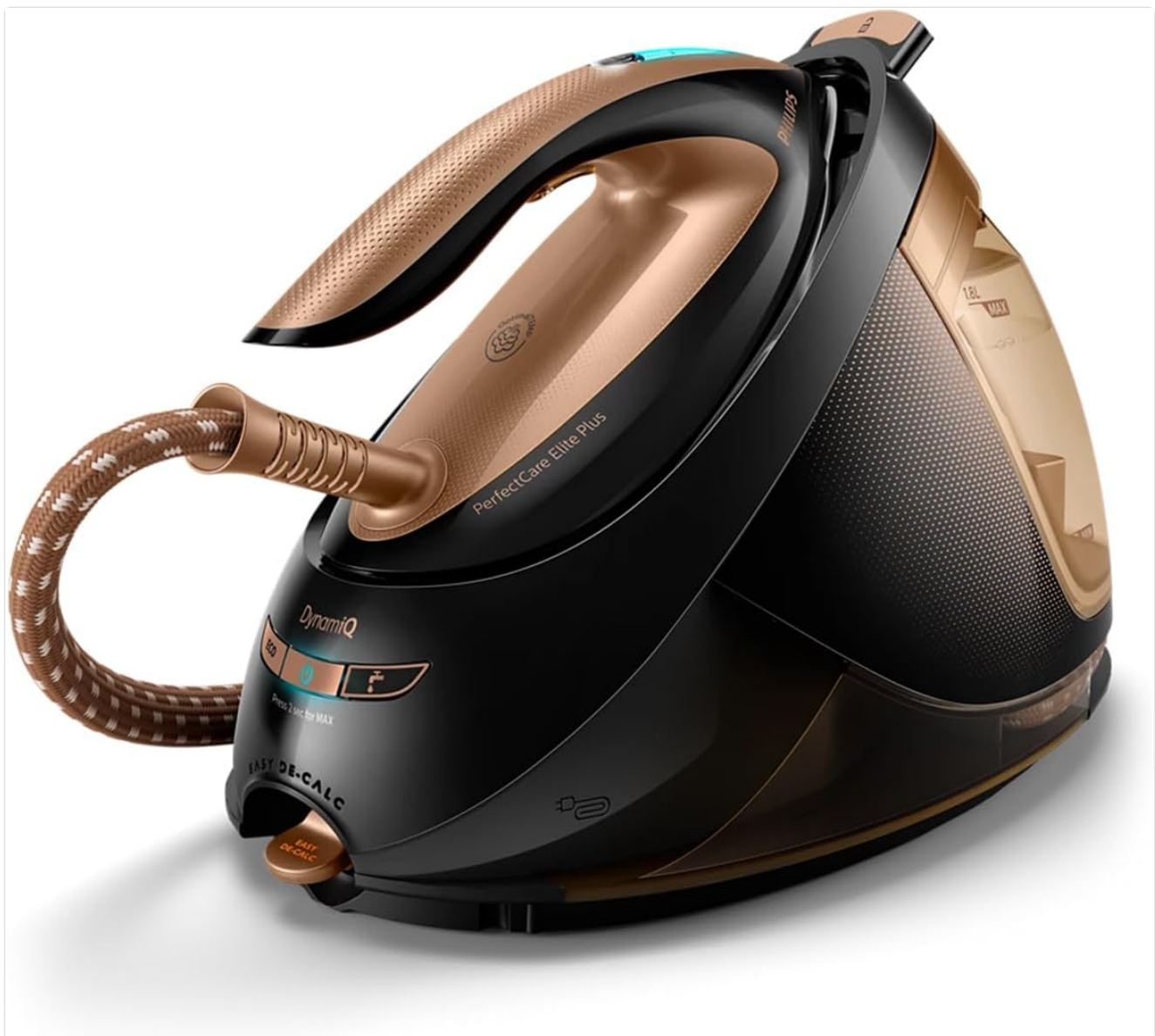
Figure 4: The blue indicator light on the iron handle, signifying that OptimalTEMP technology is active and the iron is ready for use on any fabric.

Your Philips PerfectCare Elite Plus is equipped with OptimalTEMP technology. This means you can iron all ironable fabrics, from denim to silk, without adjusting the temperature and without the risk of burning. The iron automatically provides the perfect combination of temperature and steam for every fabric type.