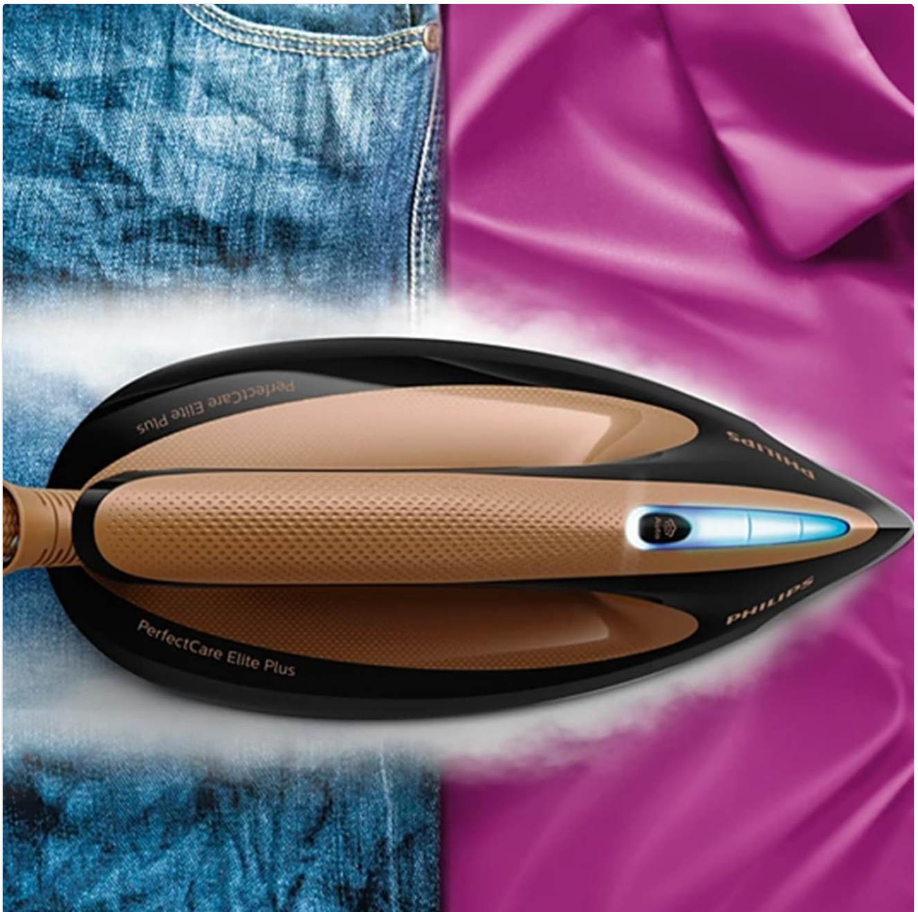
Figure 5: Visual representation of the powerful steam output from the iron's soleplate, effectively penetrating fabric fibers.