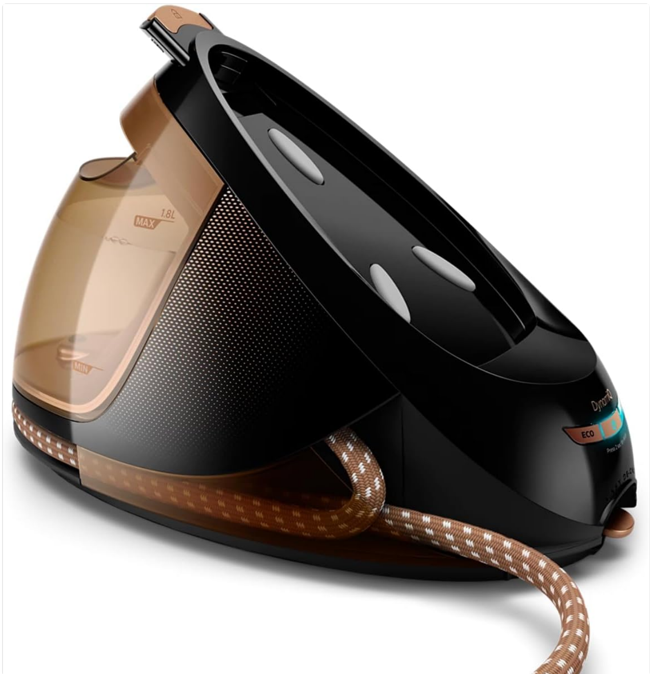
Figure 3: The removable 1.8L water tank, clearly showing the MAX fill line for easy refilling.