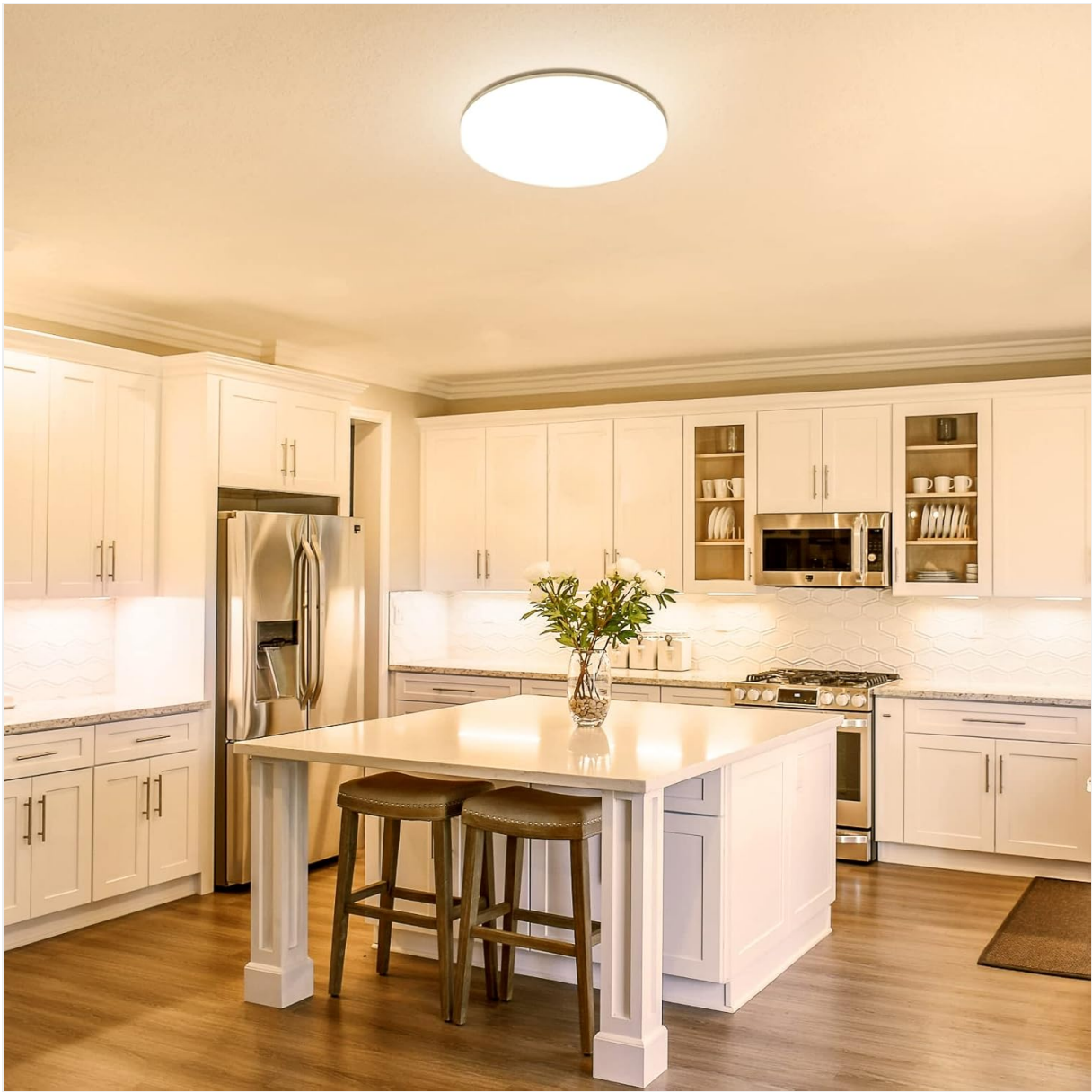
Figure 2.2: The ceiling light illuminating a modern kitchen, showcasing its broad light distribution.