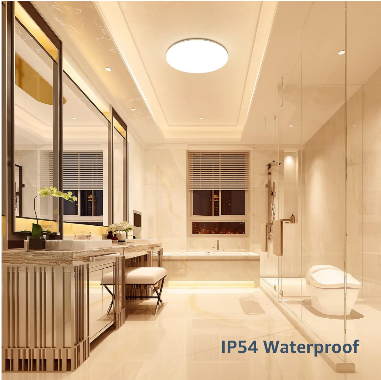
Figure 2.3: The IP54 waterproof design makes this light suitable for bathroom environments.