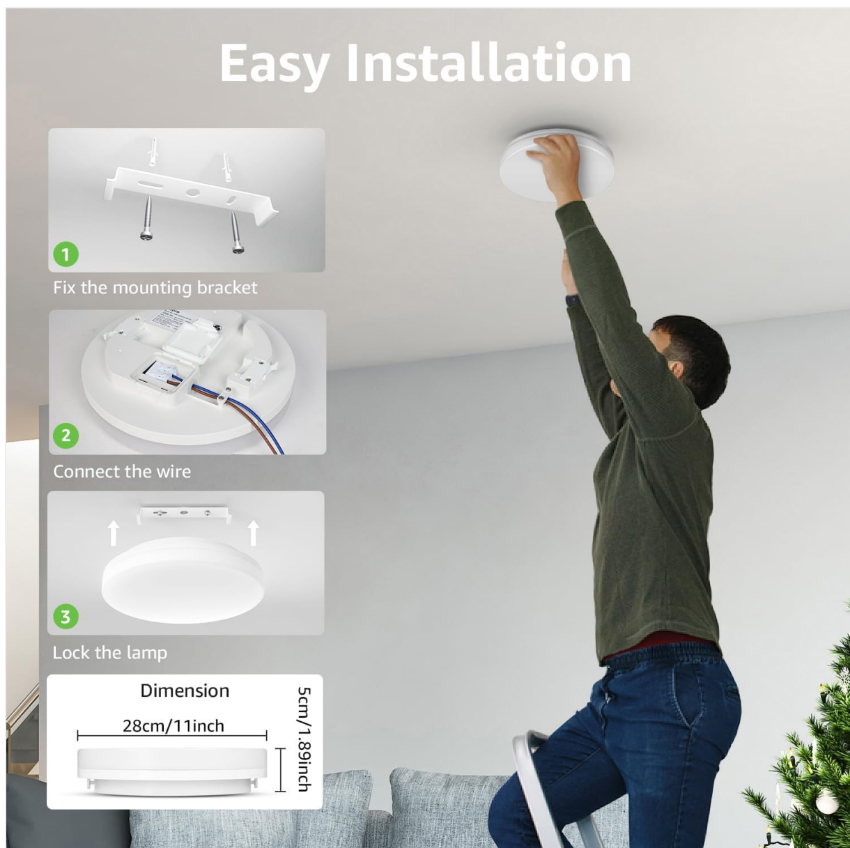
Figure 3.1: Visual guide for installing the ceiling light, showing bracket removal, wire connection, and final mounting.

Your browser does not support the video tag.