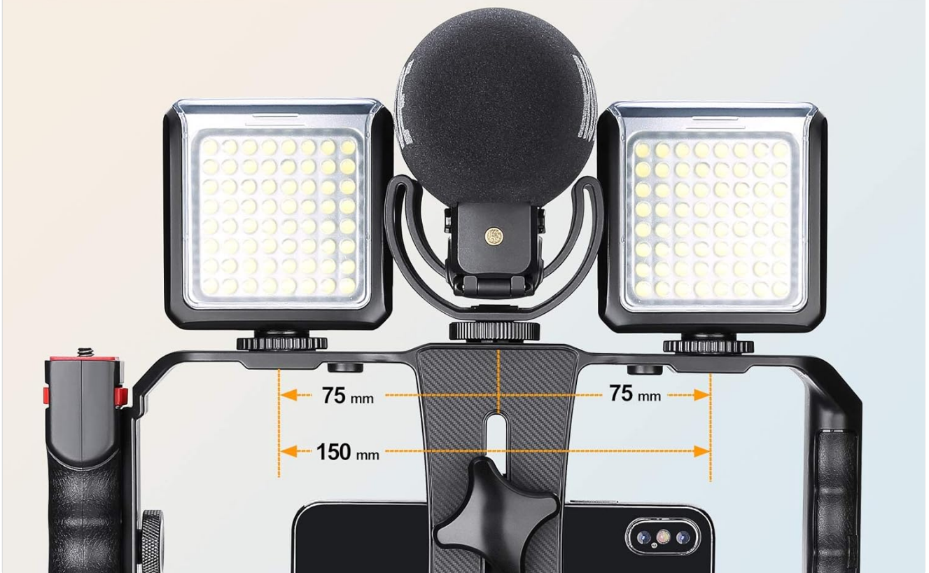
Figure 3: Close-up view of the three cold shoe mounts on the top of the rig, demonstrating how accessories like lights and microphones can be attached.