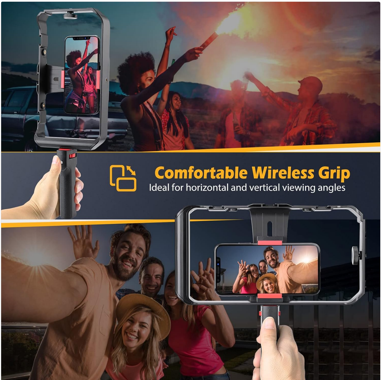
Figure 4: Demonstrates holding the rig with two hands for horizontal shooting and with a single handle for vertical shooting.