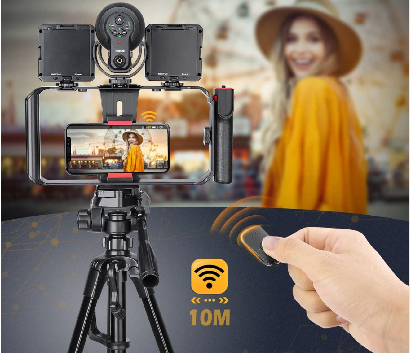
Figure 5: The wireless remote shutter detached from the handle, illustrating its use for remote control of the smartphone camera.