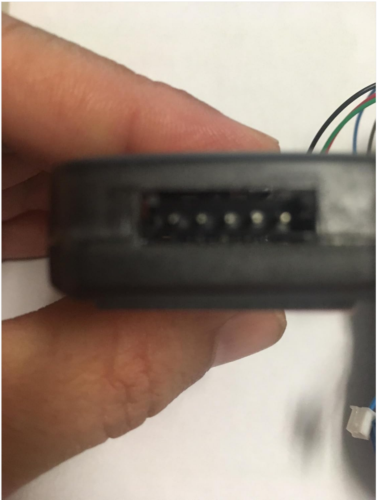
Figure 4.2: Detail of the 5-pin connection port on the antenna unit.