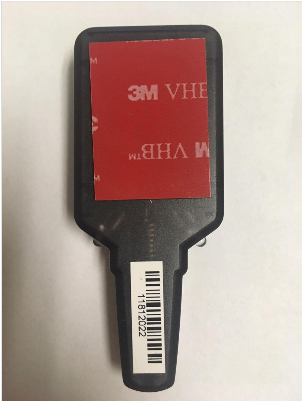
Figure 4.1: Rear view of the antenna unit, displaying the barcode (11812022) and adhesive backing.