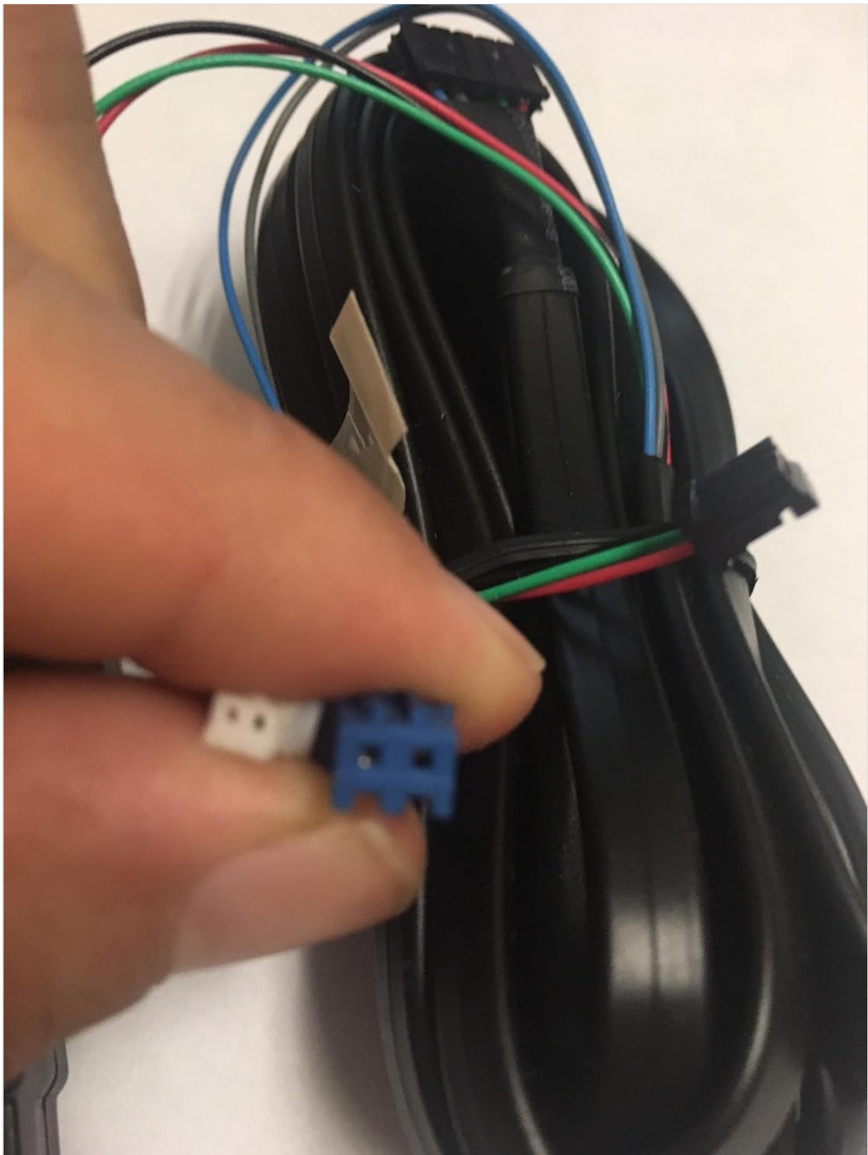
Figure 4.5: Example of another small connector on the antenna cable, potentially for different system configurations.