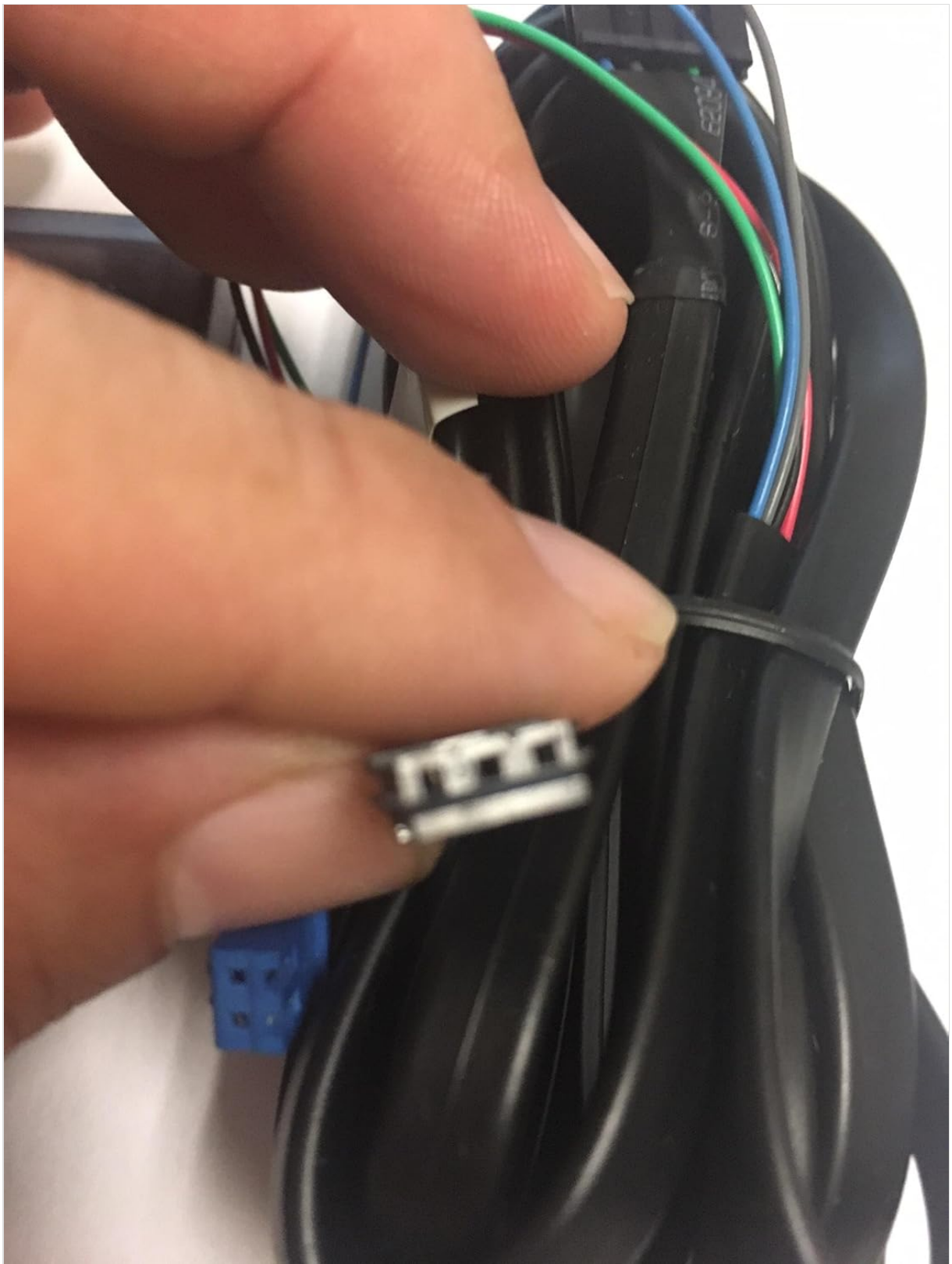
Figure 4.4: Example of a smaller connector on the antenna cable, which may be used for specific system integrations.