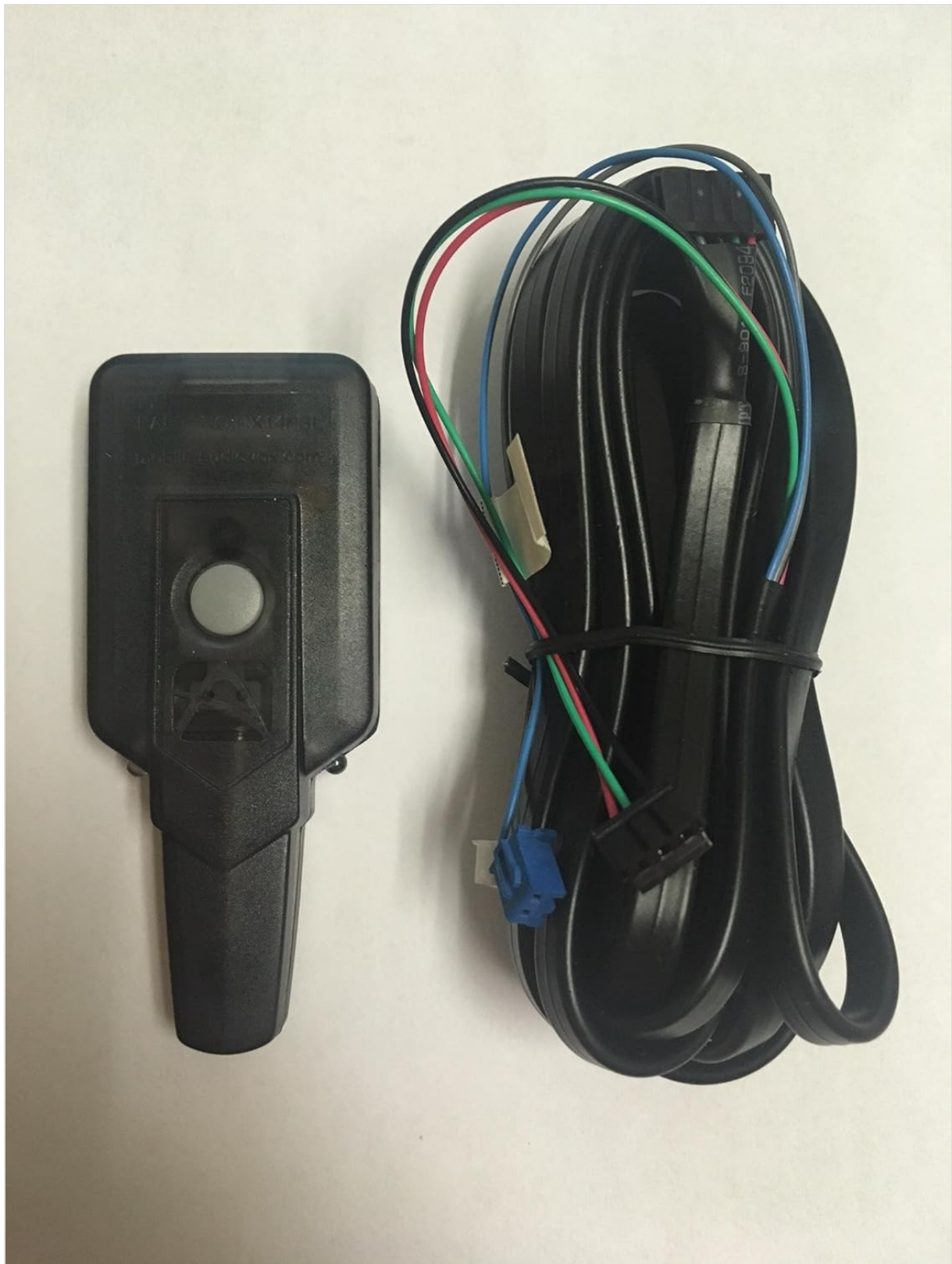
Figure 3.1: The Audiovox Prestige RX14PBL Antenna unit and its accompanying cable.