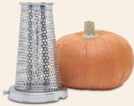
Pumpkin Screen Coarse Holes (0.12 in / 2.86 mm)