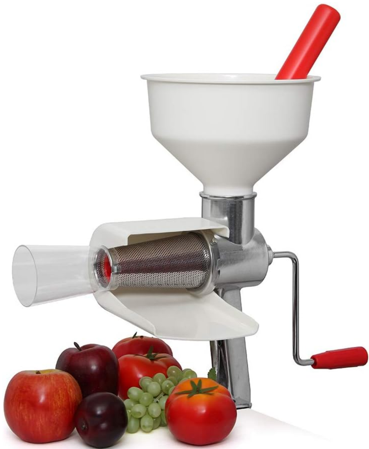
Figure 2: Exploded view showing all components for assembly.