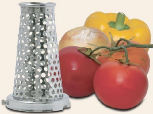
Salsa Screen Extra Coarse Holes (0.23 in / 5.8 mm)