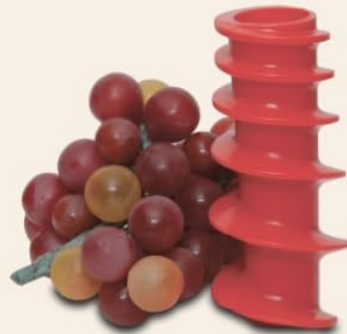
Grape Spiral Short (5.375 in / 13.65 cm)