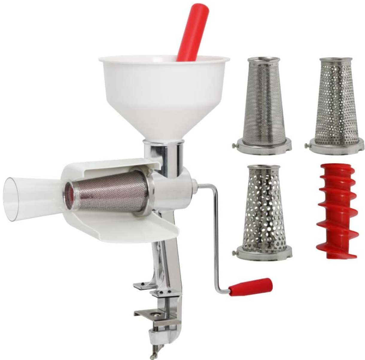
Figure 1: KITCHEN CROP Model 250 Food Strainer with included accessories.