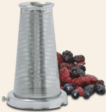
Berry Screen Extra Fine Holes (0.04 in / 1 mm)