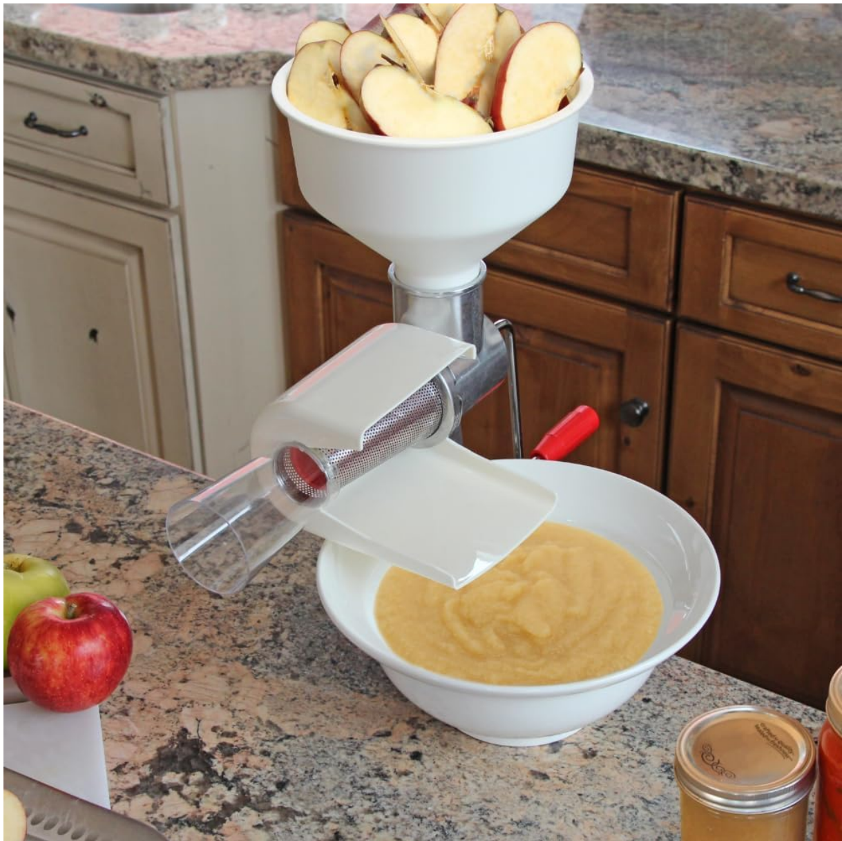
Figure 5: Fresh applesauce collected after straining.