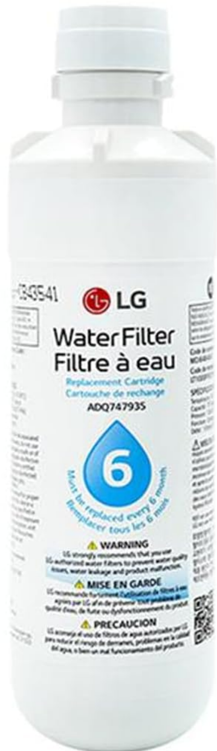
Image: LG LT1000P Water Filter in its retail packaging.