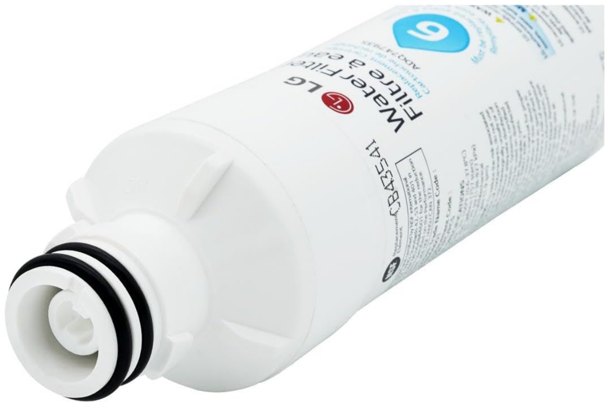
Image: Close-up view of the filter's top, showing the O-rings for a secure seal.