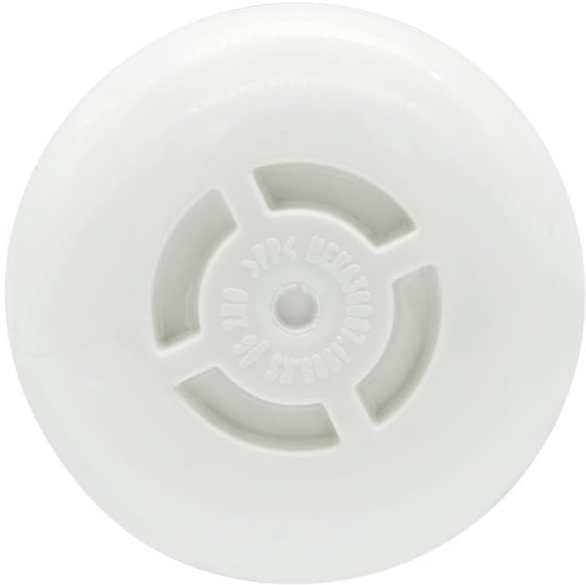
Image: New LG LT1000P water filter with its protective cap removed, ready for installation.