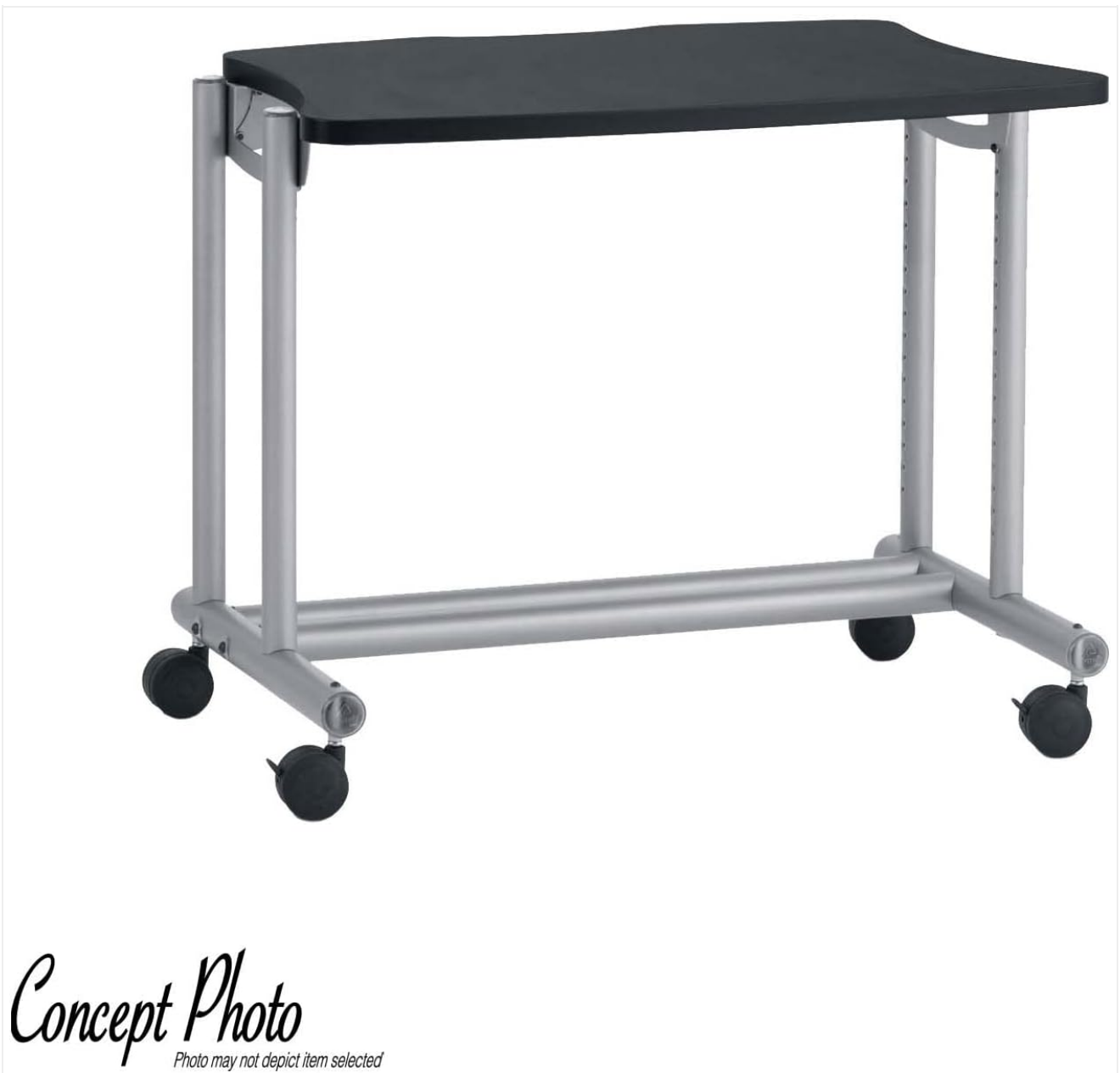
Figure 5.1: Example of casters installed on a piece of furniture.

Always ensure all casters are either fully engaged or fully disengaged to prevent uneven stress on the furniture and potential damage.