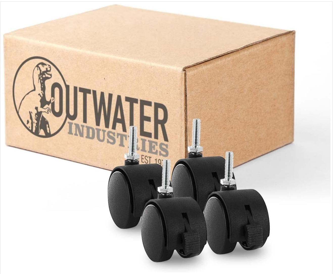
Figure 1.1: OUTWATER 2" Black Nylon Swivel Hooded Samson Twin Wheel Casters (4-pack) with packaging.