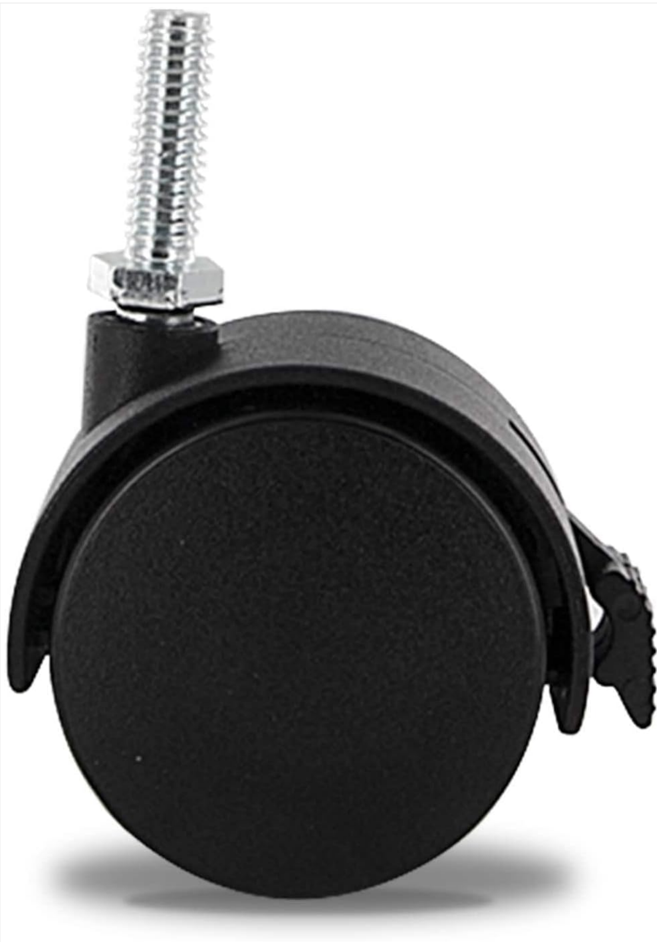
Figure 1.2: Detailed view of a single caster, highlighting the brake mechanism.