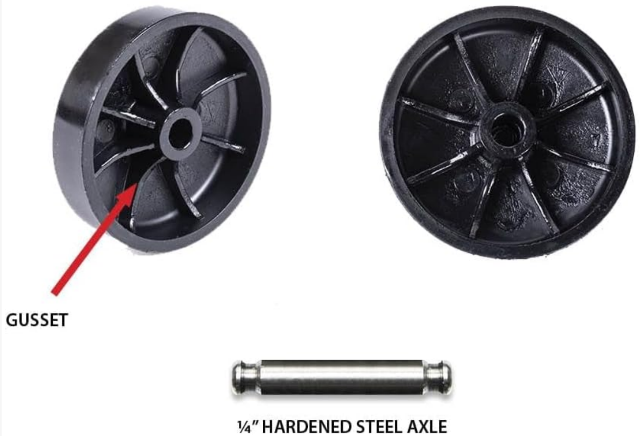
Figure 2.1: Illustration of gusset-reinforced wheels and hardened steel axle for enhanced strength.