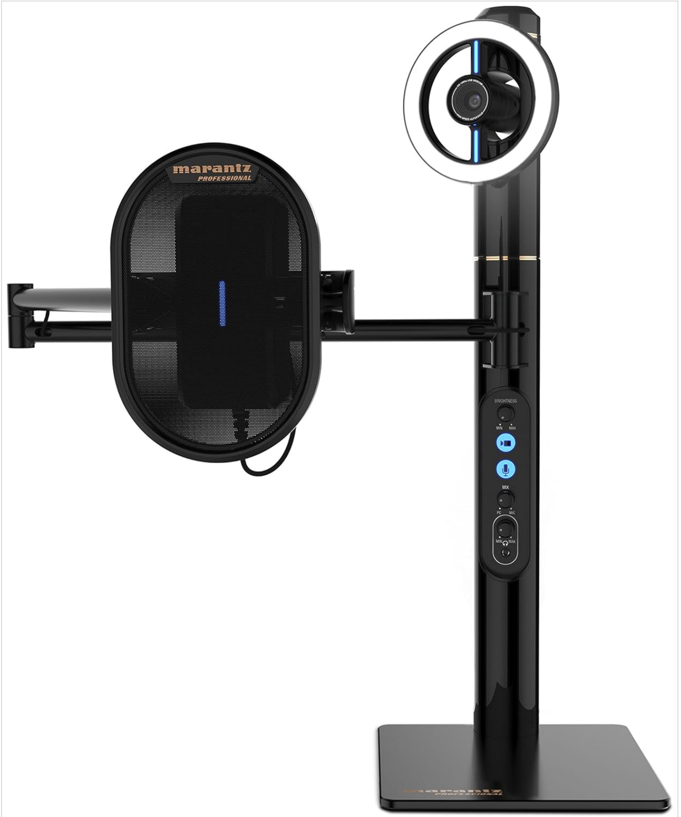
Image: Front view of the Marantz Professional Turret system, showcasing the webcam, LED light ring, and external microphone with pop filter.

The Marantz Professional Turret combines essential broadcasting tools into a single, compact unit. It features a high-definition webcam, a professional-grade condenser microphone, and an adjustable LED light ring for optimal illumination.