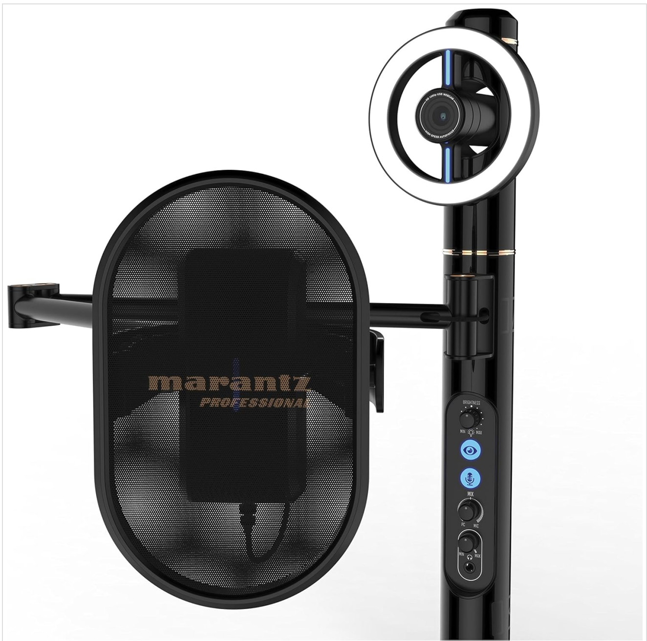
Image: Close-up view of the control panel on the Turret's main column, showing buttons for brightness, volume, camera on/off, and microphone on/off.