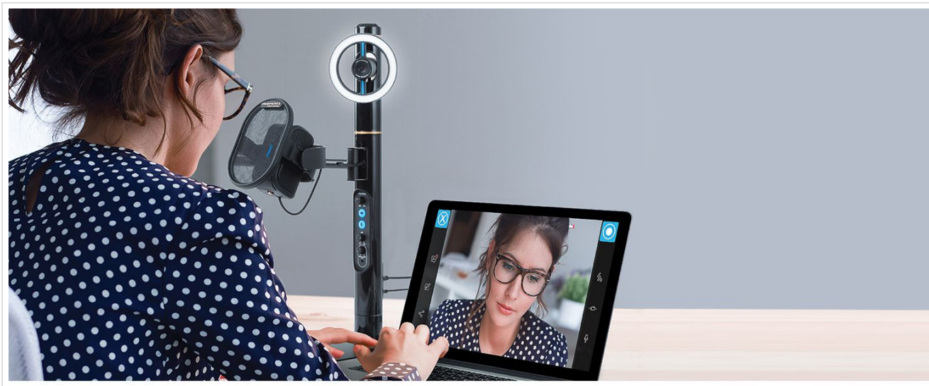
Image: A user looking into the Marantz Turret webcam while operating a laptop, demonstrating typical usage for video calls or streaming.