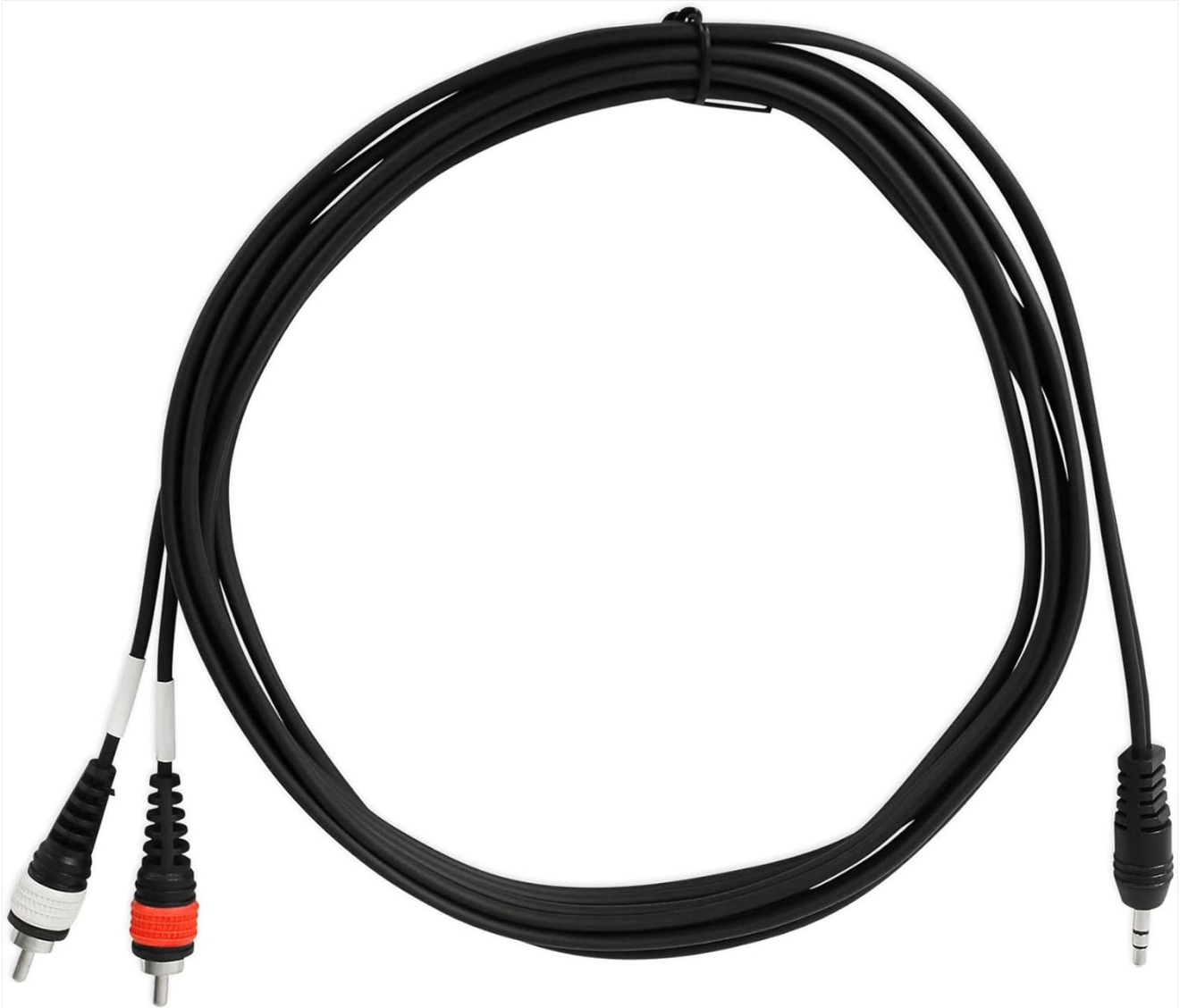
Image: Auxiliary RCA Line In/RCA Line Out Cable for connecting external audio sources.