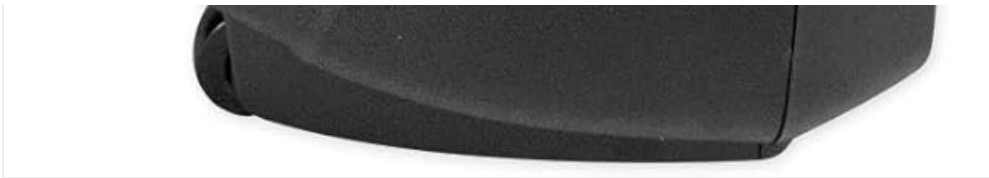
Image: Remote control for the Rockville RAM12BT speaker, allowing convenient operation.