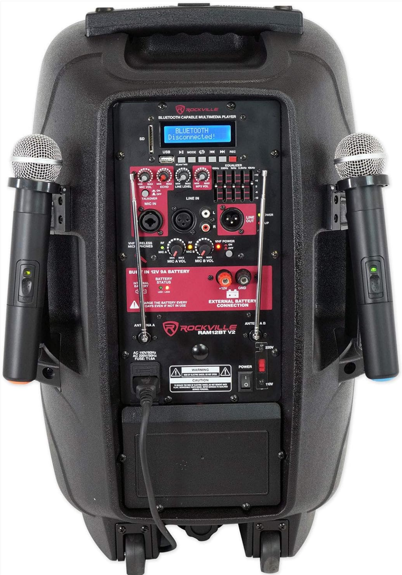
Image: Top panel of the Rockville RAM12BT speaker, displaying the power switch, input ports, and control knobs.