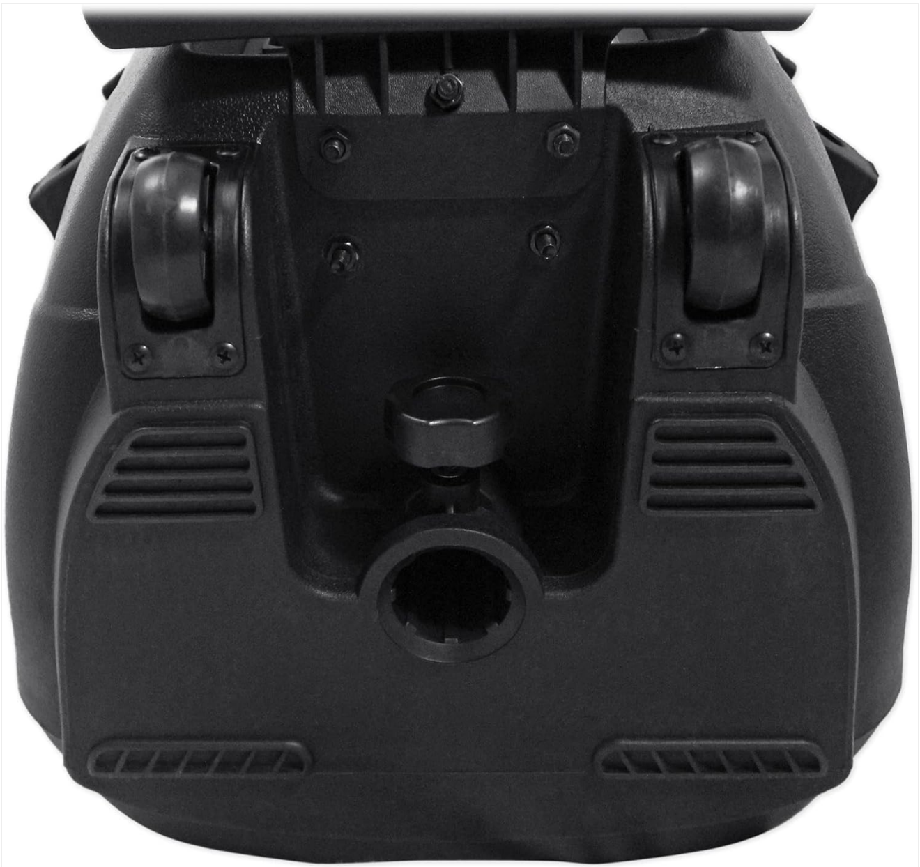
Image: Side view of the Rockville RAM12BT speaker, highlighting the carry handle for portability.