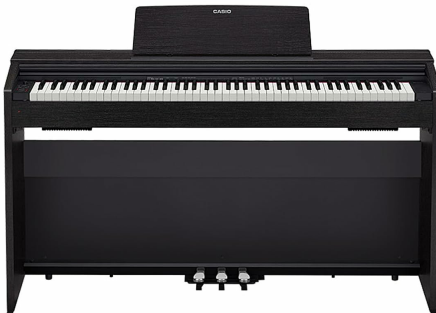
Figure 1: Front view of the Casio Privia PX-870 Digital Piano.

The Casio Privia PX-870 is an 88-key weighted console digital piano designed to deliver an authentic piano experience. It features the Tri-Sensor II Scaled Hammer Action keyboard with simulated ebony and ivory textures, providing a realistic touch and dynamic control. The AiR Sound Source offers rich detail with advanced damper and string resonance, key-off simulation, and mechanical sounds, recreating the depth of a concert grand piano. Equipped with a powerful 40W 4-speaker Sound Projection system, the PX-870 fills any room with immersive sound. It also includes features built for learning and practice, such as Duet Mode, dual headphone jacks, 60 built-in songs, a 2-track MIDI recorder, and Concert Play with orchestral backing tracks. Its sleek console design with a sliding key cover and class-compliant USB-MIDI connectivity make it a versatile instrument for any setting.