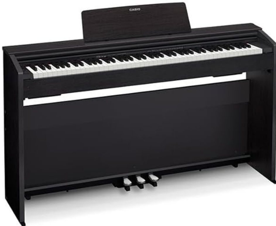
Figure 2: Side view of the Casio Privia PX-870 Digital Piano, showing its console design.