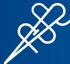
Image: Close-up view of the automatic needle threader mechanism, showing how it assists in threading the needle.