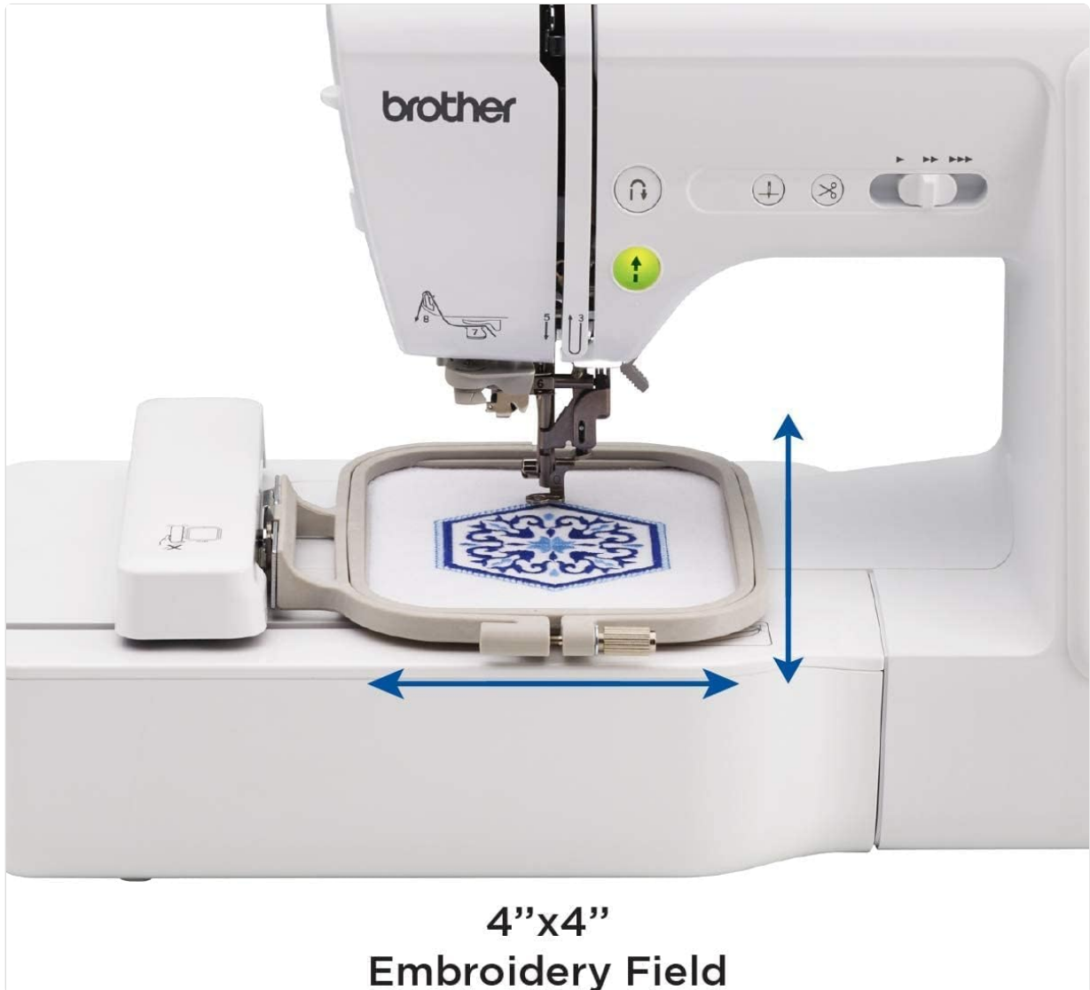
Image: A clear view of the 4"x4" embroidery field with a hoop attached, indicating the working area for embroidery projects.