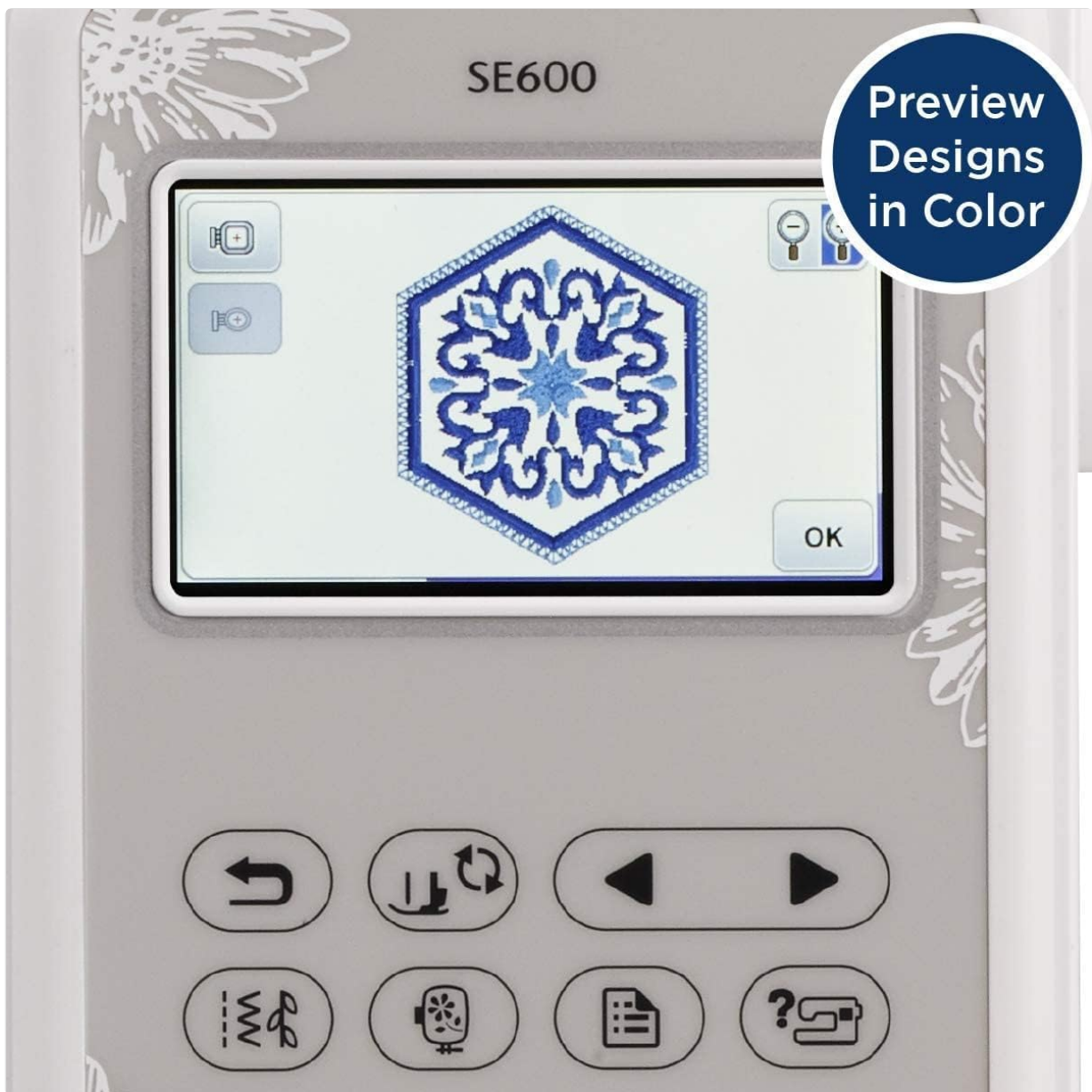
Image: Close-up of the 3.2-inch LCD touchscreen displaying a colorful embroidery design, highlighting the preview function.