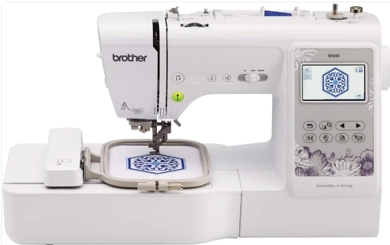
Image: The Brother SE600 Sewing and Embroidery Machine, showcasing its compact design and integrated embroidery unit.

The Brother SE600 is a versatile sewing and embroidery machine designed for creative projects. It combines advanced features with user-friendly operation, making it suitable for both beginners and experienced crafters. This manual provides essential information for setting up, operating, and maintaining your machine.