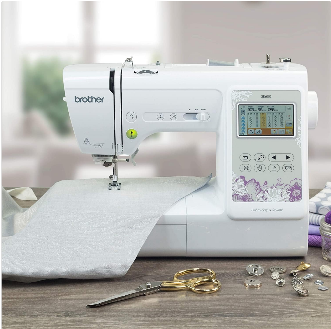
Image: The Brother SE600 machine actively sewing on a piece of light-colored fabric, demonstrating its sewing capabilities.