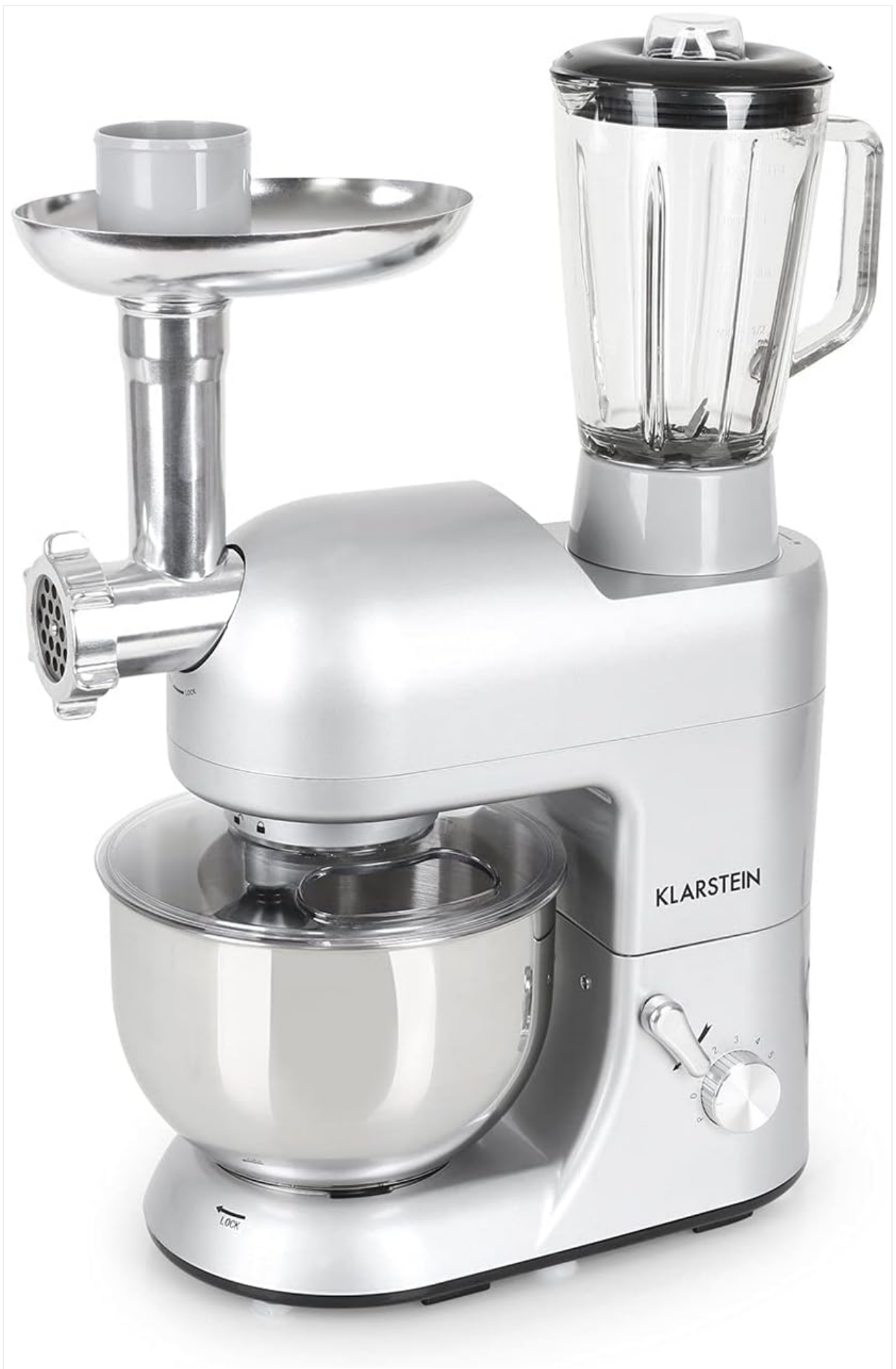
Figure 2: All included accessories for the Lucia Argentea. This includes the mixing bowl, dough hook, stirring beater, whisk, splash