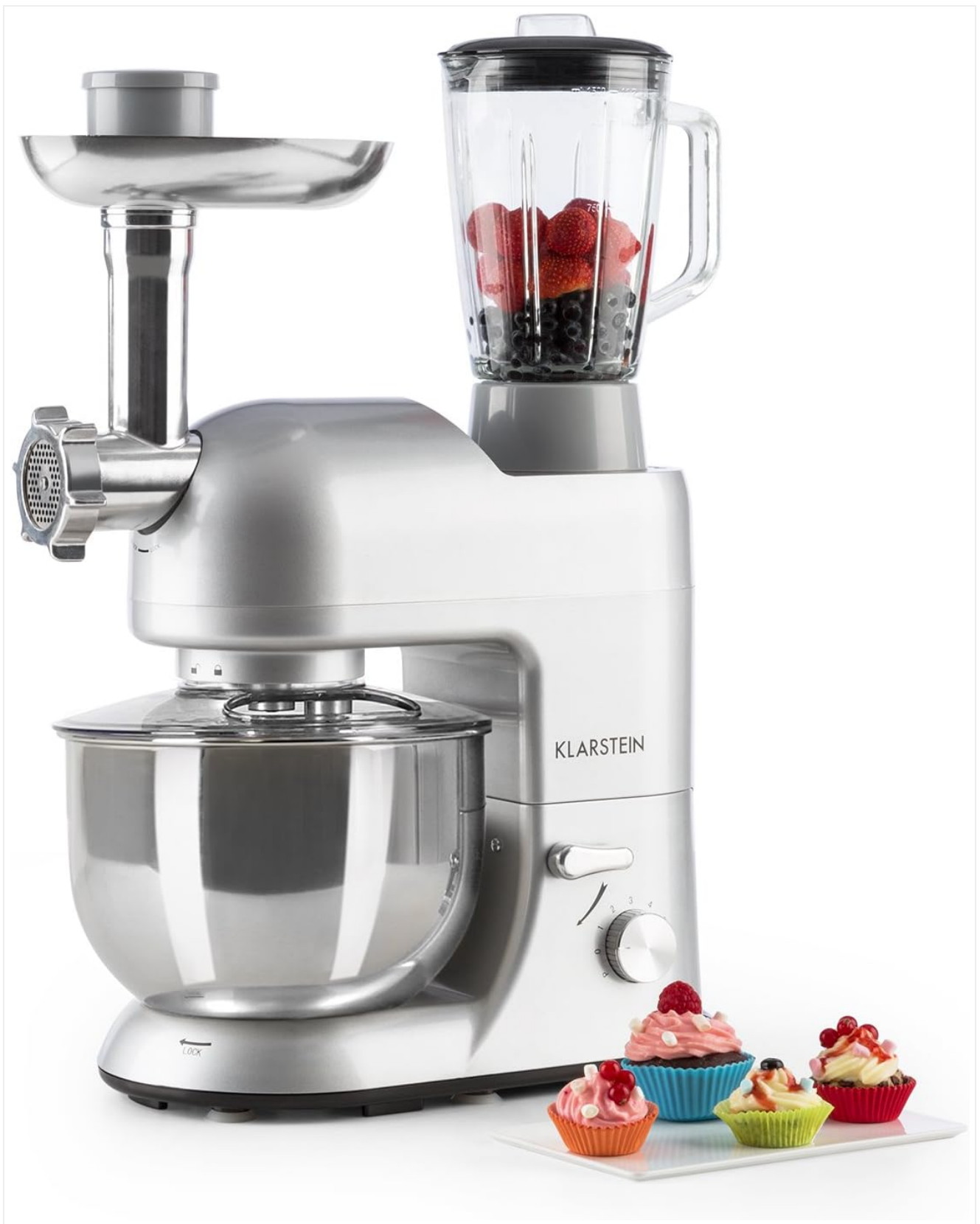
Figure 1: Main unit with stand mixer, meat grinder, and blender attachments. This image shows the complete multi-functional kitchen machine, highlighting its primary components.