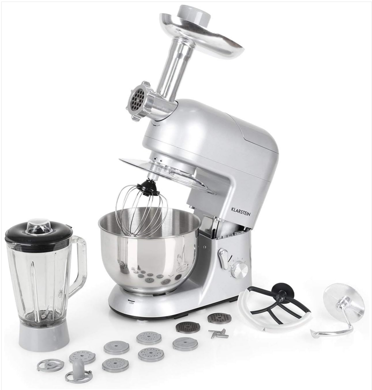
Figure 3: The 5.3 qt stainless steel bowl with splash guard, designed for thorough and homogeneous mixing results.