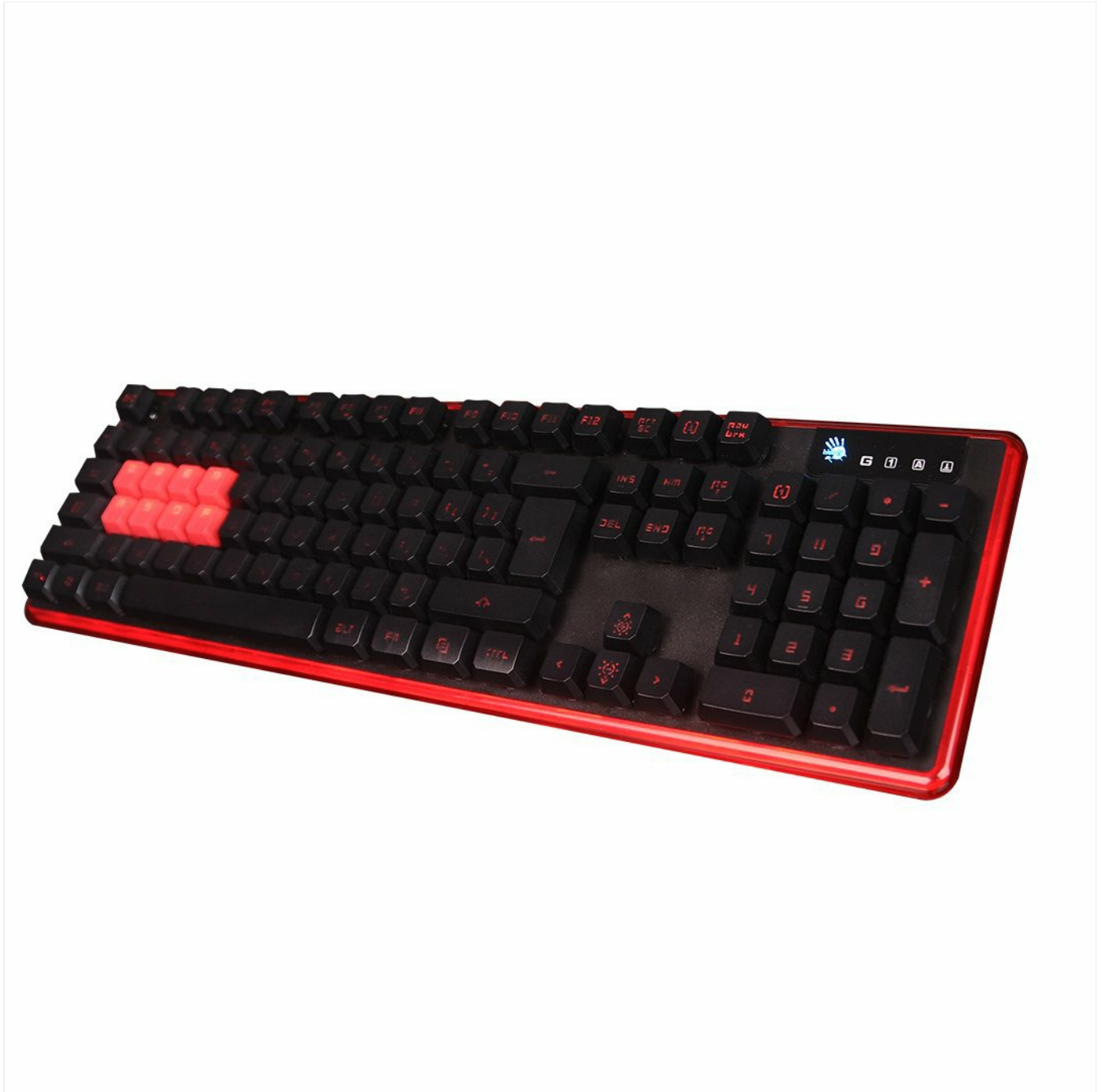
Image: A close-up view of the Bloody B2278 Gaming Keyboard, highlighting the red ABS gaming keycaps.

The keyboard includes 8 x ABS keycaps designed for enhanced comfort and durability during intense gaming. These are typically for the QWERTASDF keys.