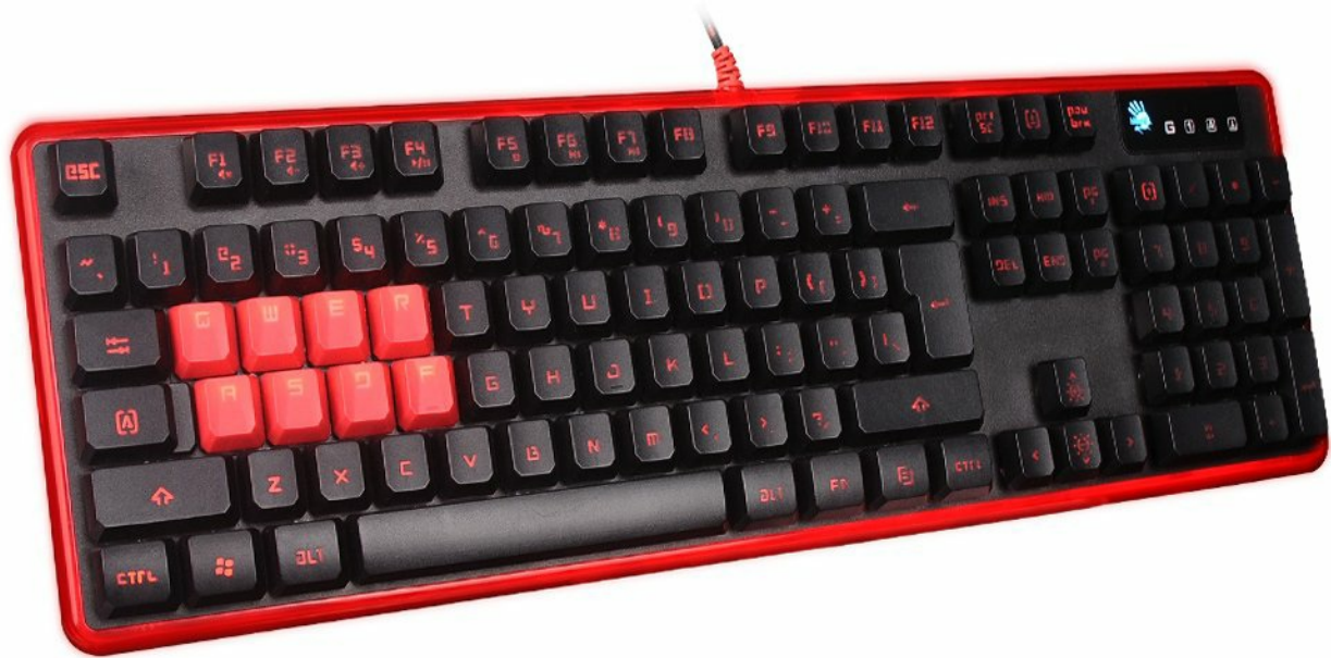
Image: The Bloody B2278 Gaming Keyboard with its USB cable, ready for connection.