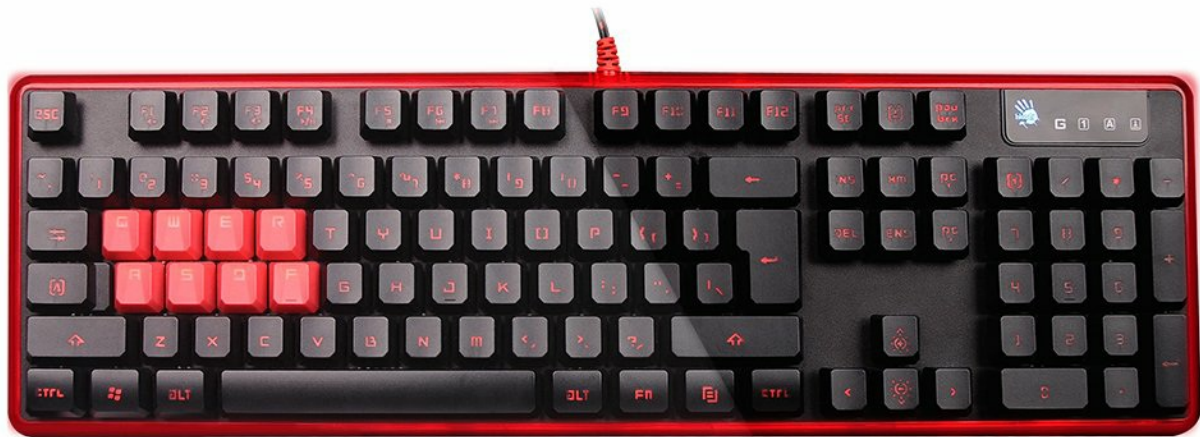
Image: Top-down view of the Bloody B2278 Gaming Keyboard, showcasing its full layout and red accents.