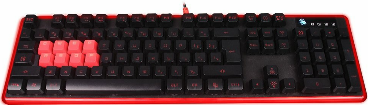
Image: The Bloody B2278 Gaming Keyboard illuminated with its red backlighting.