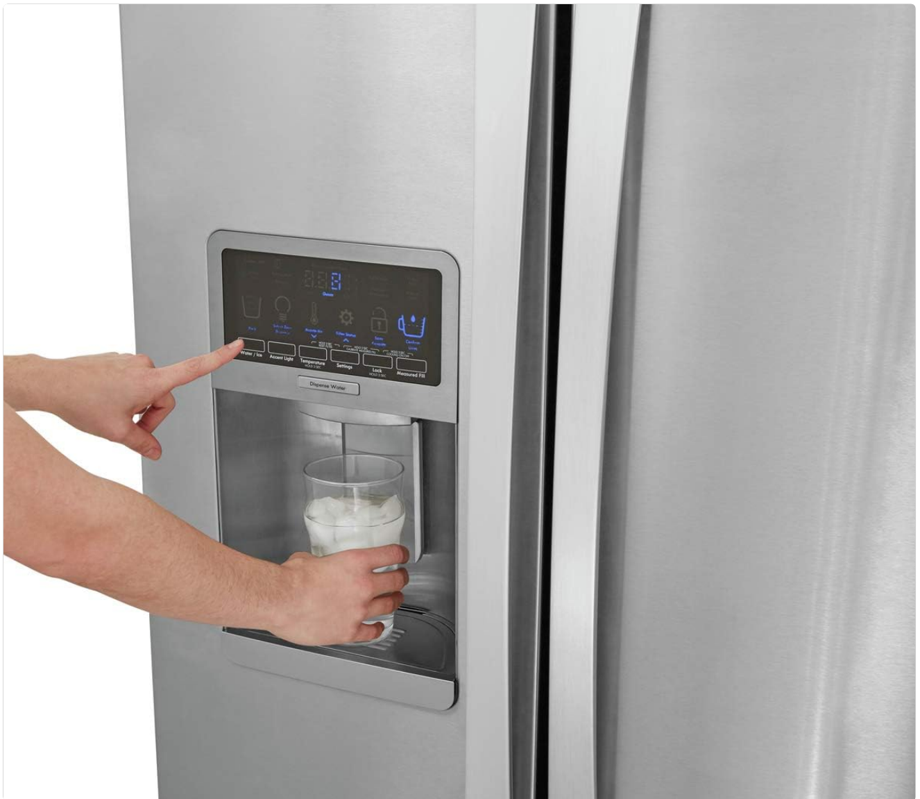
Figure 5: A user's hand pressing the lever on the external ice and water dispenser of the Kenmore Elite 51773 Refrigerator, with ice dispensing into a glass. The control panel above the dispenser shows various options.