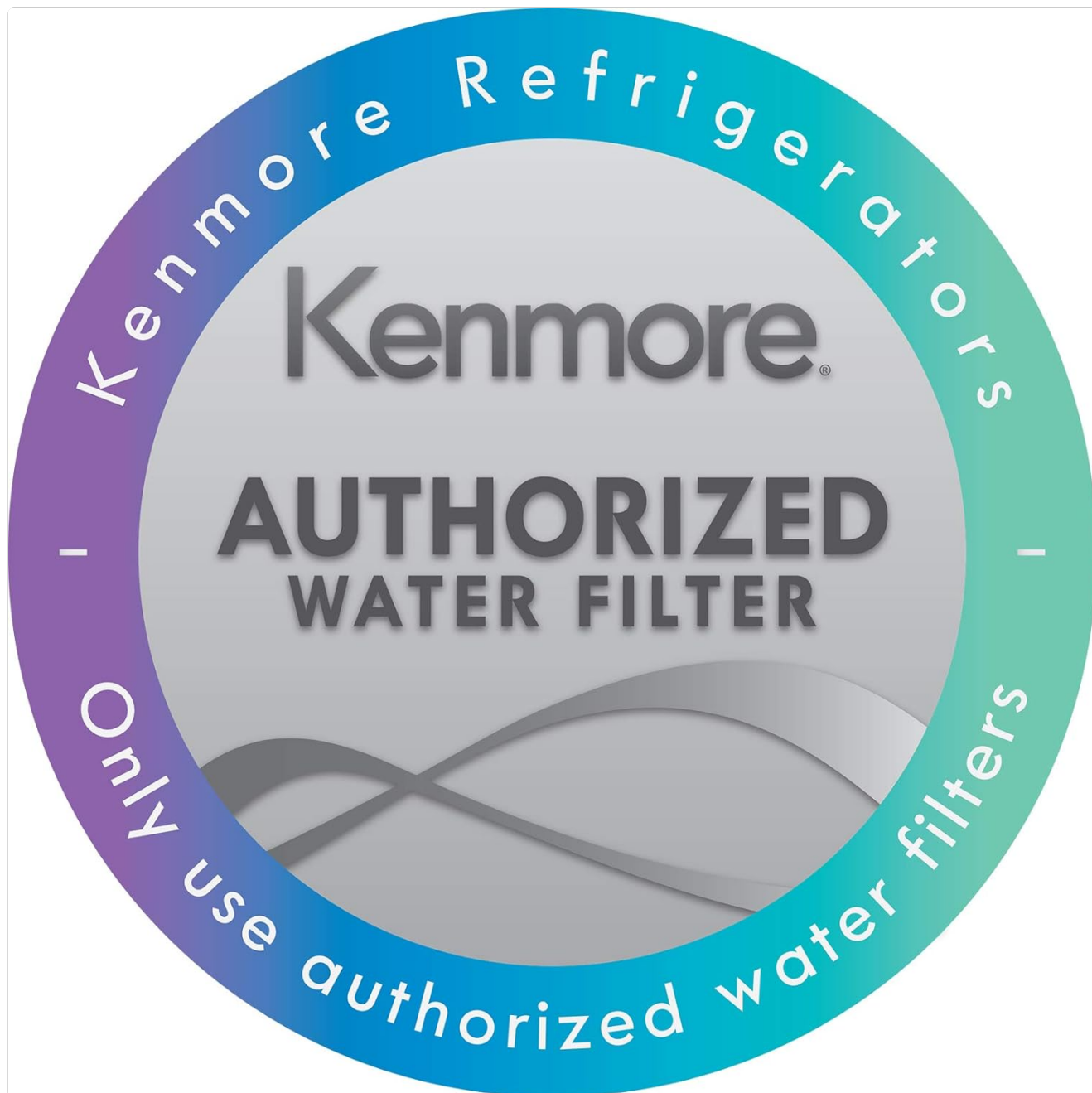
Figure 6: A circular label indicating "Kenmore Authorized Water Filter - Only use authorized water filters." This emphasizes the importance of using genuine replacement parts for optimal performance and warranty compliance.