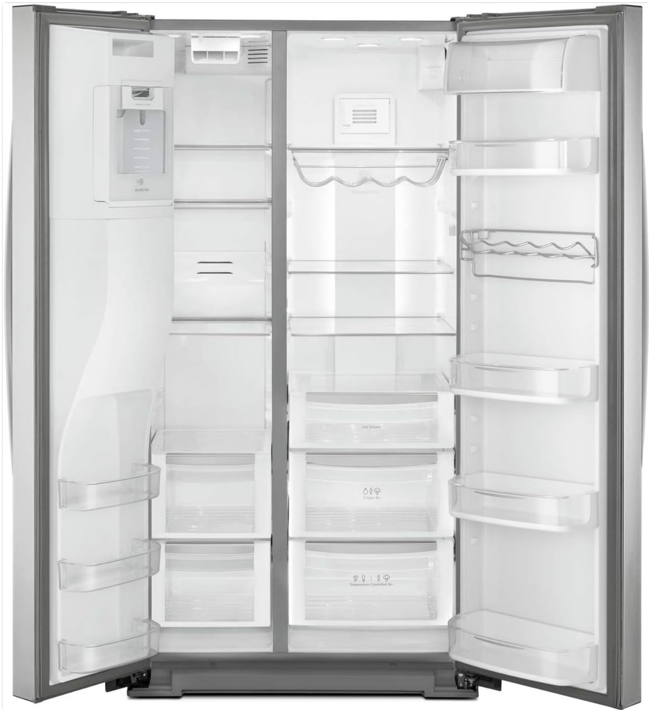
Figure 2: Interior view of the Kenmore Elite 51773 Refrigerator. The image shows the spacious fresh food compartment on the right with multiple adjustable glass shelves and three clear crispers at the bottom. The freezer compartment on the left features wire shelves and the SpaceSaver Ice System.