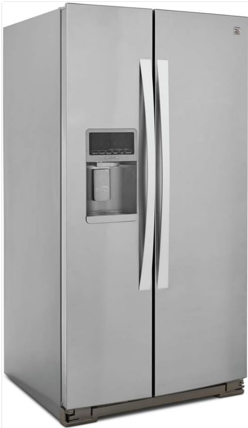
Figure 1: Front view of the Kenmore Elite 51773 Side-by-Side Refrigerator in Stainless Steel. This image displays the dual doors, the external ice and water dispenser on the left door, and the sleek stainless steel finish.