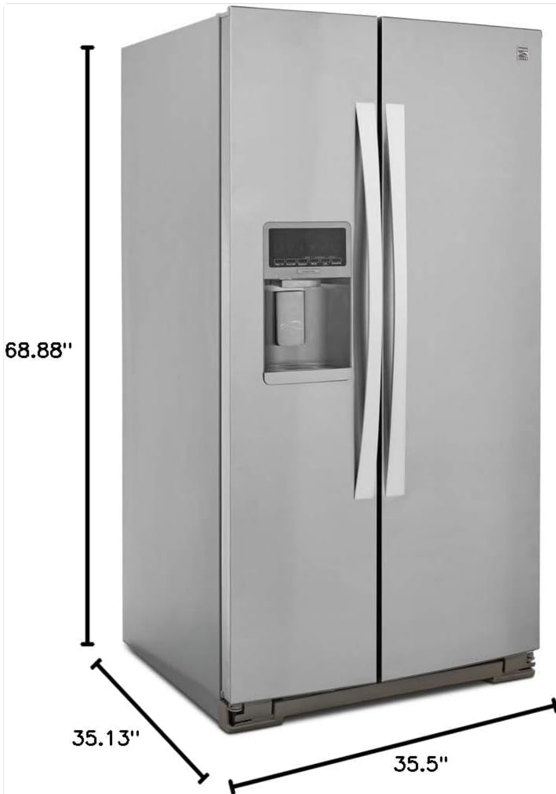
Figure 4: Dimensional drawing of the Kenmore Elite 51773 Refrigerator, showing its height (68.88 inches), depth (35.13 inches), and width (35.5 inches).