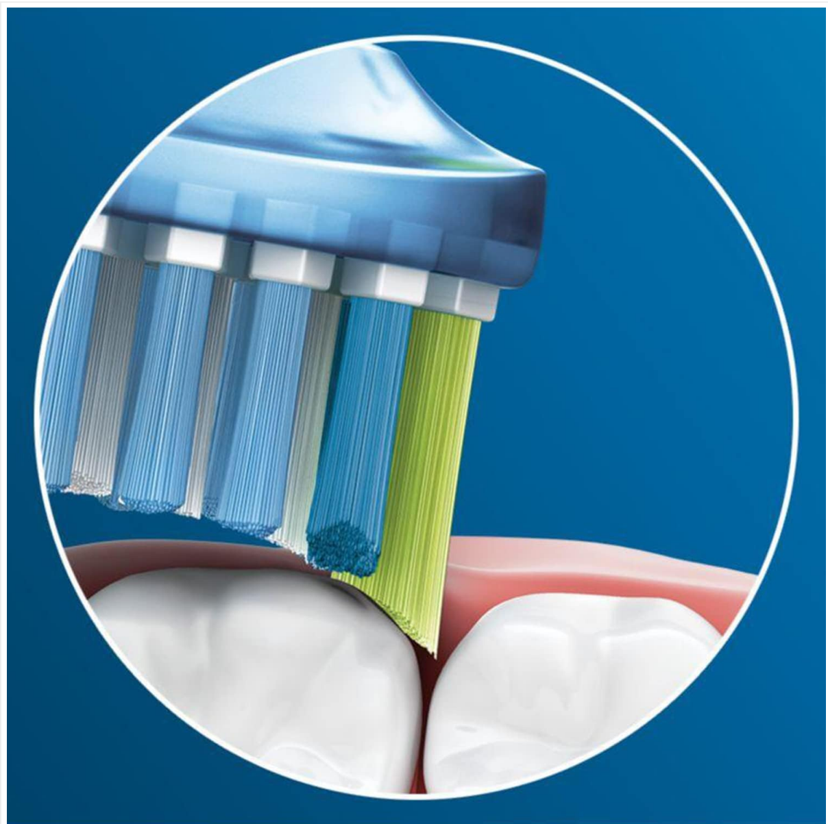
Image: An illustration demonstrating how the Philips Sonicare brush head effectively cleans the tooth surface and along the gumline.