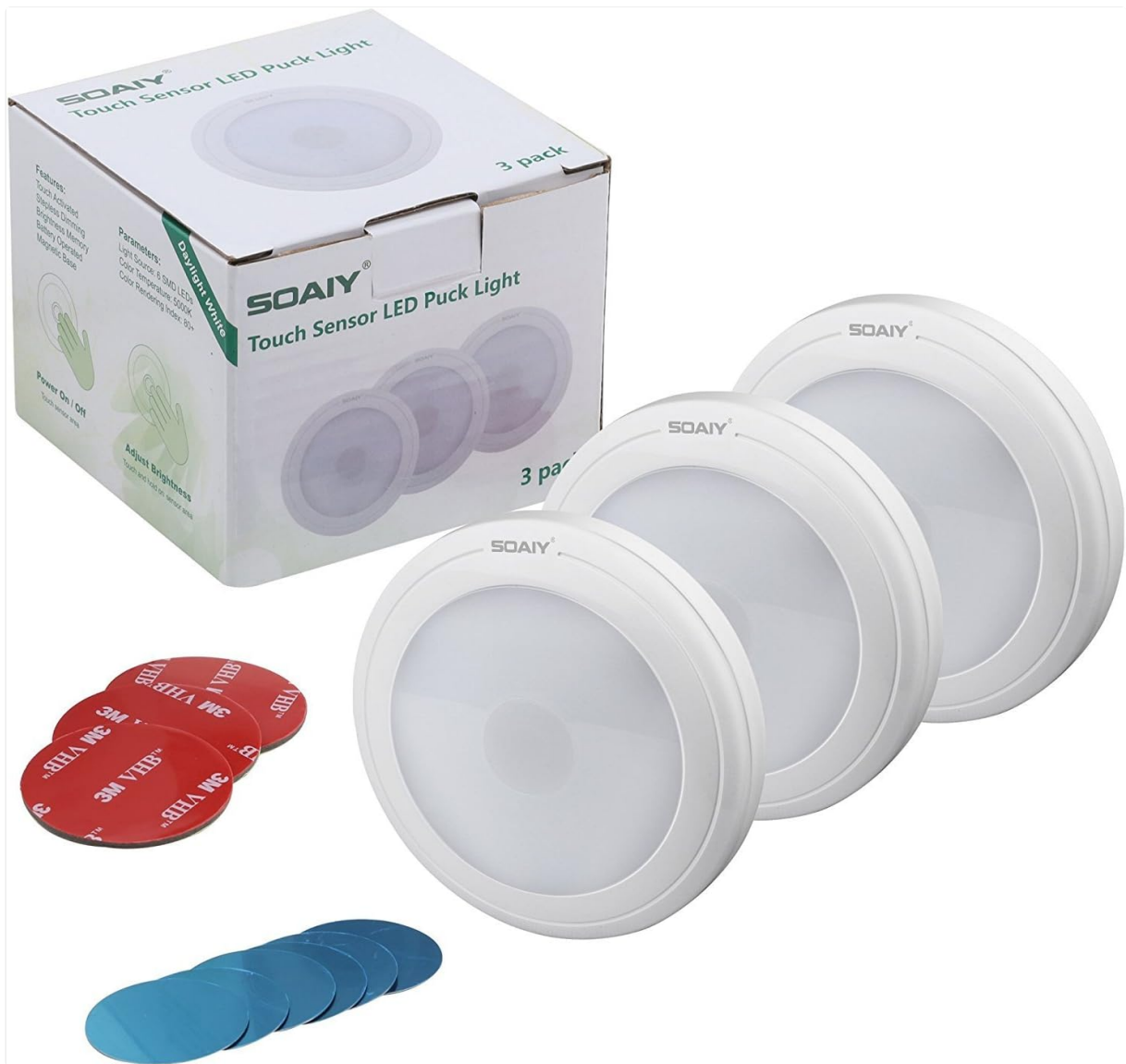
Image: Package contents showing three SOAIY Touch LED Night Lights, 3M adhesive pads, and metal plates.