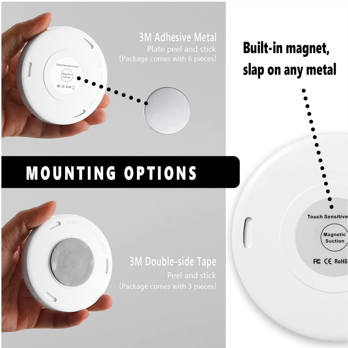
Image: Mounting options illustrating direct magnetic attachment and use of 3M adhesive with metal plates.