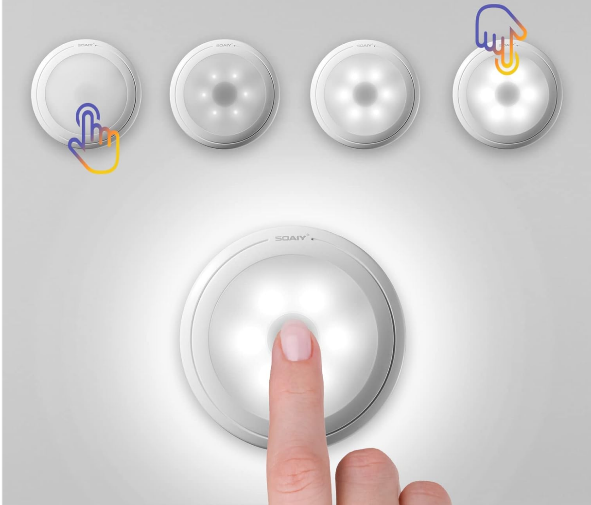
Image: Demonstrating the long-press function for stepless dimming.