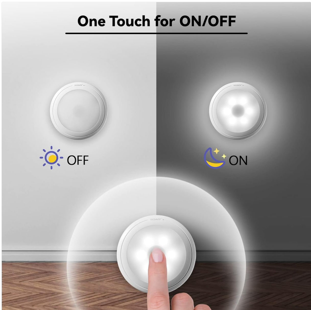
Image: One-touch functionality for turning the light on and off.