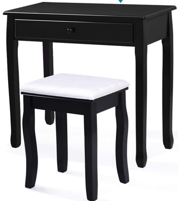
Figure 2: Illustration of the detachable mirror stand and its conversion to a writing desk.