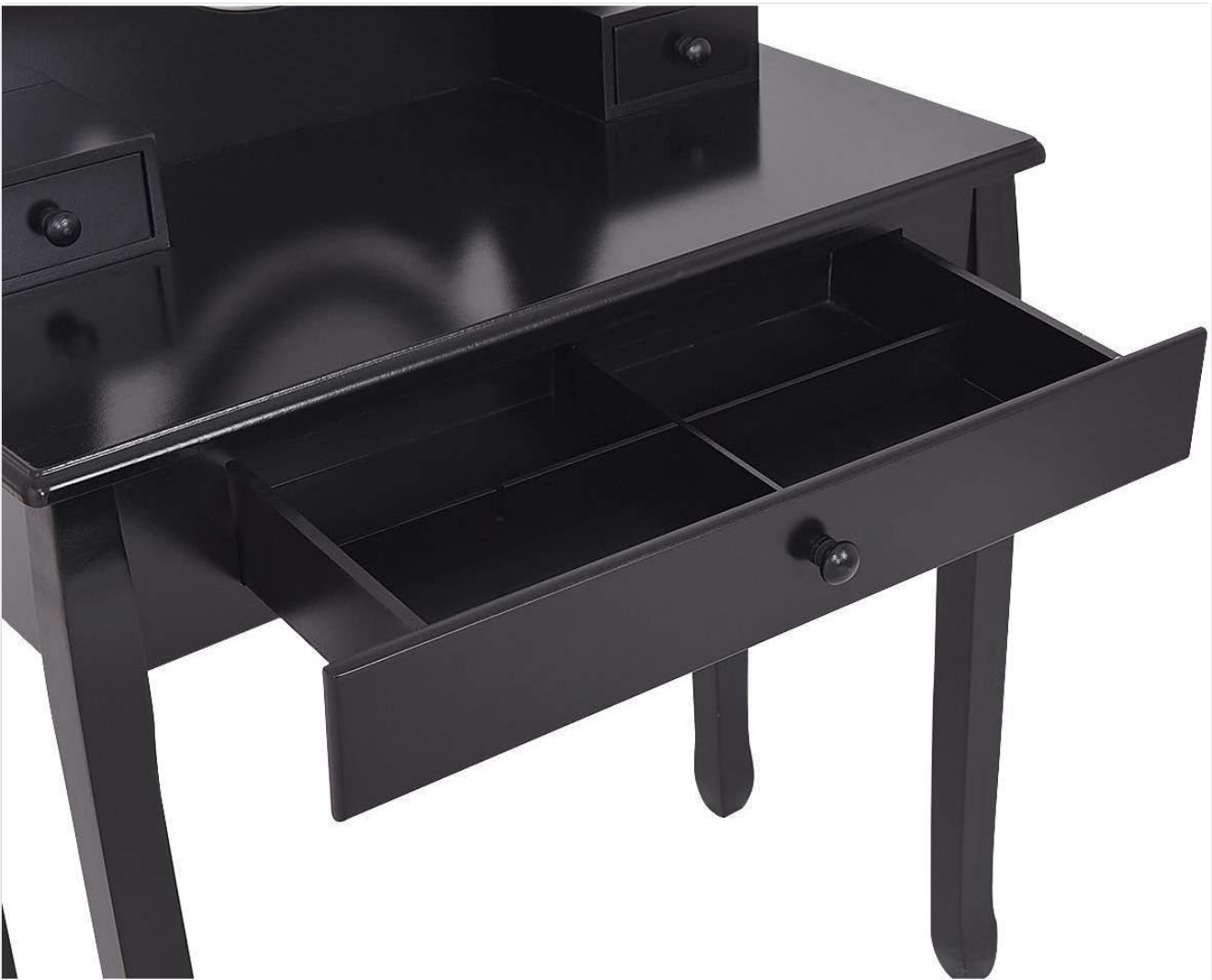
Figure 4: Interior view of a drawer, showing separate storage compartments.