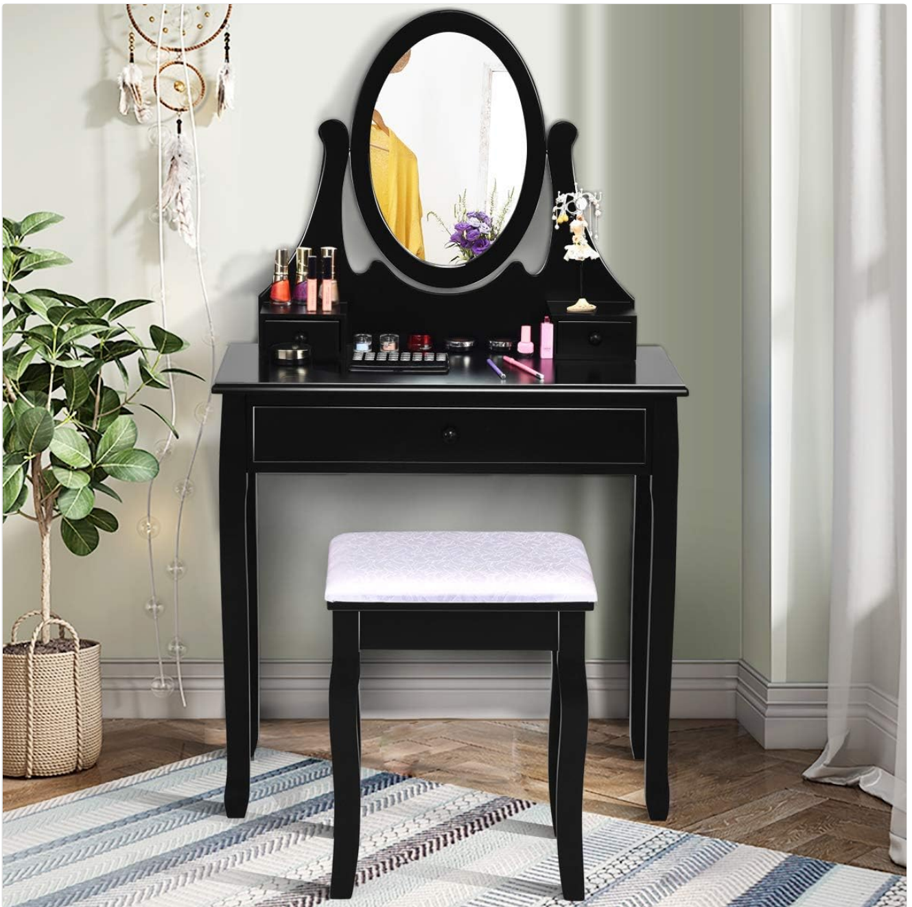
Figure 1: Complete Giantex Vanity Set with Oval Mirror and Cushioned Stool.