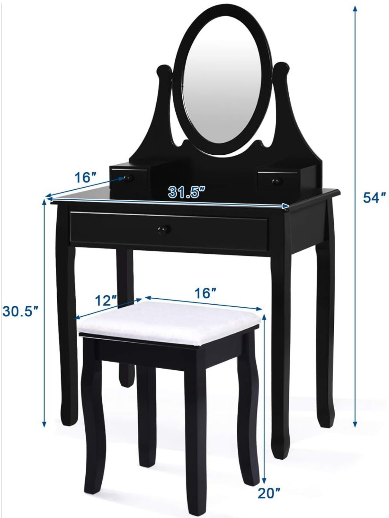
Figure 5: Detailed dimensions of the Giantex Vanity Set and Stool.