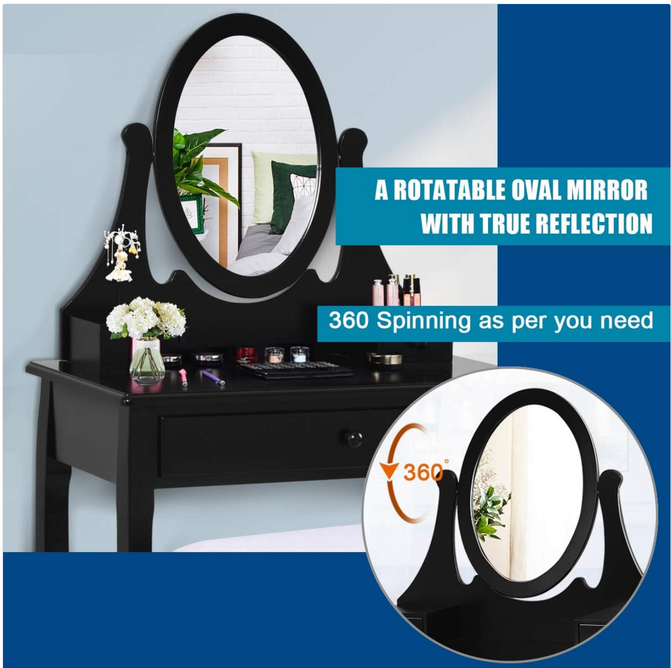
Figure 3: The oval mirror can be rotated 360 degrees for optimal viewing.