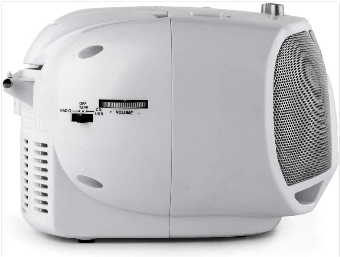
Figure 3: Side view illustrating the rotary switch for selecting functions (OFF, TAPE, CD, USB, RADIO) and the volume control.