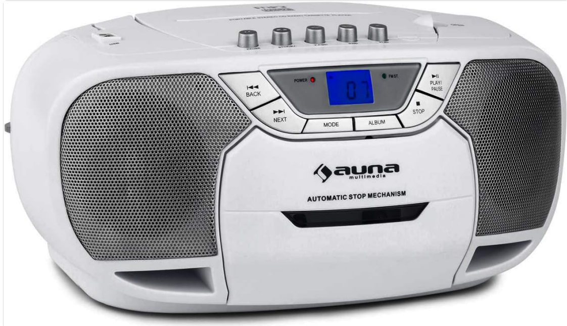
Figure 1: Front view of the Auna BeeBerry Boom Box, showing the main unit with speakers, control panel, and tape deck.

Familiarize yourself with the various parts and controls of your Auna BeeBerry Boom Box.