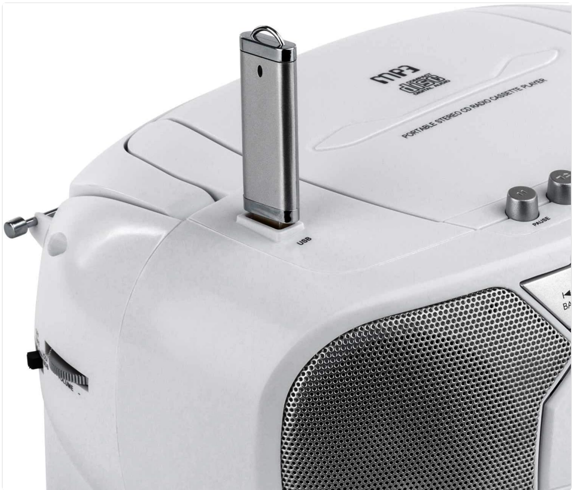
Figure 5: Close-up view of the USB port located on the top of the unit, demonstrating where to insert a USB mass storage device.