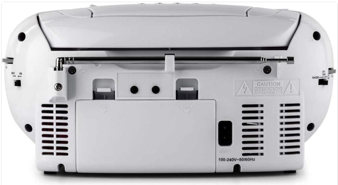
Figure 4: Rear panel of the boom box, highlighting the AC power input, AUX input, headphone output, and battery compartments.