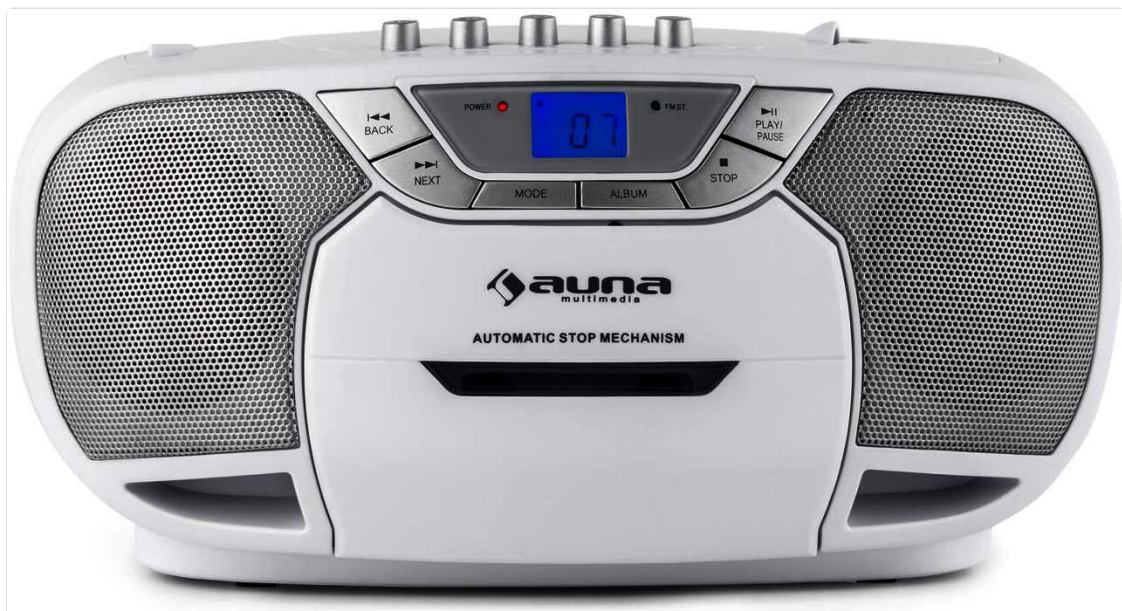
Figure 2: Detailed view of the control panel, including power button, LCD display, FM/ST indicator, play/pause, stop, back, next, mode, and album buttons.