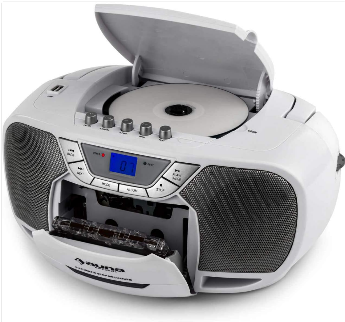
Figure 6: Top view showing the open top-loading CD compartment and the front-loading tape deck, ready for media insertion.