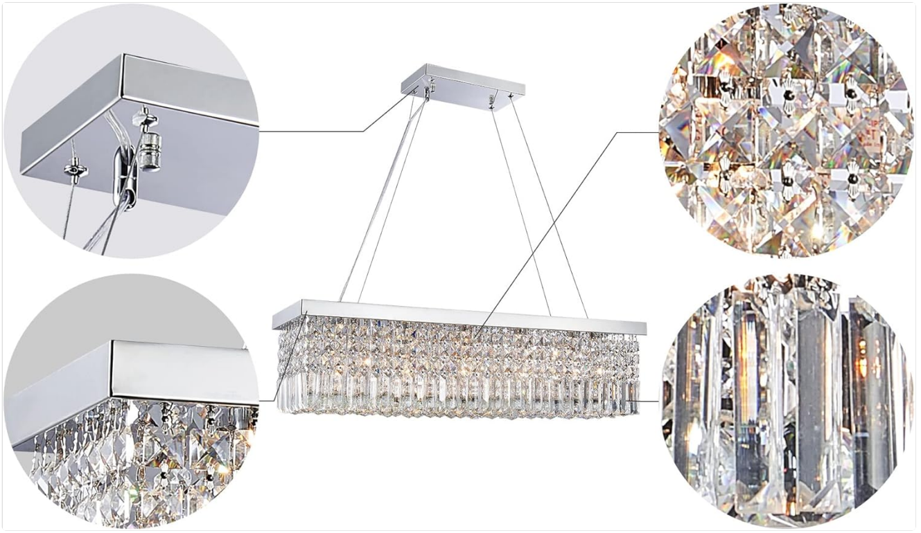
Figure 2: Component Details. This image provides detailed views of the chandelier's construction, showing the secure ceiling attachment mechanism, the connection points for the crystal strands, and the intricate facets of the K9 crystals.