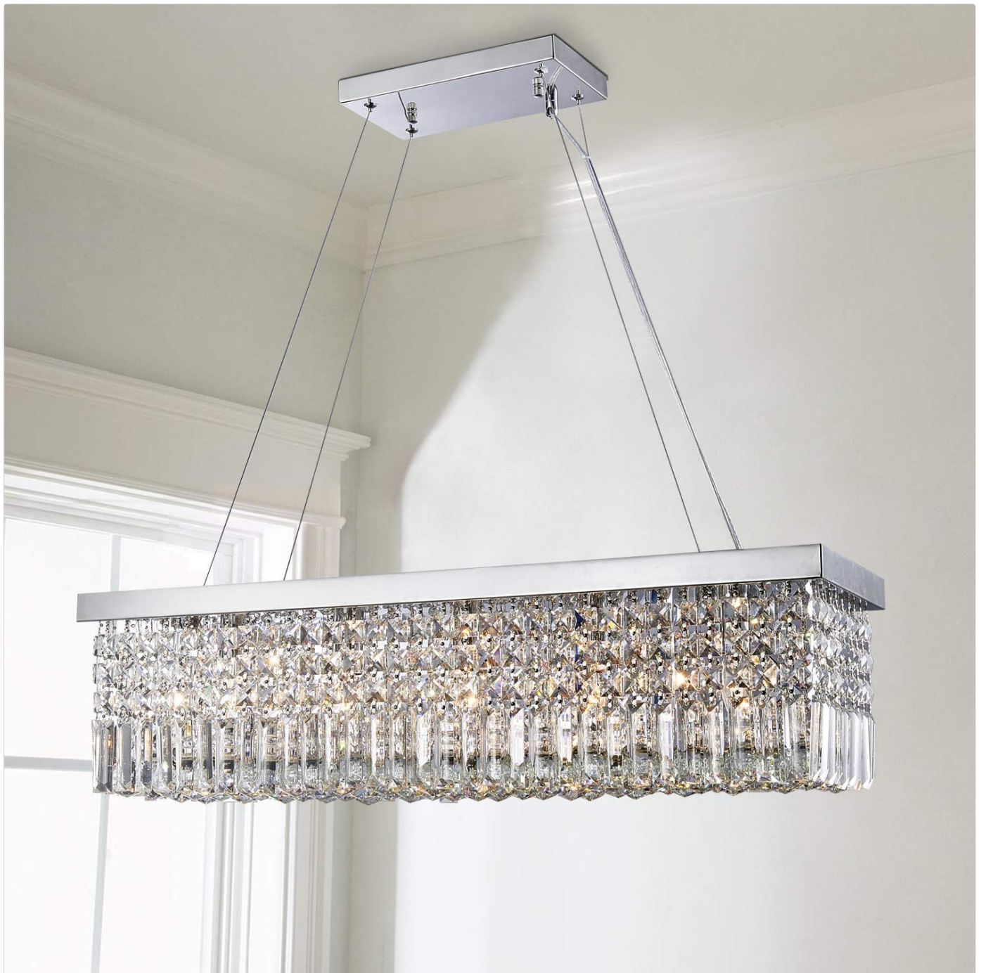
Figure 3: Installed Chandelier. A view of the fully assembled and installed chandelier, highlighting its elegant appearance and how it complements a modern interior space.