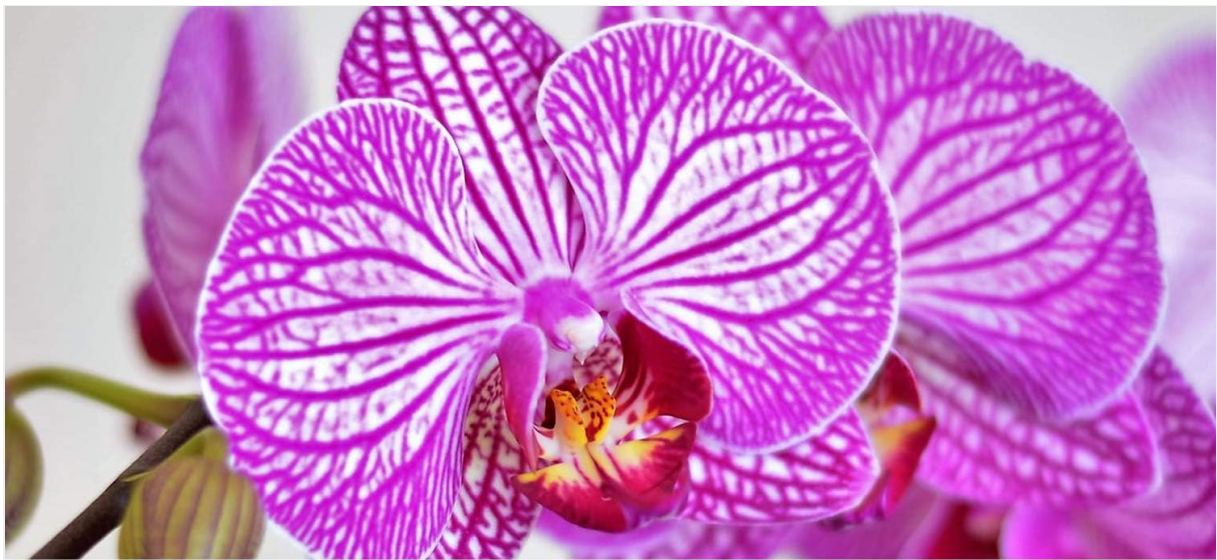
WITHOUT MACRO LENS