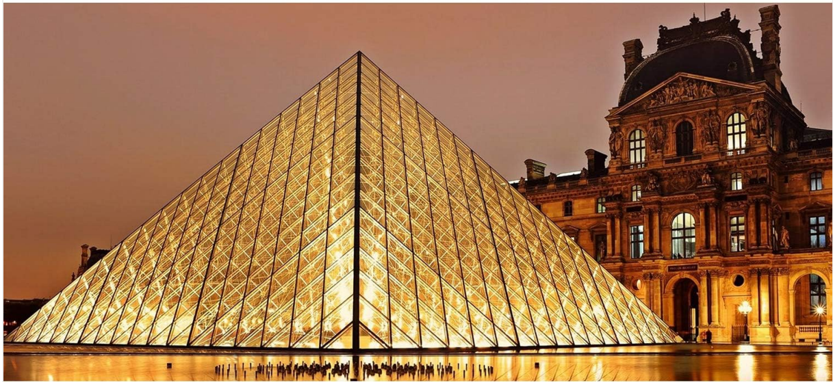
WITH NEEWER 0.43X WIDE ANGLE LENS

Image: A visual comparison demonstrating the expanded field of view when using the Neewer 0.43x wide-angle lens compared to a standard lens.