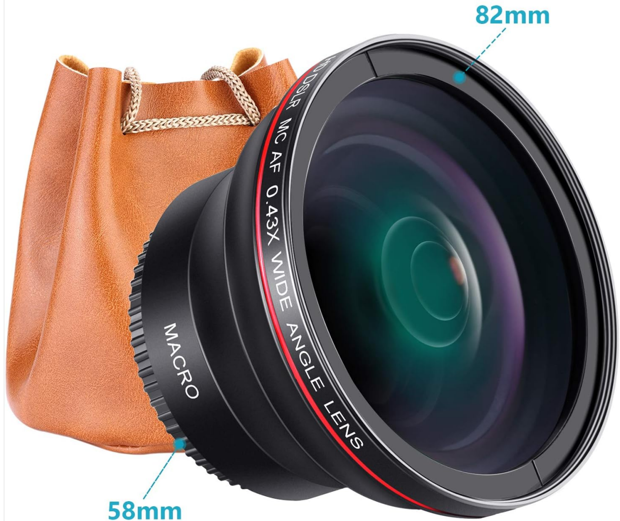
Image: The Neewer 58MM 0.43x Wide Angle and Macro Lens, shown with its protective carrying pouch. The lens features a 58mm thread for attachment to compatible camera lenses and an 82mm front filter thread.