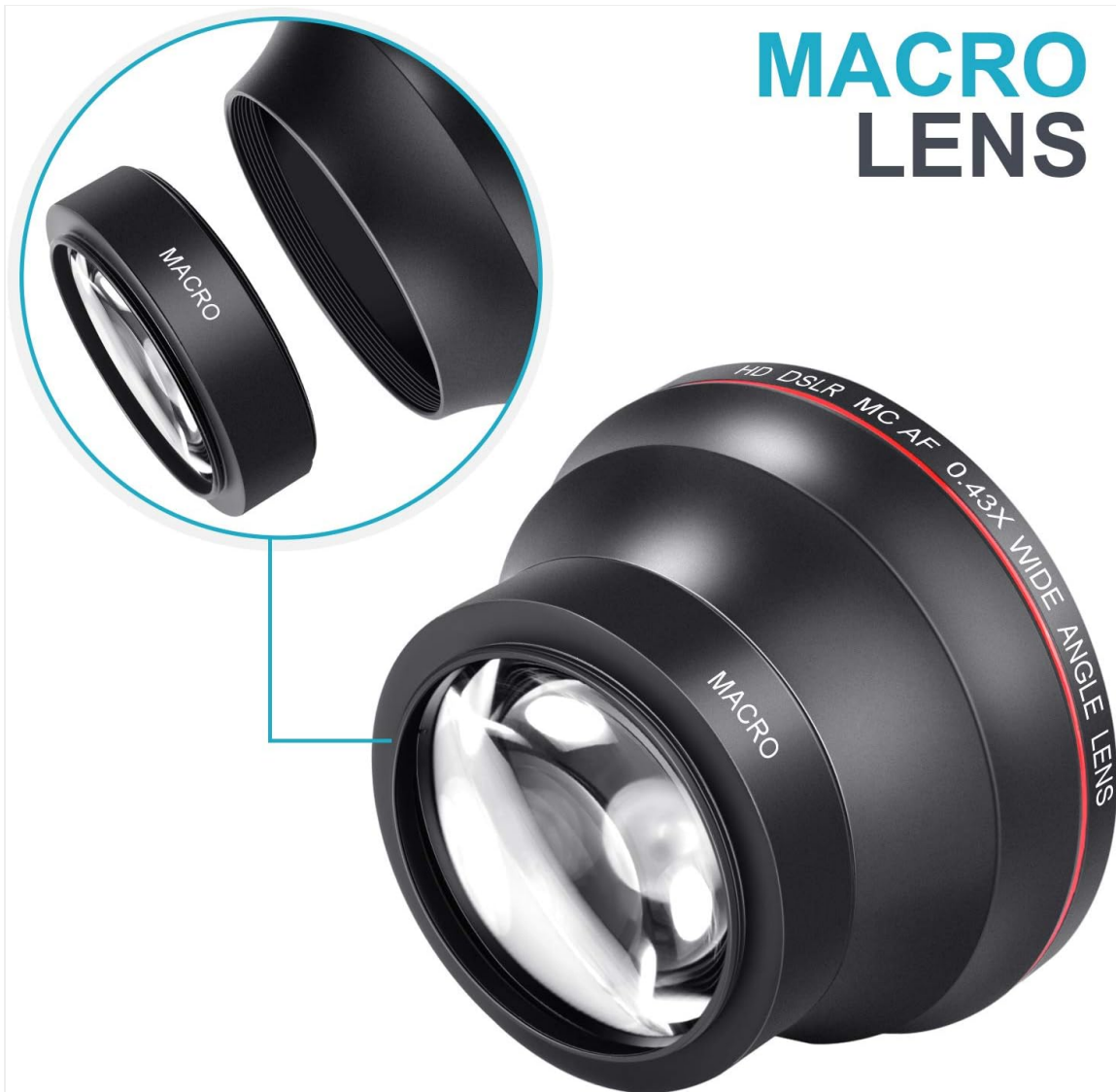
Image: An exploded view illustrating how the wide-angle lens separates into its two components: the wide-angle element and the macro lens.