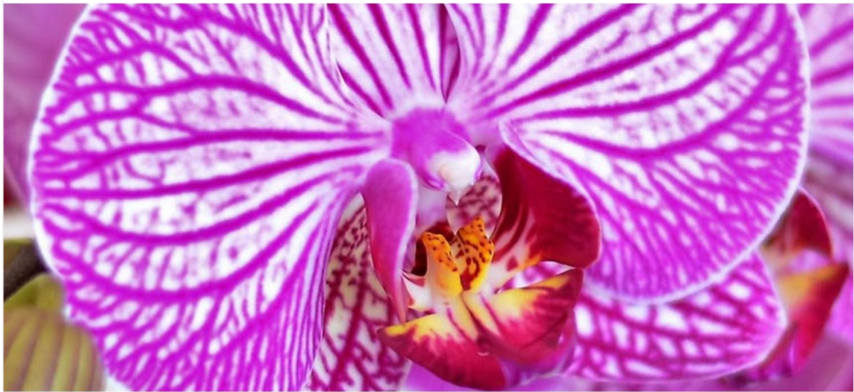
WITH NEEWER MACRO ATTACHMENT

Image: A visual comparison demonstrating the enhanced detail captured with the Neewer macro attachment versus a standard lens, focusing on an orchid flower.