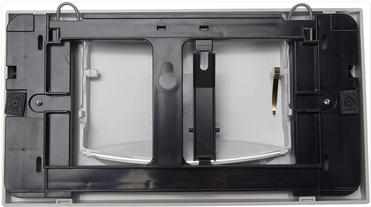
Rear view of the Geberit 200F Actuator Plate, showing the mounting points and internal mechanism. This view is helpful for understanding how the plate connects to the cistern.