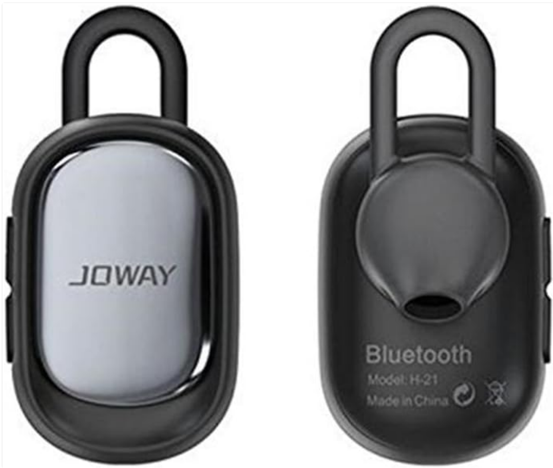
Image: Front and back view of the JOWAY H21 Bluetooth Earphone, showing the JOWAY logo on the front and "Bluetooth Model: H-21" on the back.