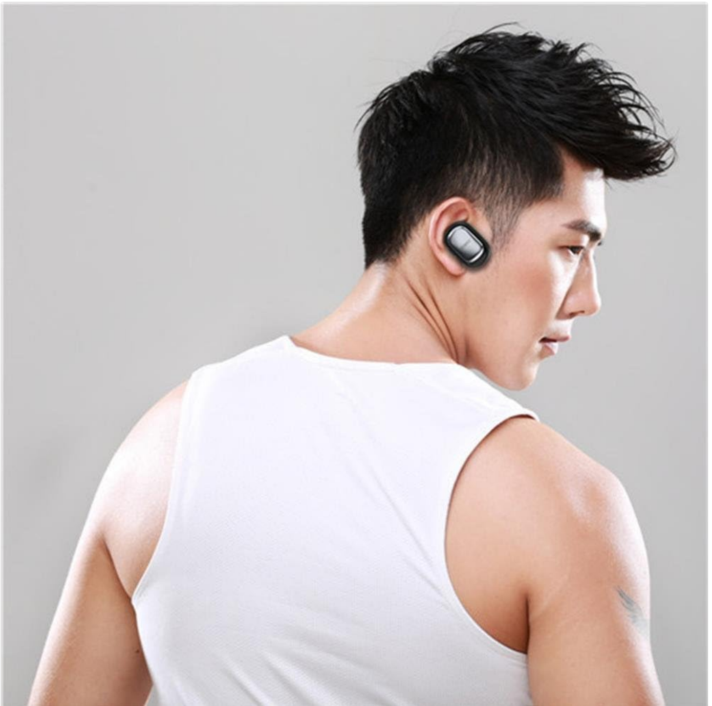
Image: A person wearing the JOWAY H21 Bluetooth Earphone in their right ear, demonstrating its discreet and comfortable fit.