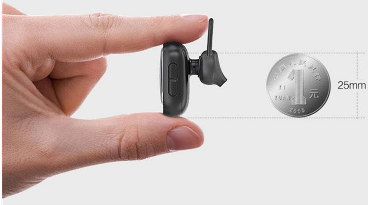
Image: The JOWAY H21 Bluetooth Earphone held between fingers, demonstrating its compact, coin-sized design next to a 25mm coin for scale.