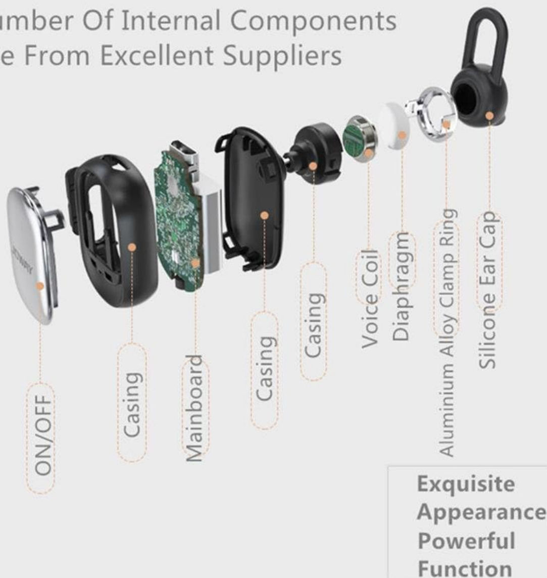
Image: An exploded diagram showing the internal components of the JOWAY H21 earphone, including the casing, mainboard, voice coil, diaphragm, aluminum alloy clamp ring, and silicone ear cap.

A Number Of Internal Components Come From Excellent Suppliers