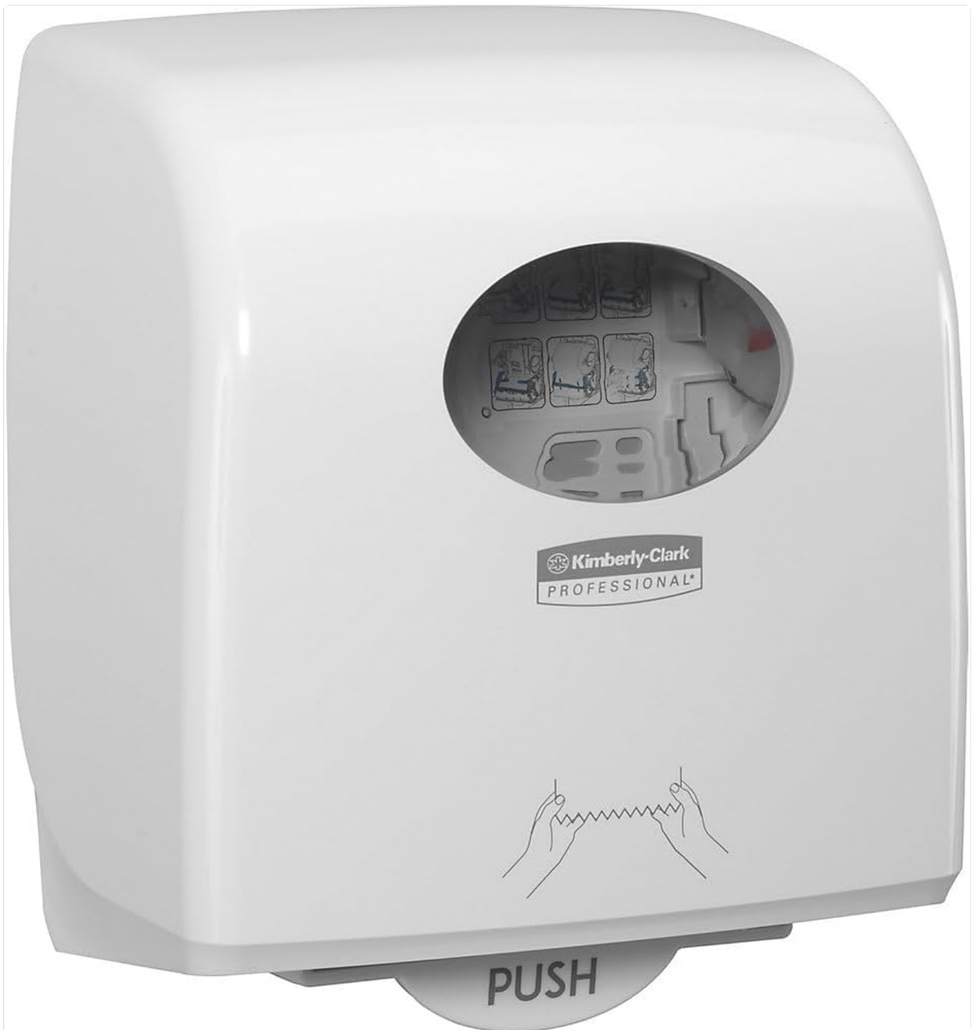
Figure 2.1: Front view of the Aquarius Slimroll Rolled Hand Towel Dispenser, showing the white casing and the viewing window for the paper roll.