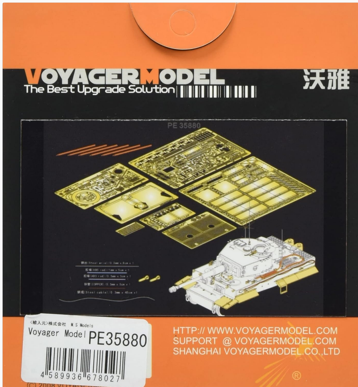
Image 1: Contents of the Voyager Model PE35880 etching set, showing multiple photo-etched sheets, a grinding rod, and a resin tow wire tag eye.