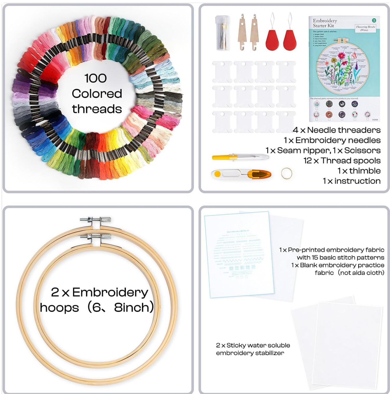
Image: All components included in the Caydo Embroidery Kit, neatly arranged.