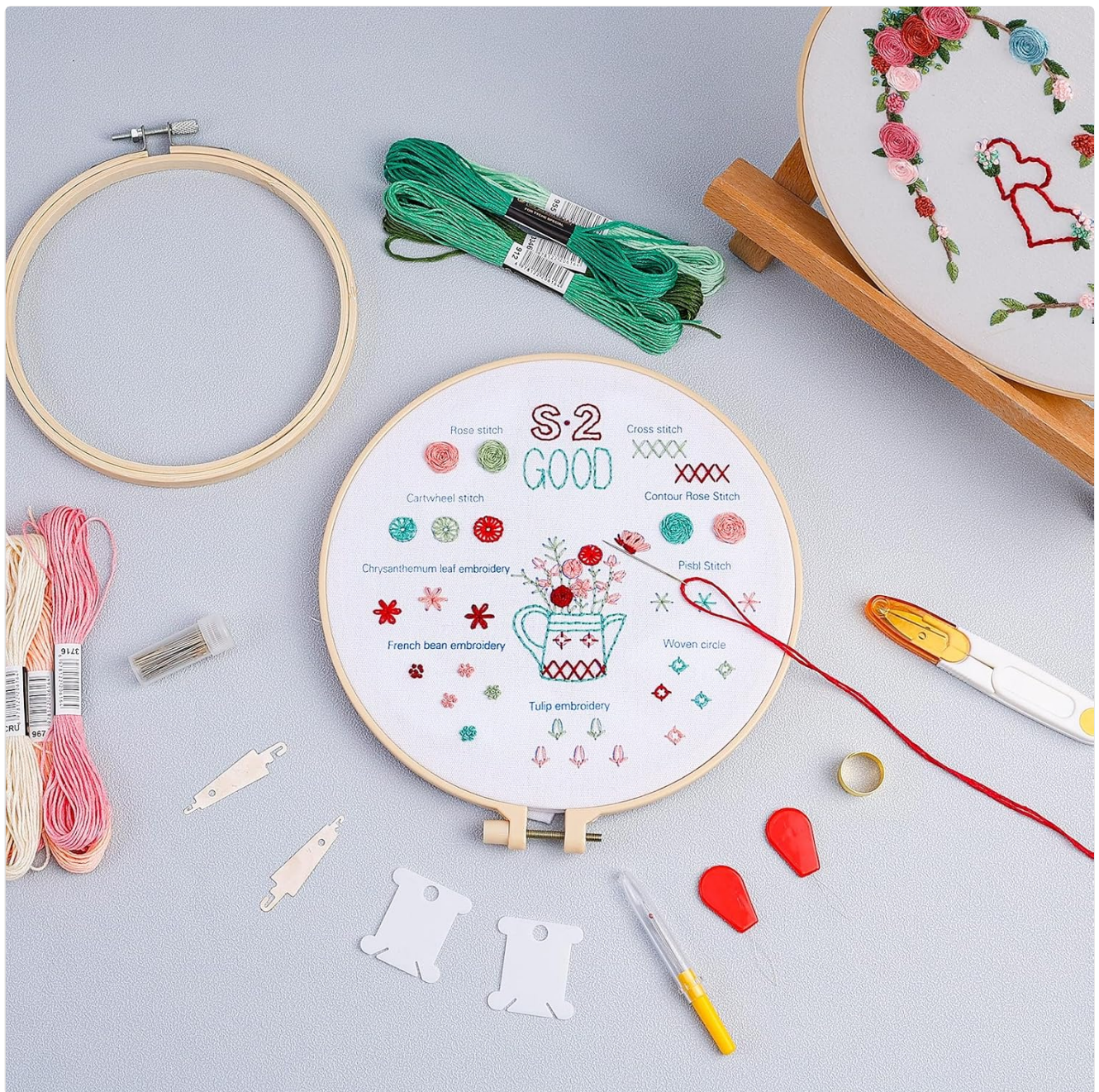
Image: An embroidery project in progress, showcasing detailed stitching.