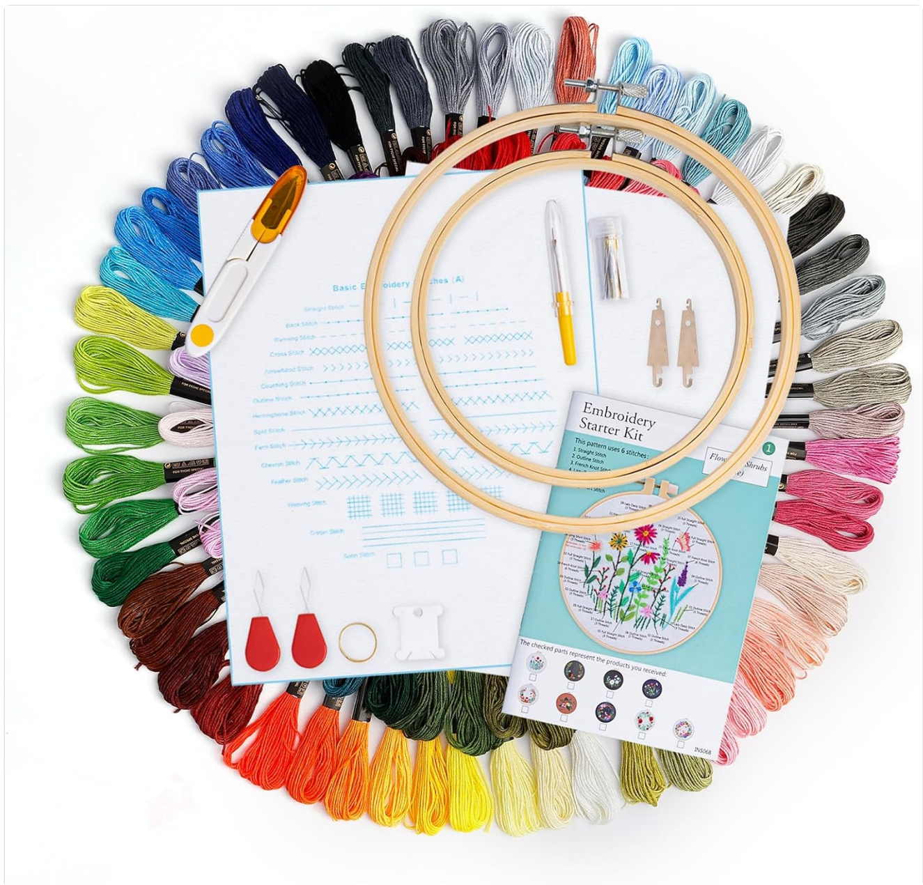
Image: The Caydo Embroidery Kit, featuring two embroidery hoops and a wide selection of threads.